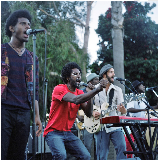
Afrolicious performs at 3rd on Third, a community arts celebration in the Bayview.