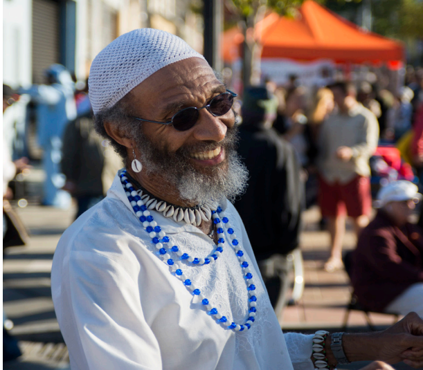
3rd on Third, a monthly community arts celebration in the Bayview.

and related accountability in the programs provided; proper care for the Civic Art Collection; and low visibility and awareness of the SFAC with the general public. These issues were touched upon by the majority of interviewees, across all stakeholder groups. In addition, there were issues particular to each stakeholder group; those issues are detailed below.