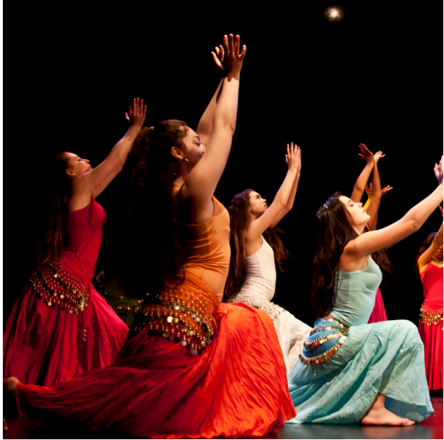
Students perform at the annual Youth Arts Summit, an afternoon of visual art, performance and workshops from various organizations in the Bay Area.

Ultimately, interviewees felt that the right leadership is in place and the timing is right to embrace an ambitious vision for the future that will bring greater clarity to the work of the SFAC. The goals and objectives detailed in this Strategic Plan articulate the SFAC's vision for the next five years as derived from these assessment findings and discussed with stakeholders through the strategic planning process.