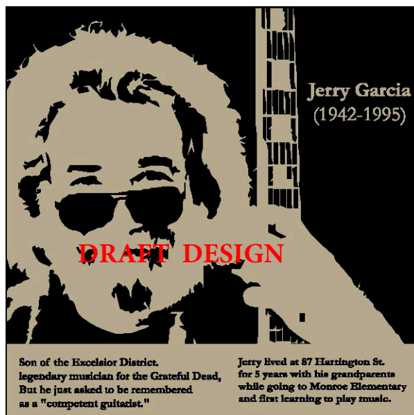
Draft design for Mission and Amazon