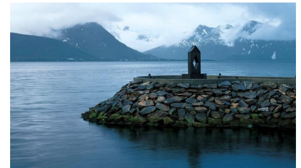
Ocean Eye, Sigurdur Gudmundsson