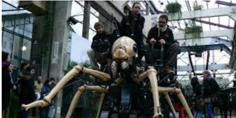
Les Machines de l'île Nantes, France