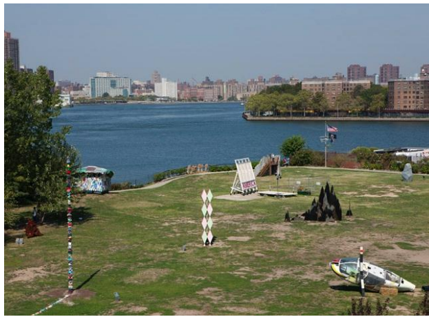
Socrates Sculpture Park (Long Island City, New York)