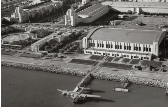
Military, the World's Fair and Pan Am Clipper flights