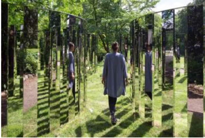
Brooklyn Bridge Park