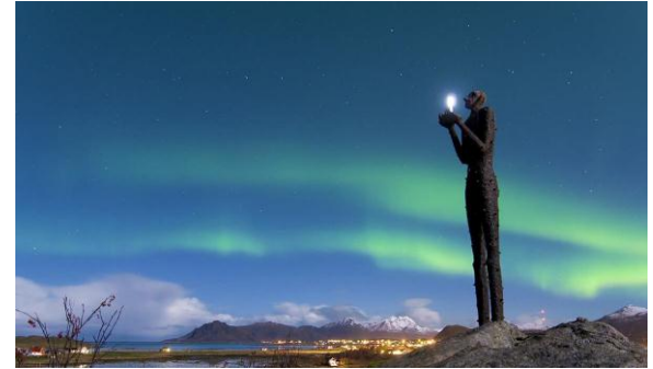
The man by the Sea, Vinjesjøen