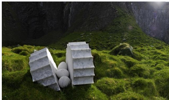
The Nest, Luciano Fabro