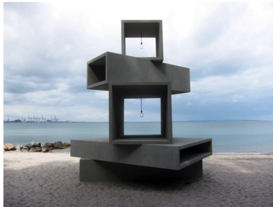
Thomas Lindvig, "Untitled" (2015)