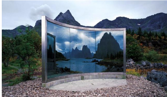
Untitled, Dan Graham