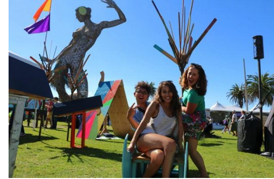
Artwork at the TIMF