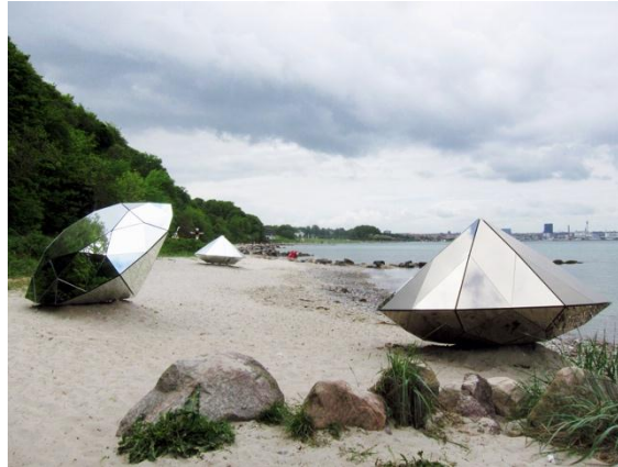
Michal Motyčka, "Diamonds" (2015)