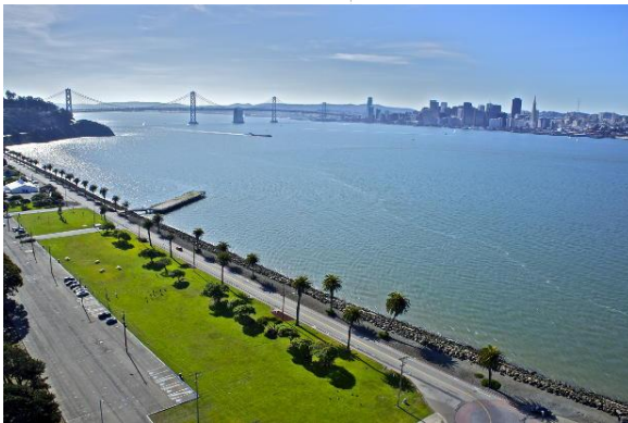
The Great Lawn, Treasure Island