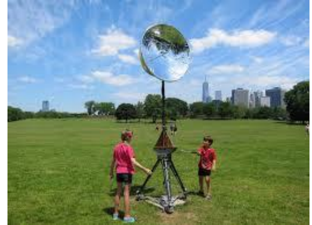
Governors Island (New York)