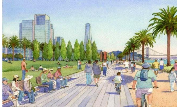
Waterfront Rendering of Treasure Island