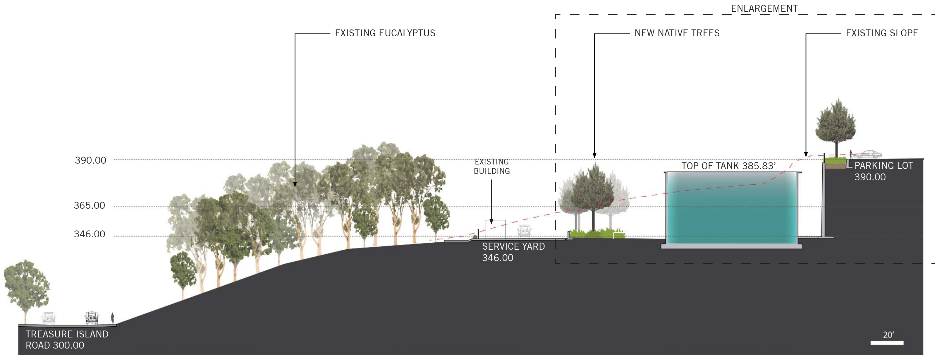
YBI - WATER TANK- TYPICAL SECTION