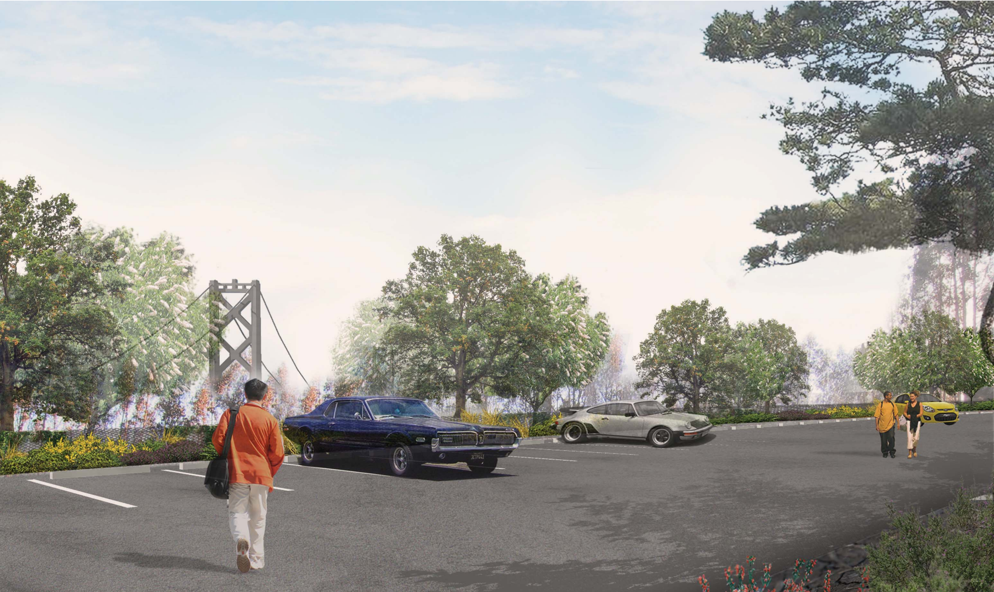
YBI - WATER TANK- VIEW FROM PARKING LOT WITH NEW TREES