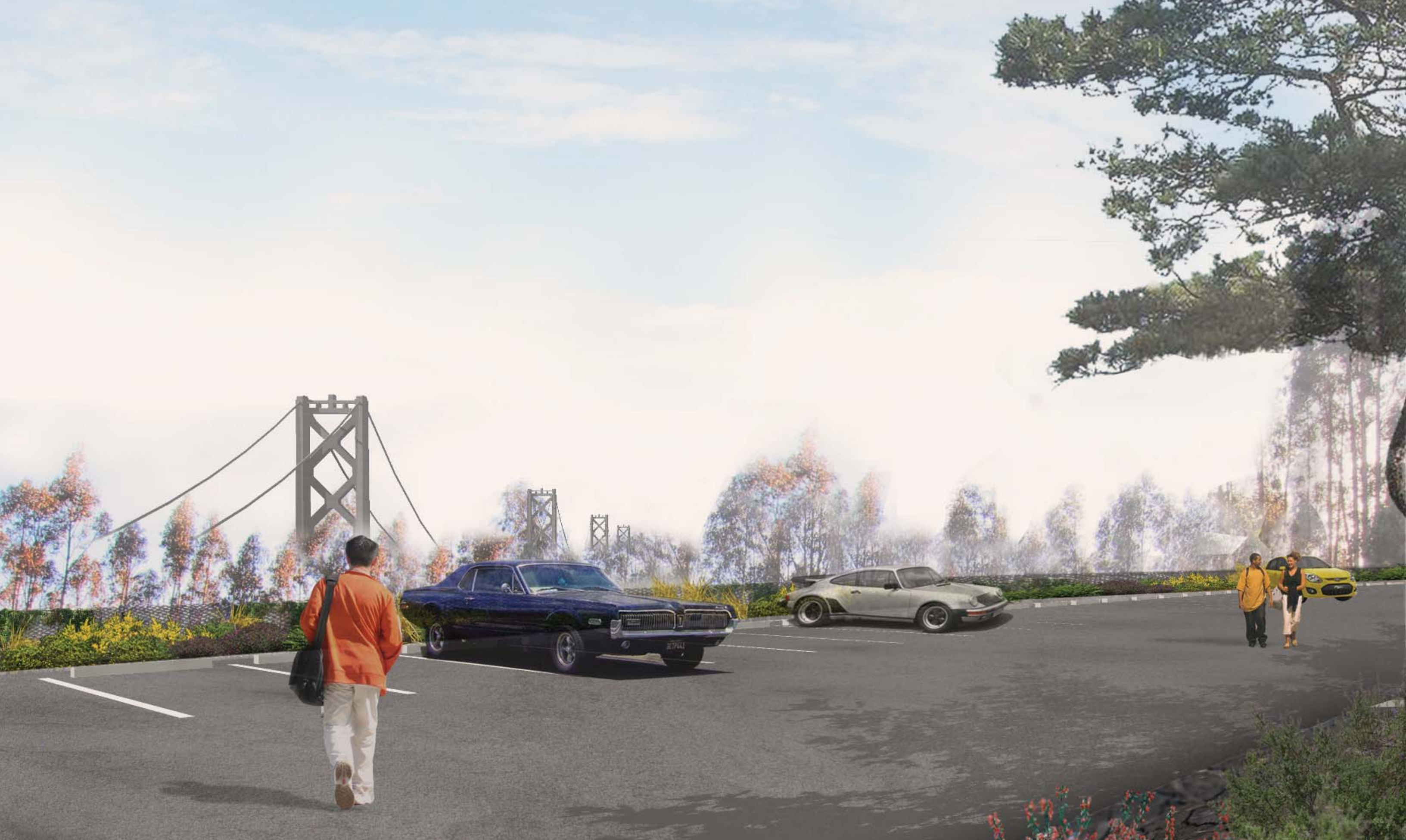
YBI - WATER TANK- VIEW FROM PARKING LOT WITHOUT NEW TREES