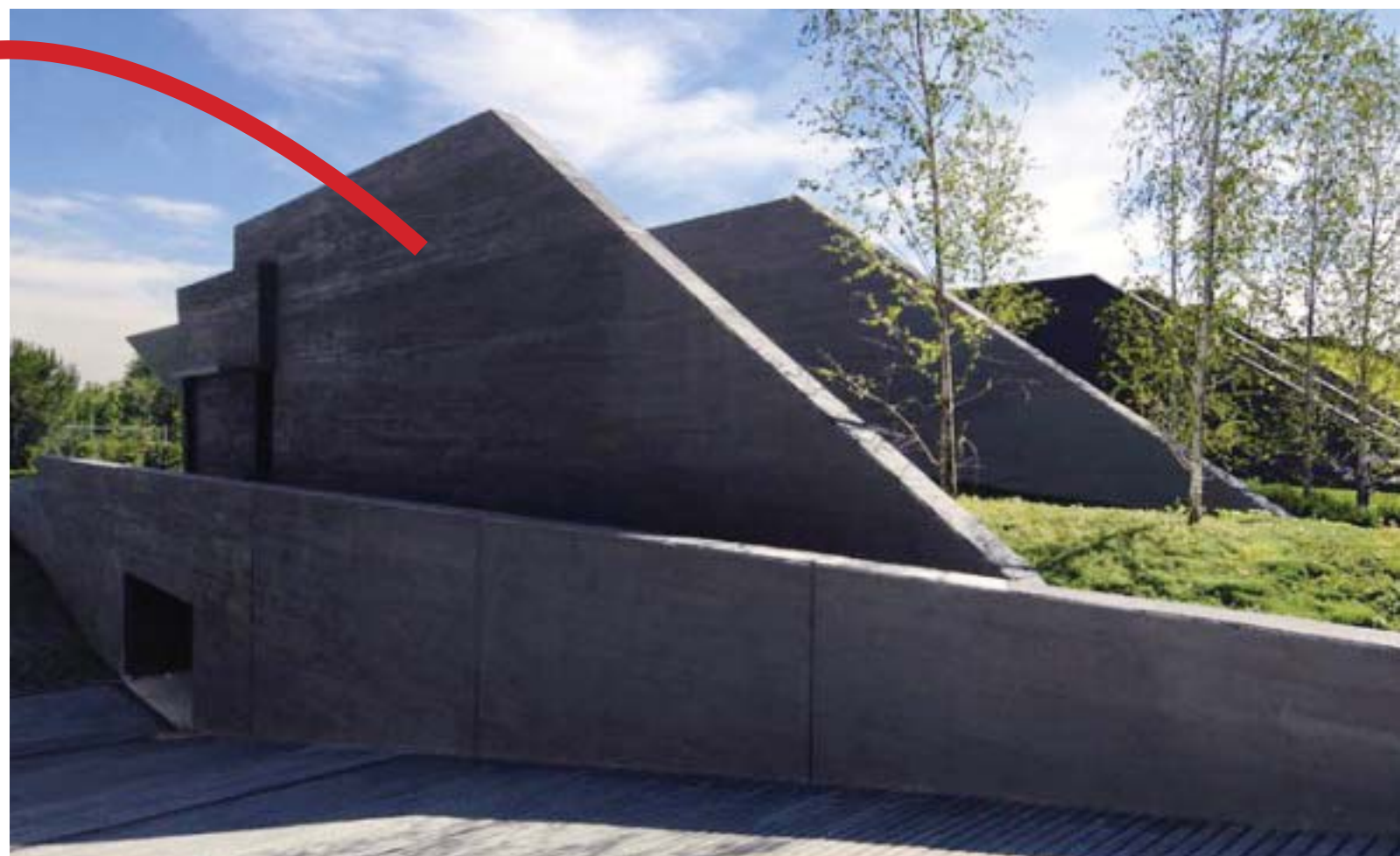
INTEGRAL COLORED CONCRETE - DARK GREY