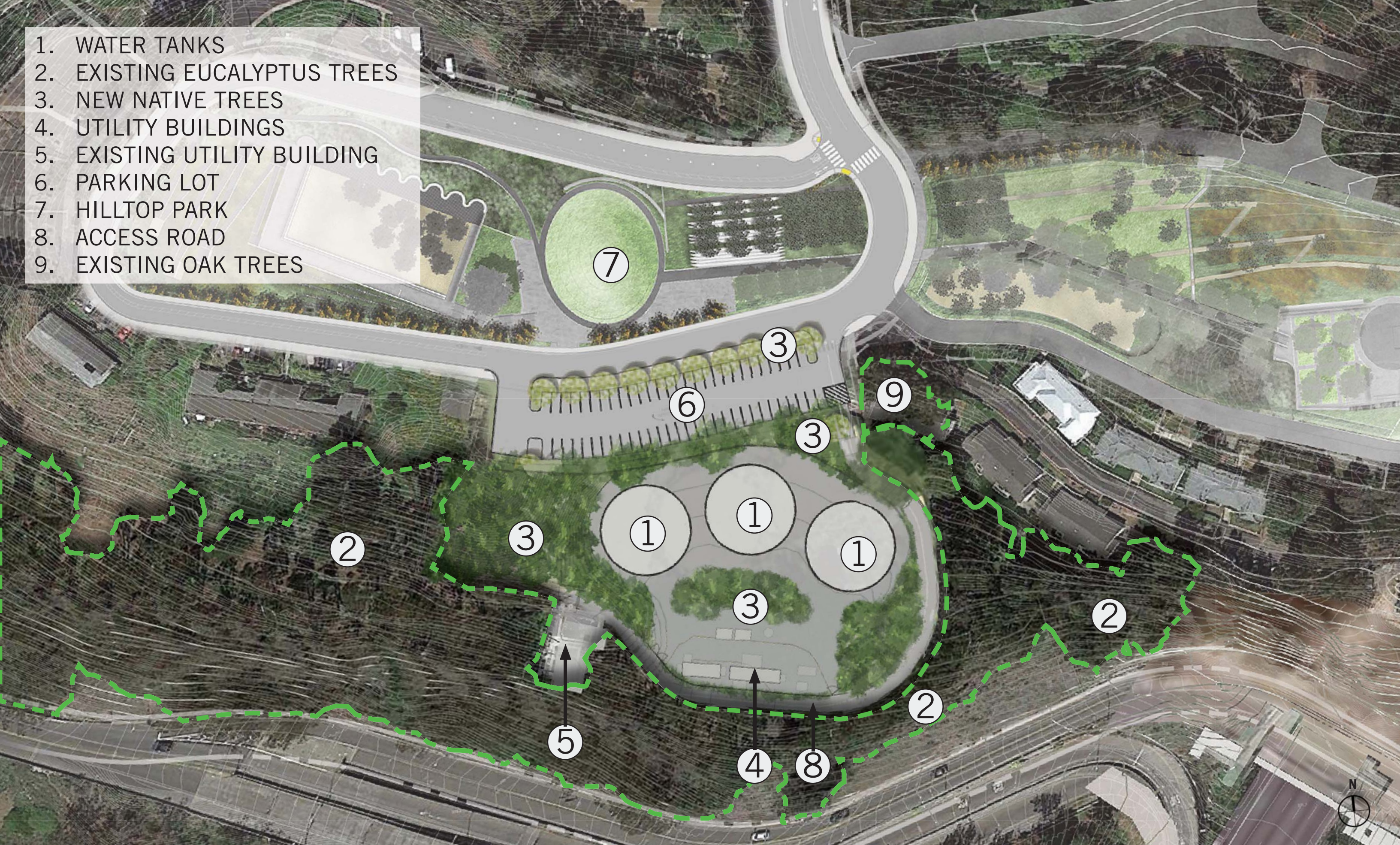
YBI - WATER TANKS SITE PLAN