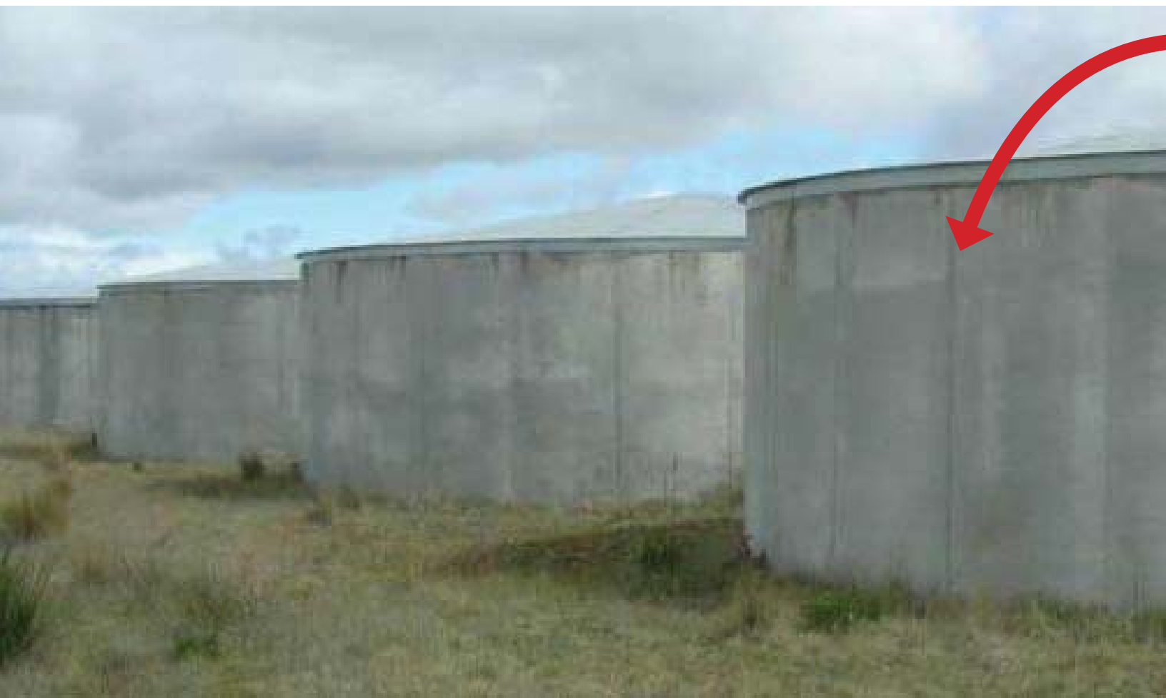
CONCRETE WATER TANKS