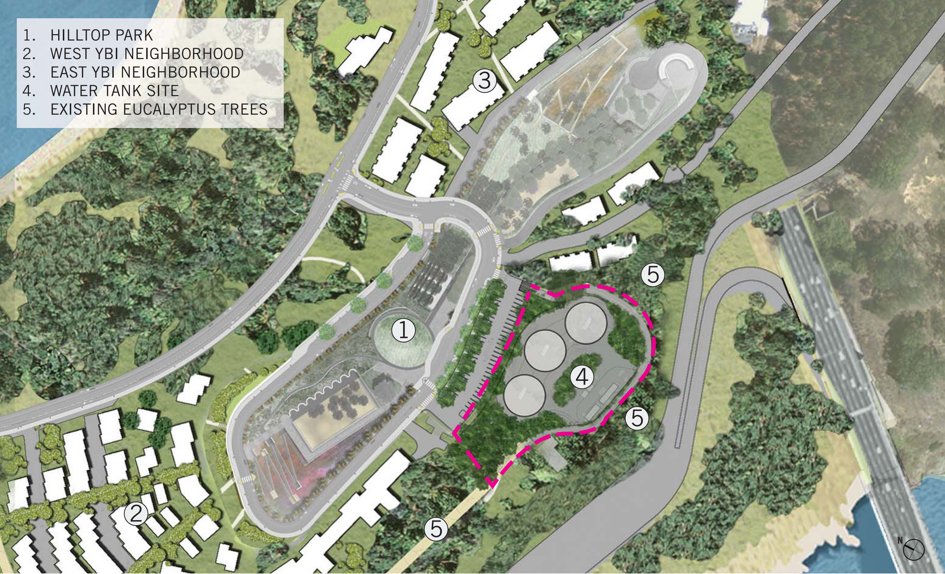
YBI - WATER TANKS SITE PLAN