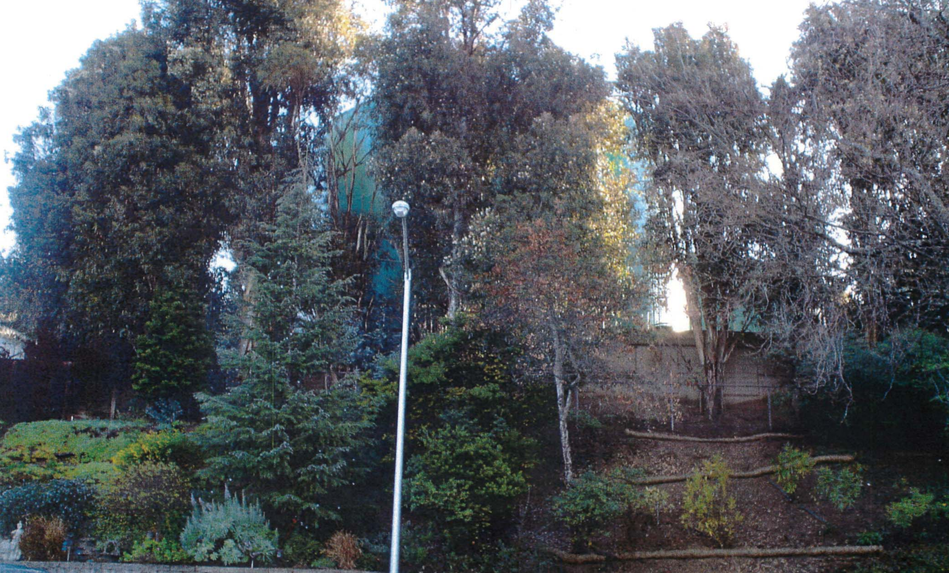
YBI - WATER TANK- SCREENING PRECEDENT