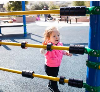
Ground Level Play Component Physical Activity Element

Composite play structures come in many forms, like metal & fiberglass, wood & timbers and net structures