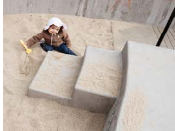
Transfer tier into sand pit