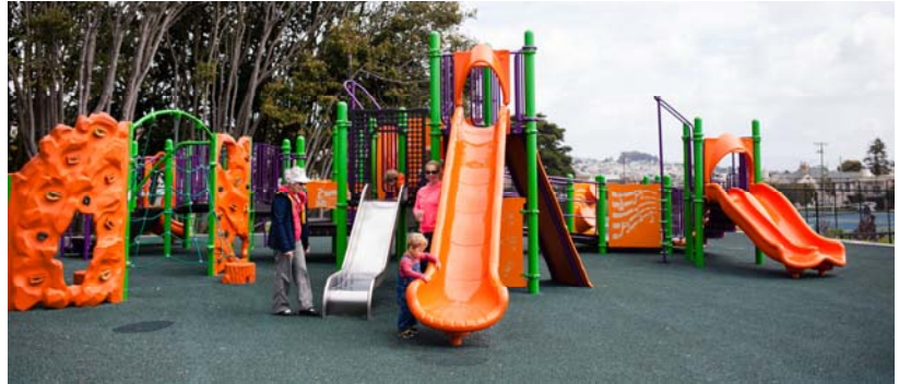
COMPOSITE PLAY STRUCTURE

The purpose for this checklist is to be transparent and predictable during the plan review and field inspection of all publicly funded playground projects. These projects are reviewed for quality control and assurance by the Mayor's Office on Disability, the Department of Public Works, the San Francisco PORT and others, in order to achieve compliance with the 2010 American's with Disabilities Act Accessibility Standards (2010 ADAS) . Play equipment requirements from the 2010 ADAS have also been incorporated into Section 11B-240 of the 2013 California (2013 CBC) and San Francisco Building Code which went into effect on January 1, 2014.