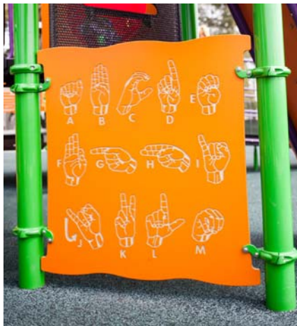
Braille Tactile Activity Panel