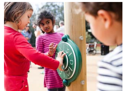
Ground Level Play Component Symbol ~ Search Game