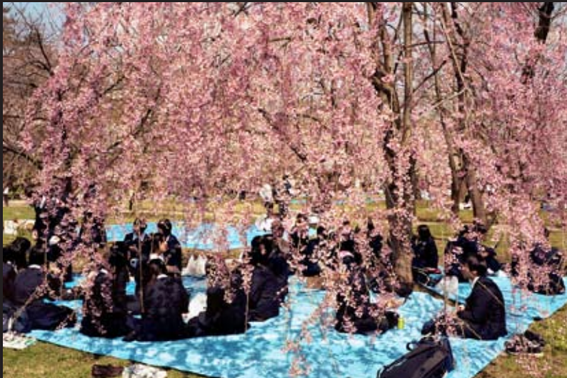
Eighteen Months: Taking the Pulse of Bay Area Photography Hiroyo Kaneko Picnics #01 , 2007 C-print