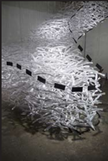
Paul Hayes Drawing from Another Dimension , 2007 Installation View at 155 Grove Street