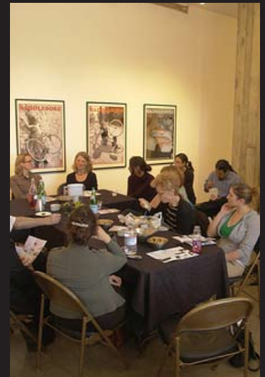
SFAC Gallery Brown Bag Lunch