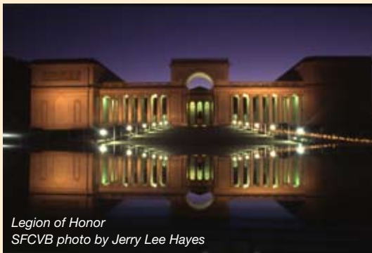
Legion of Honor

lions on Pier 39; and if you can't remember the last time you rode a cable car or ever saw a free summer concert in Stern Grove, then you've already found your ideal vacation spot!