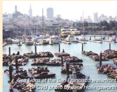
Sea Lions at the San Francisco waterfront