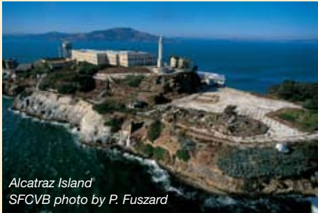
Alcatraz Island

As we enter summer and start to outline our vacation plans, we are all feeling the strains of rising gas prices. Most people are re-thinking long road trips and, with the residual effects of increased airline fares, many families have scrapped air travel as well.