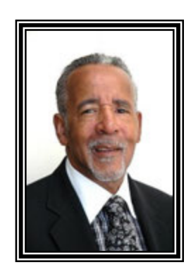
Commissioner Al Norman