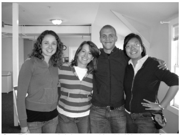
Our Friends at Adolescent Health Working Group