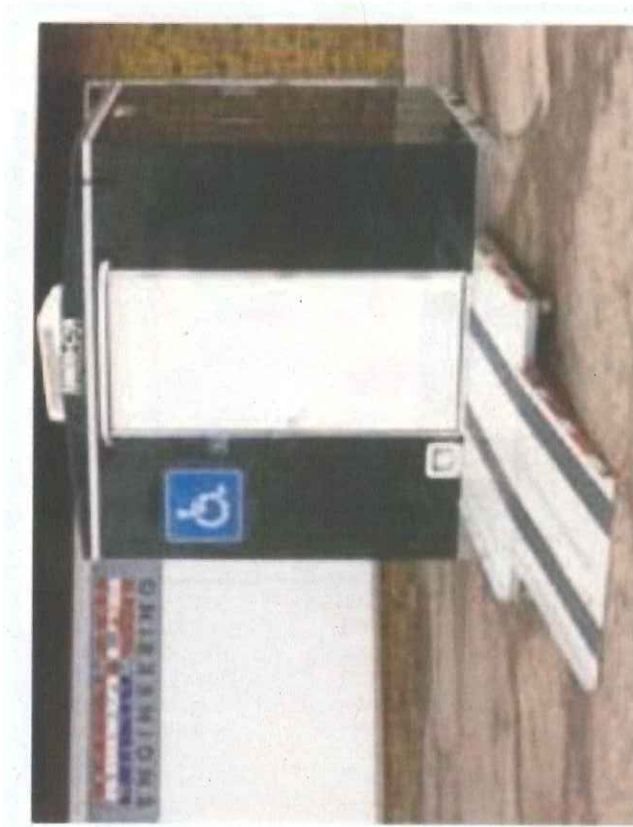
808 ADA Plaza