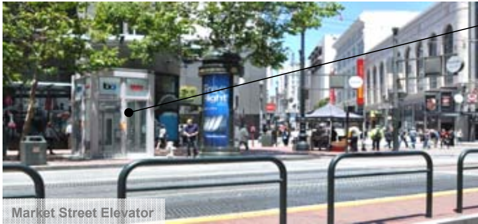
Market Street Elevator