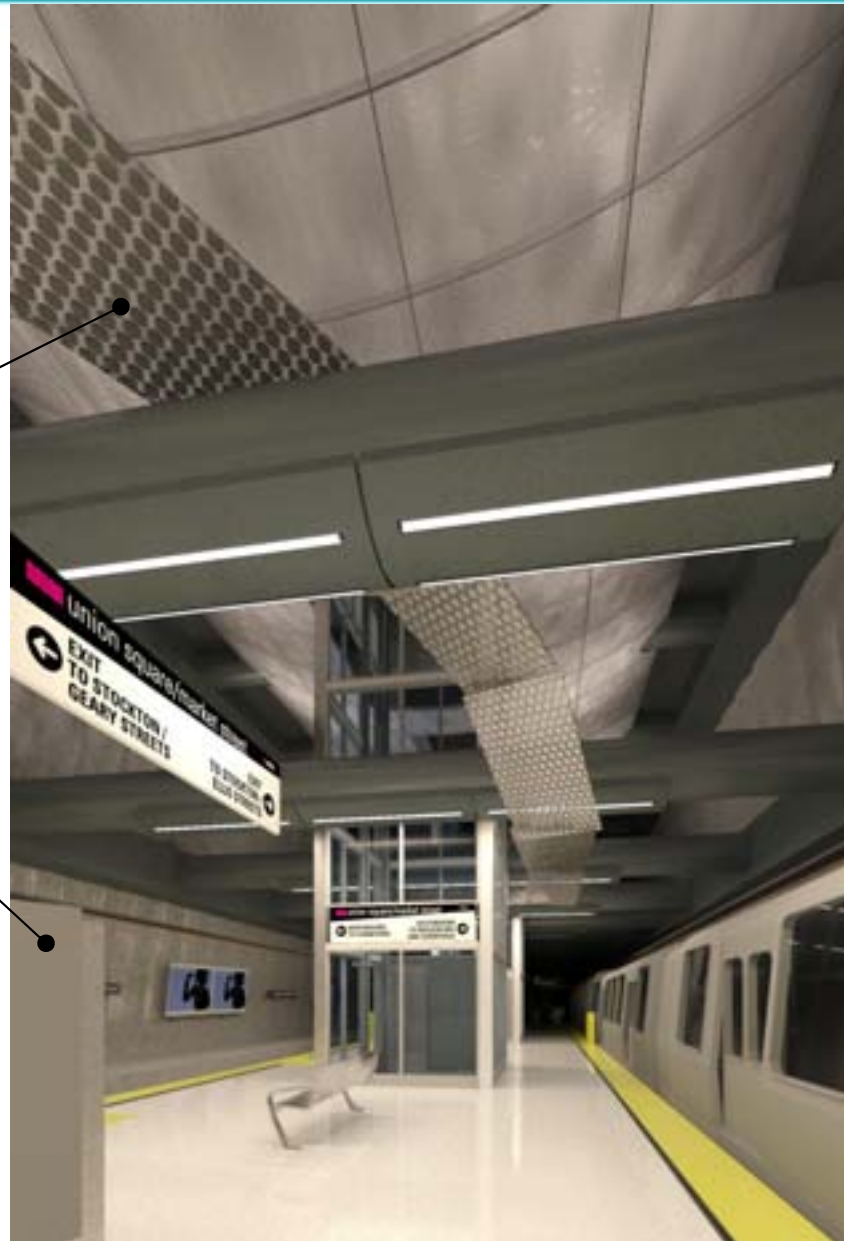
Stainless Steel Fire Hose Cabinet