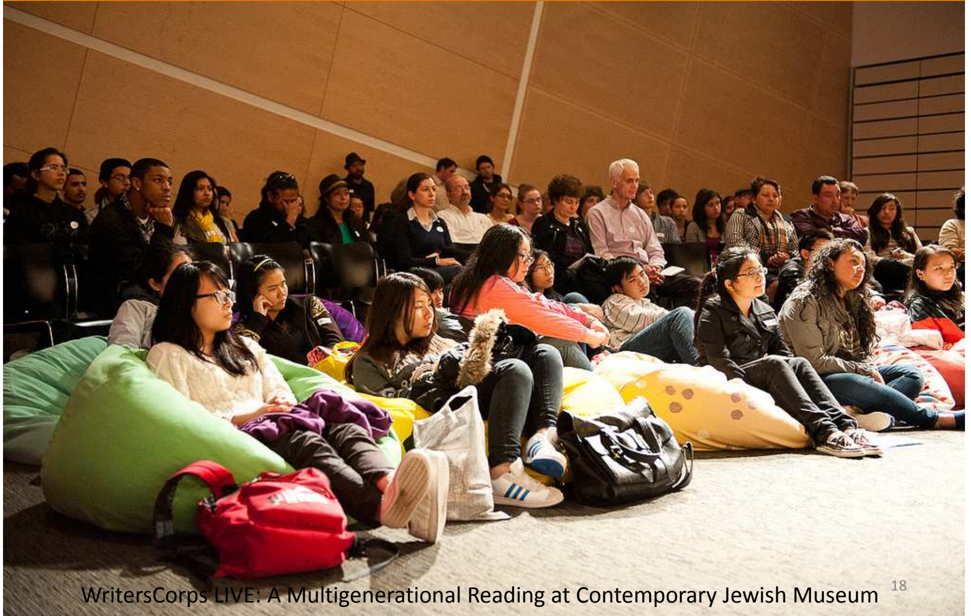
WritersCorps LIVE: A Multigenerational Reading at Contemporary Jewish Museum