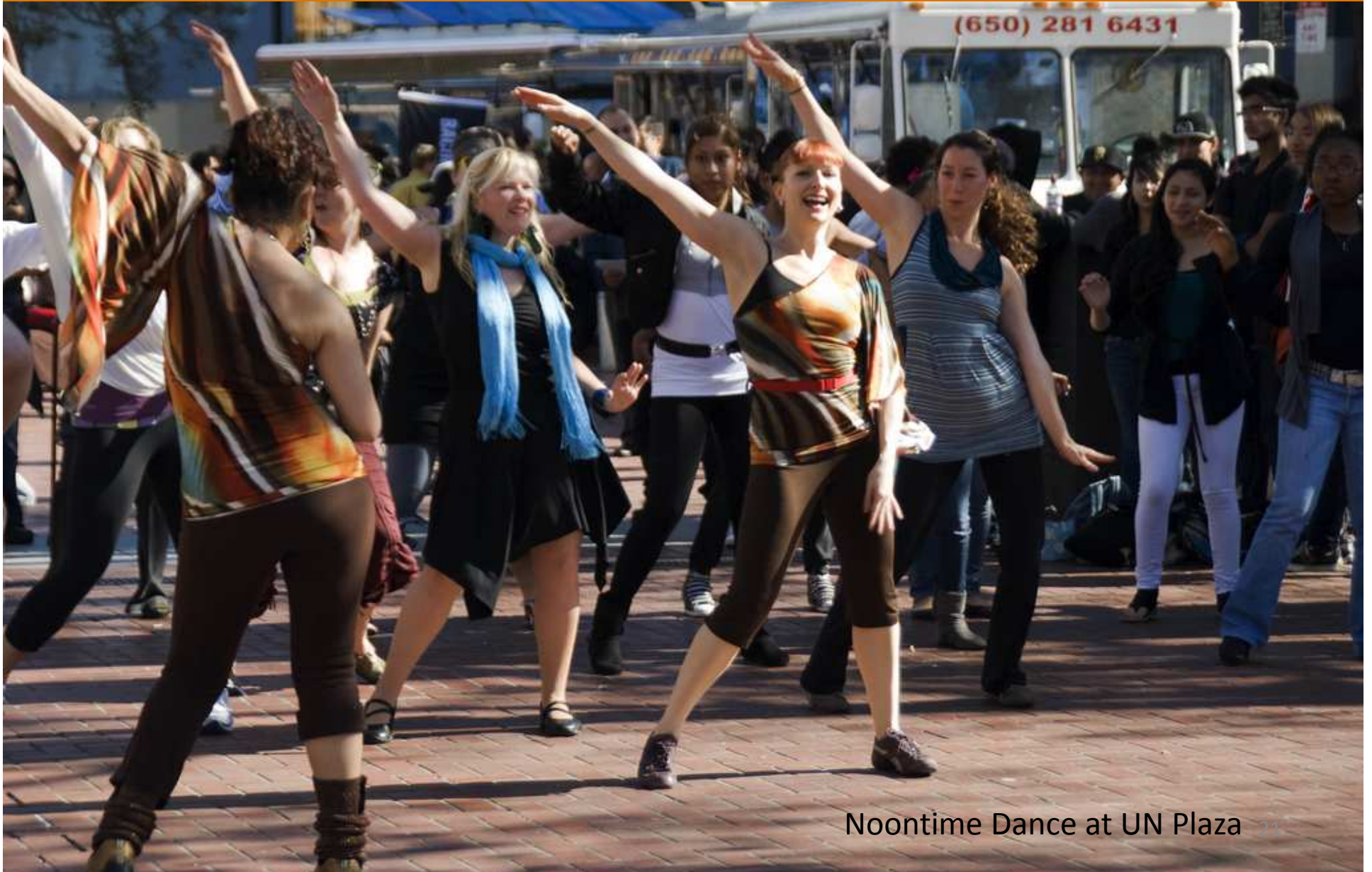
Noontime Dance at UN Plaza 21