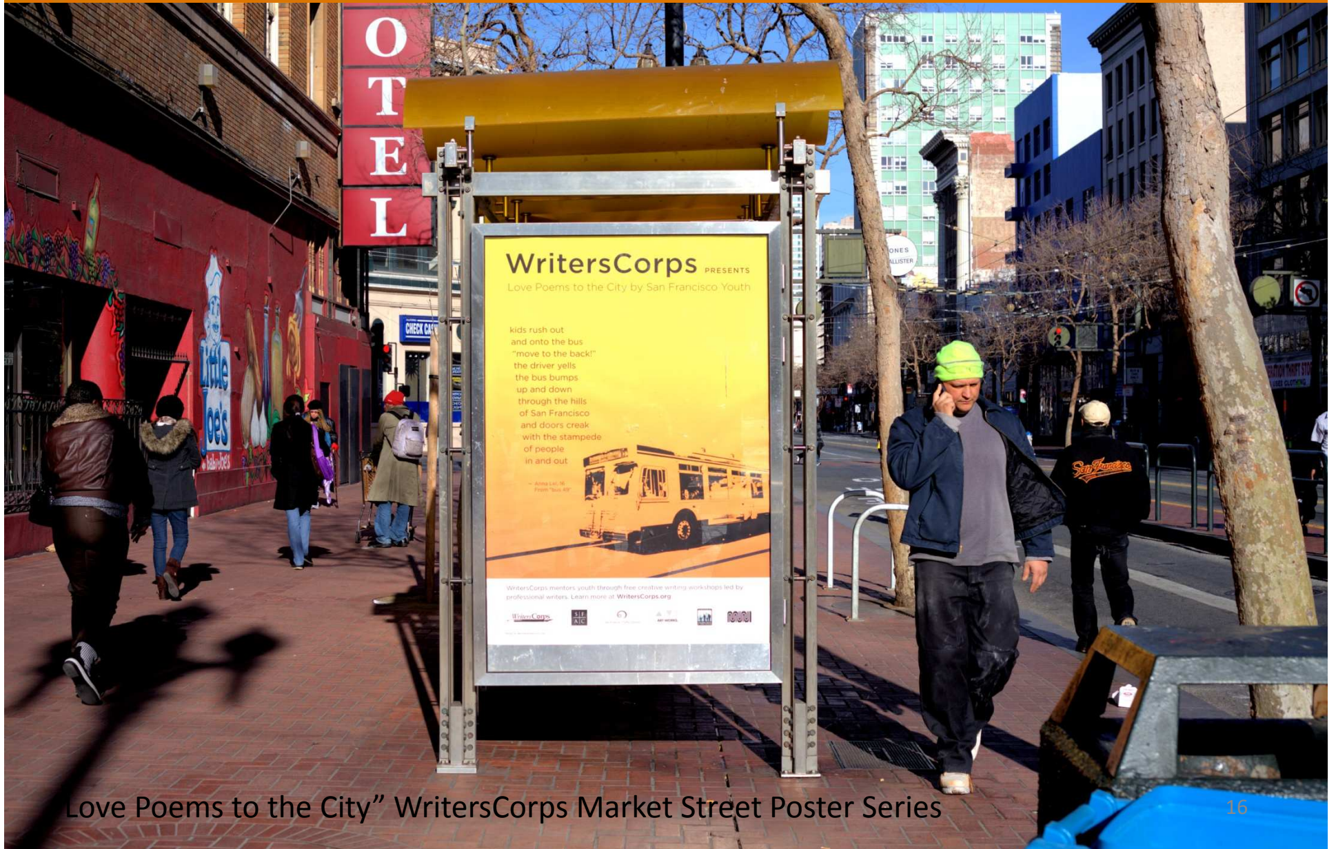
“Love Poems to the City” WritersCorps Market Street Poster Series