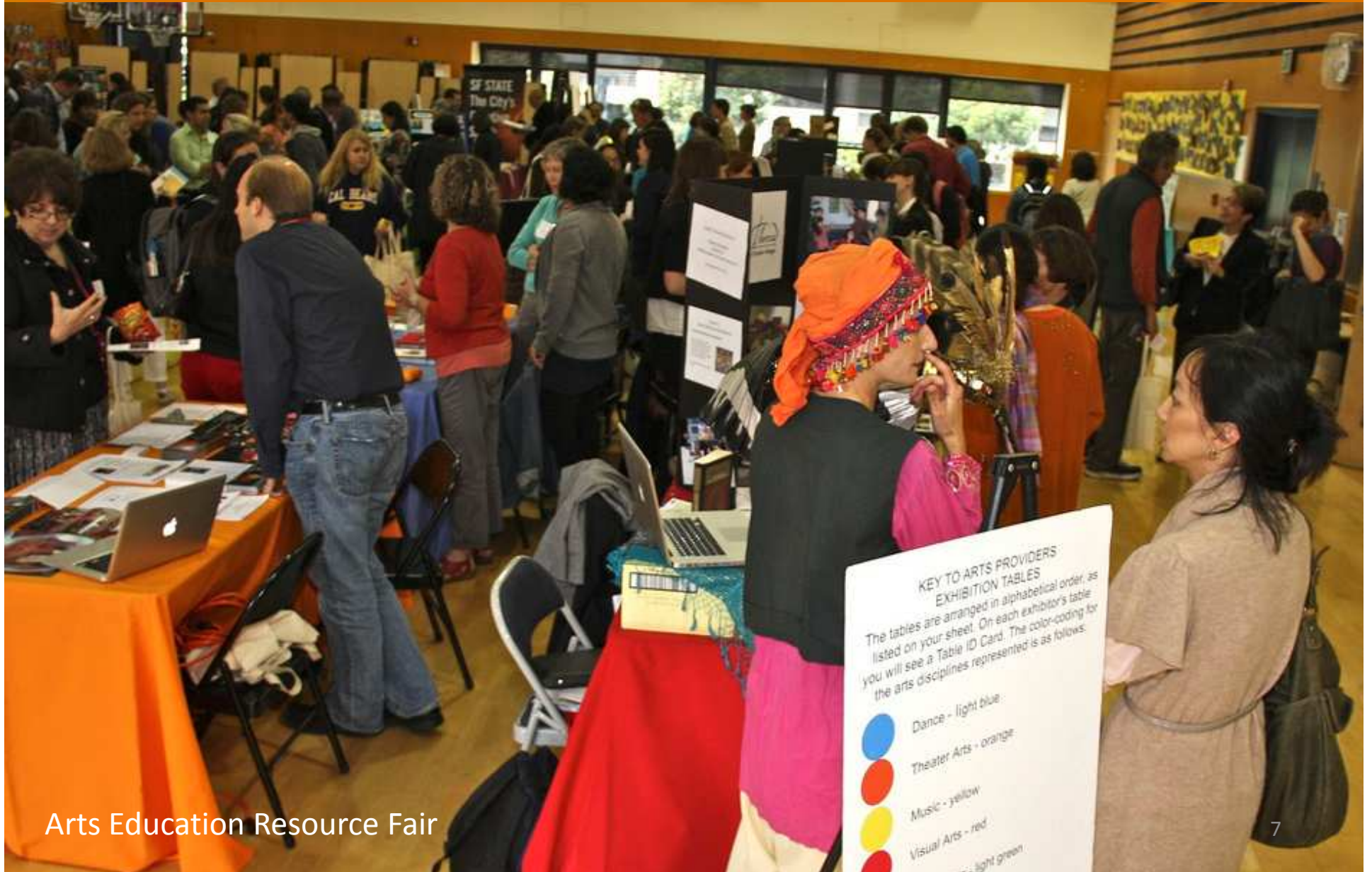
Arts Education Resource Fair