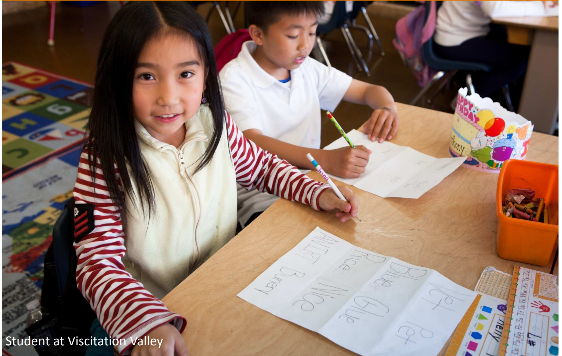
Student at Viscitation Valley