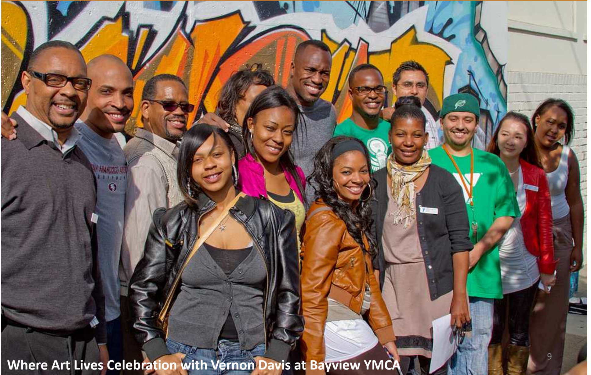
Where Art Lives Celebration with Vernon Davis at Bayview YMCA