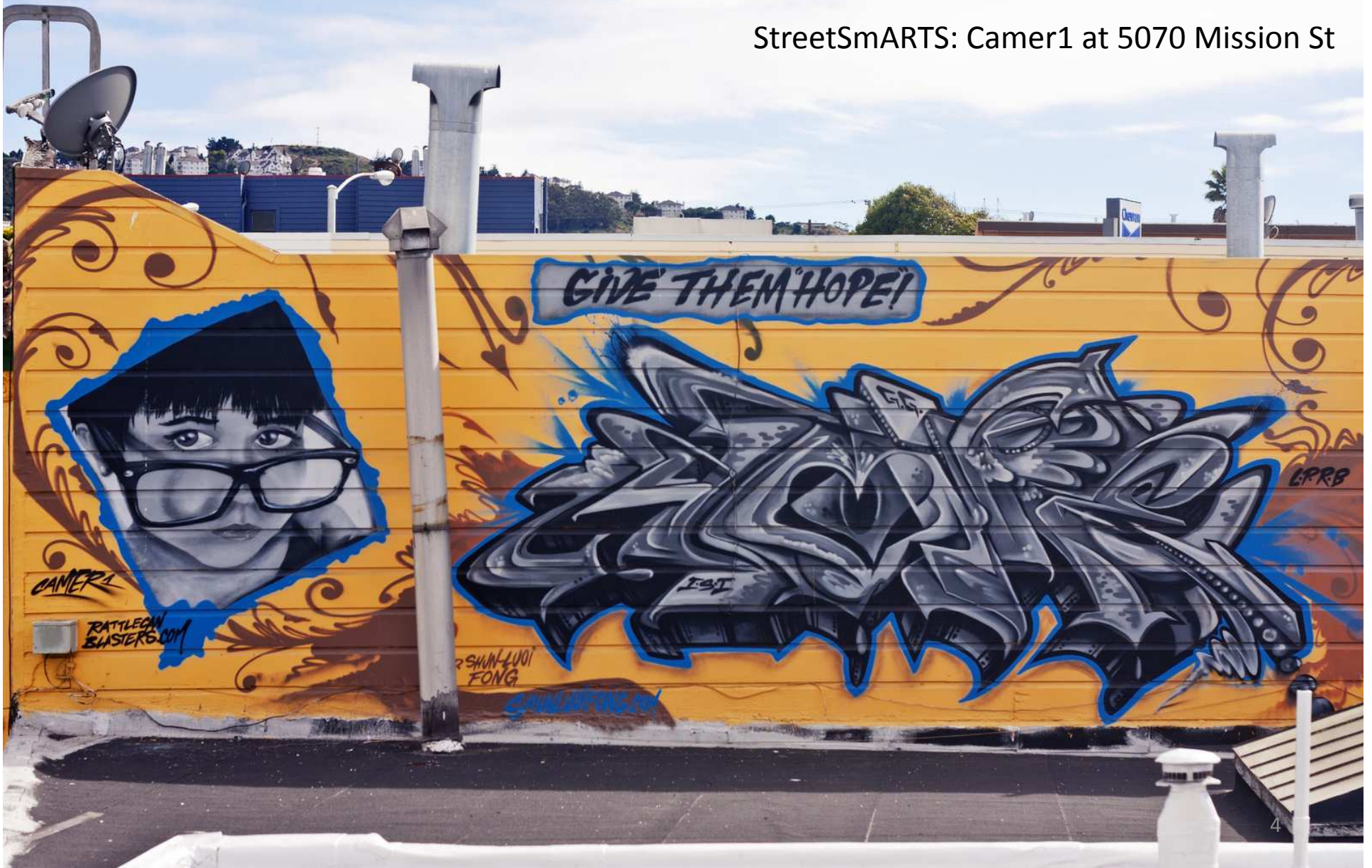
StreetSmARTS: Camer1 at 5070 Mission St