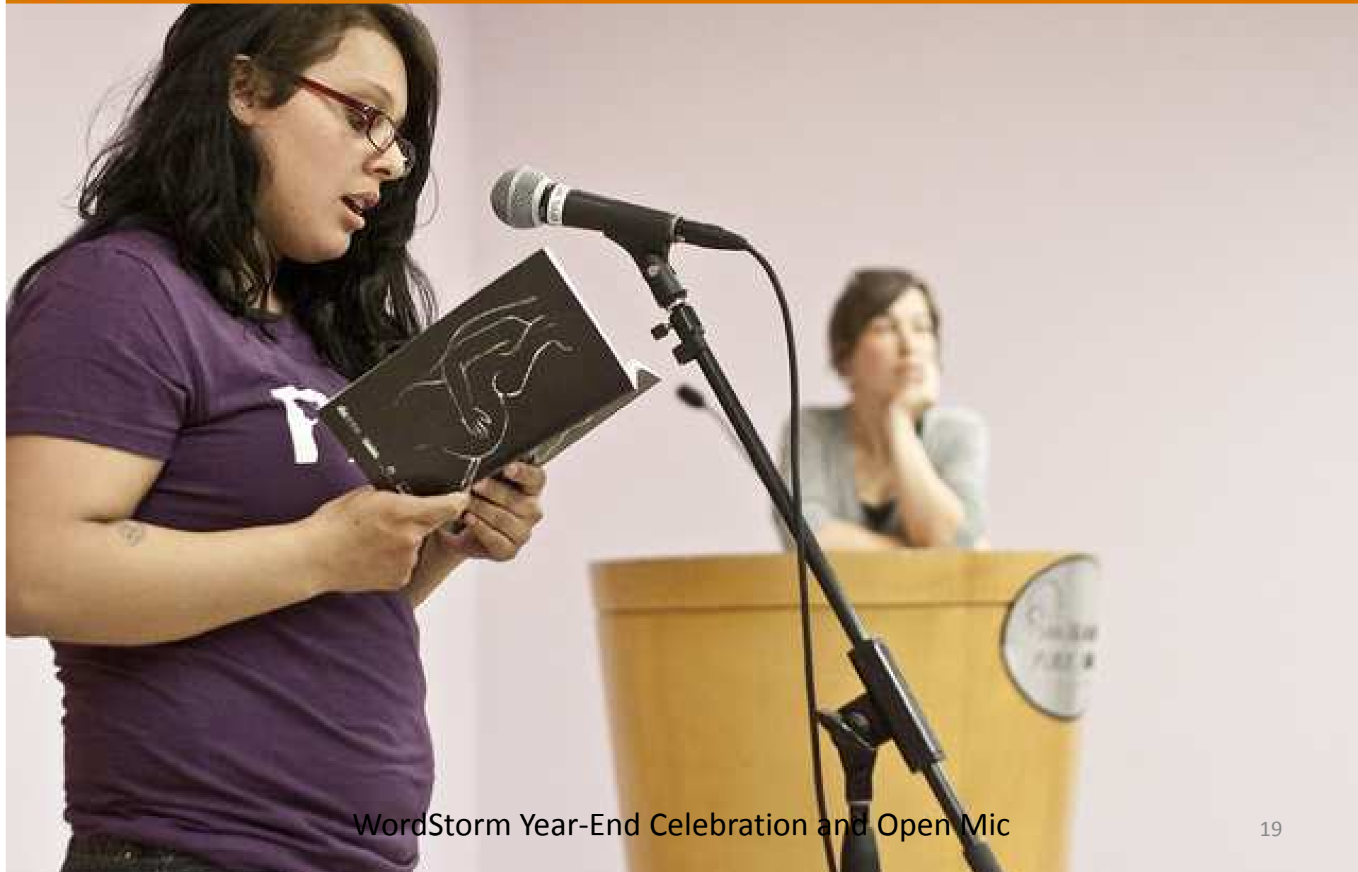
WordStorm Year-End Celebration and Open Mic