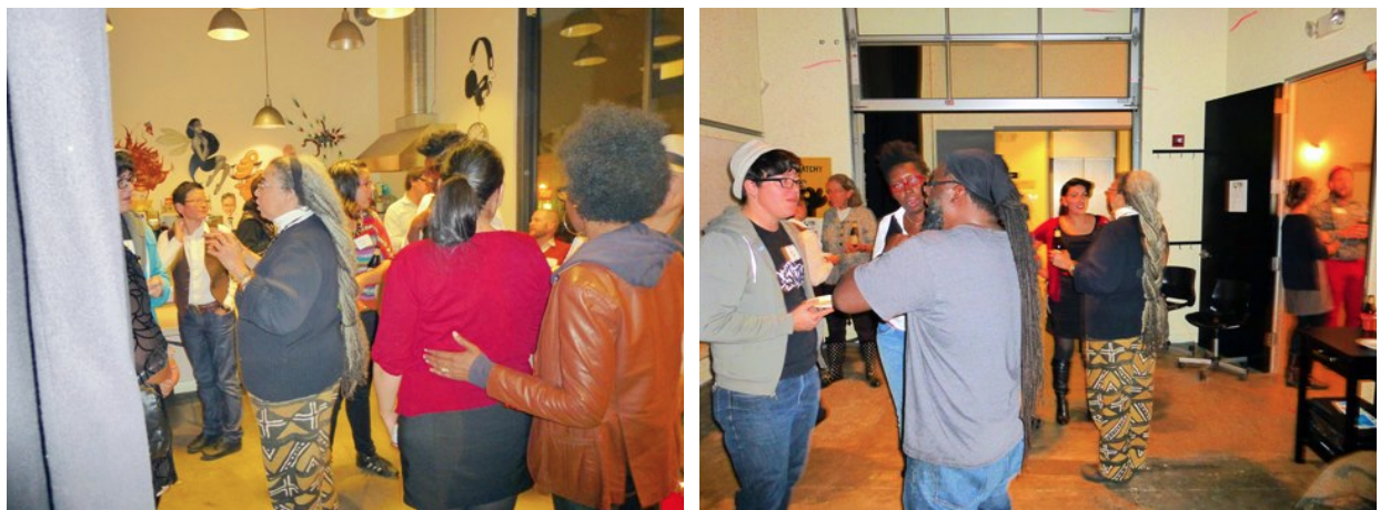
QCC Board and artists in conversation

QCC received positive feedback from attendees, generally hearing that all present enjoyed the accessibility to QCC's Board. Artists, specifically, enjoyed receiving insight on their projects from Board members and volunteers were happy to have their prior time commitment honored by the organization.