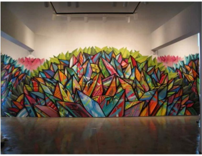
MURAL DIRECTION EXAMPLE