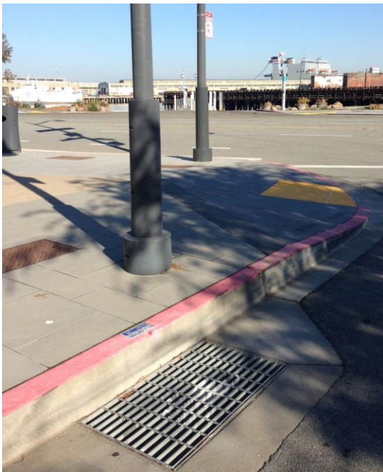
One of the storm drains in the pilot program area

The San Francisco Public Utilities Commission (SFPUC) has engaged the Arts Commission (SFAC) to develop a plan for a pilot series of temporary murals on the sidewalk adjacent to six storm drains within the Mission Bay neighborhood. The goal of the pilot program is to commission visually impactful artistic treatments at the six select storm drain locations in order to promote public awareness of storm drains that are separate from the sewer system and ultimately to help reduce pollution draining into the San Francisco Bay. Based upon the results of the pilot program, the SFPUC may implement similar temporary murals at other storm drain locations throughout the City. The murals implemented through the pilot program and any subsequent storm drain murals will not be accessioned into the Civic Art Collection and will not be maintained by the SFAC.