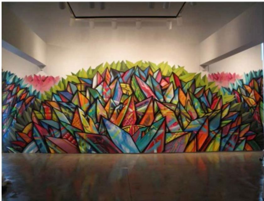
MURAL DIRECTION EXAMPLE