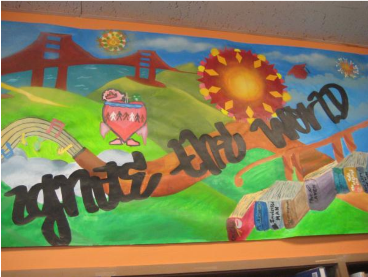
Mural at Thurgood Marshall High School