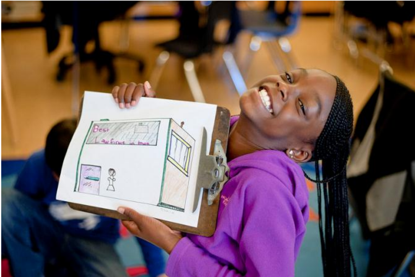
Tenderloin Community School drew pictures of businesses they would like to own.