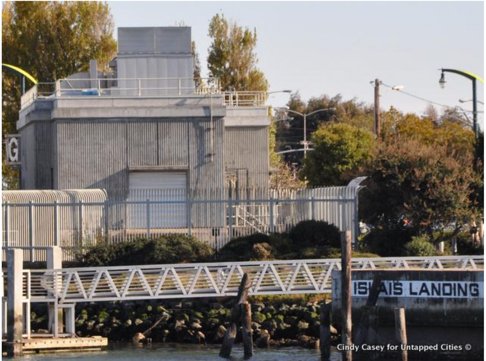
Cindy Casey for Untapped Cities ©