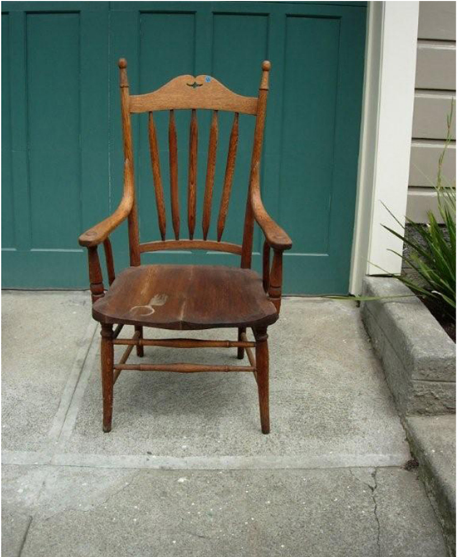
A - Quantity (4)