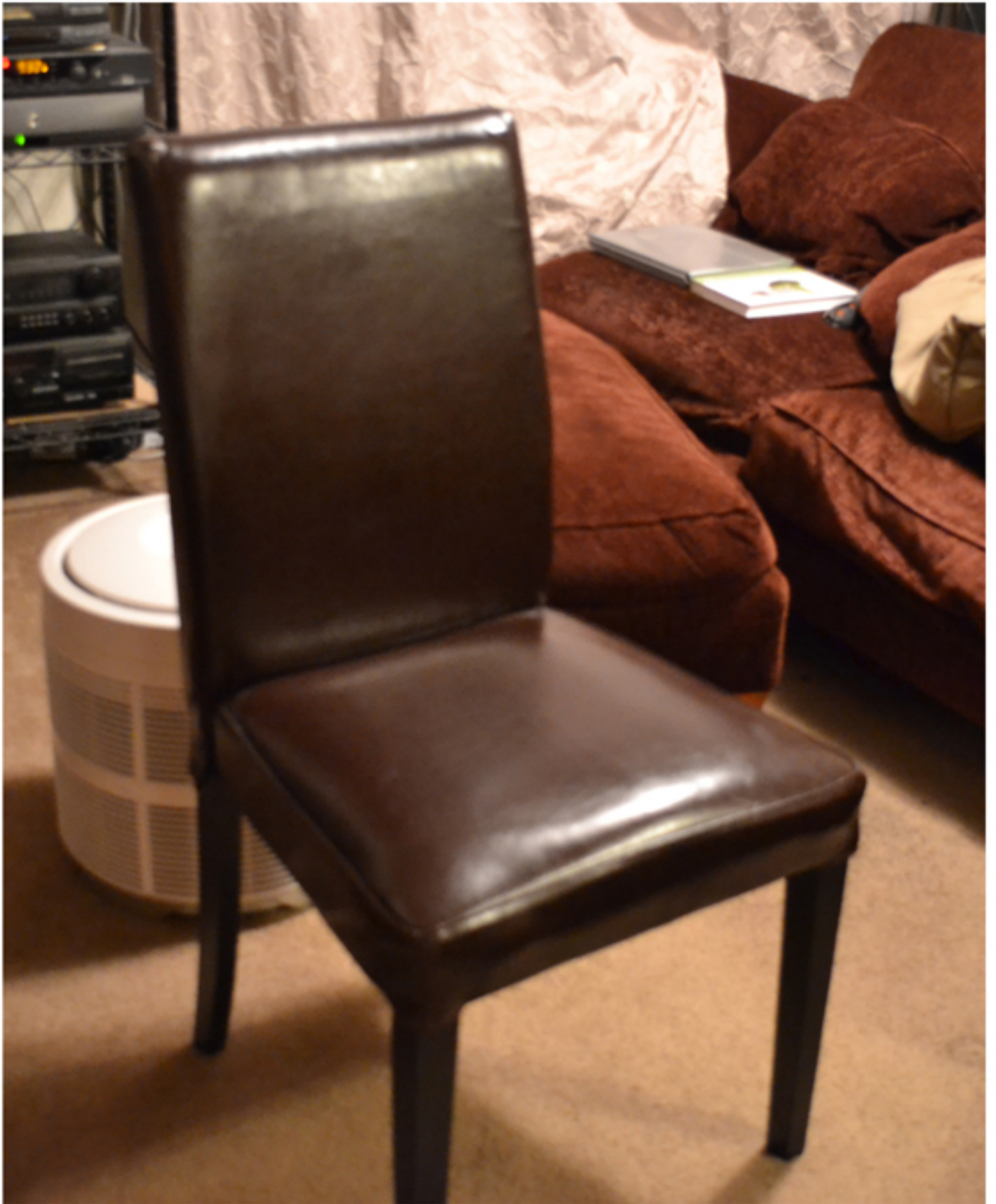
C - Quantity (3)