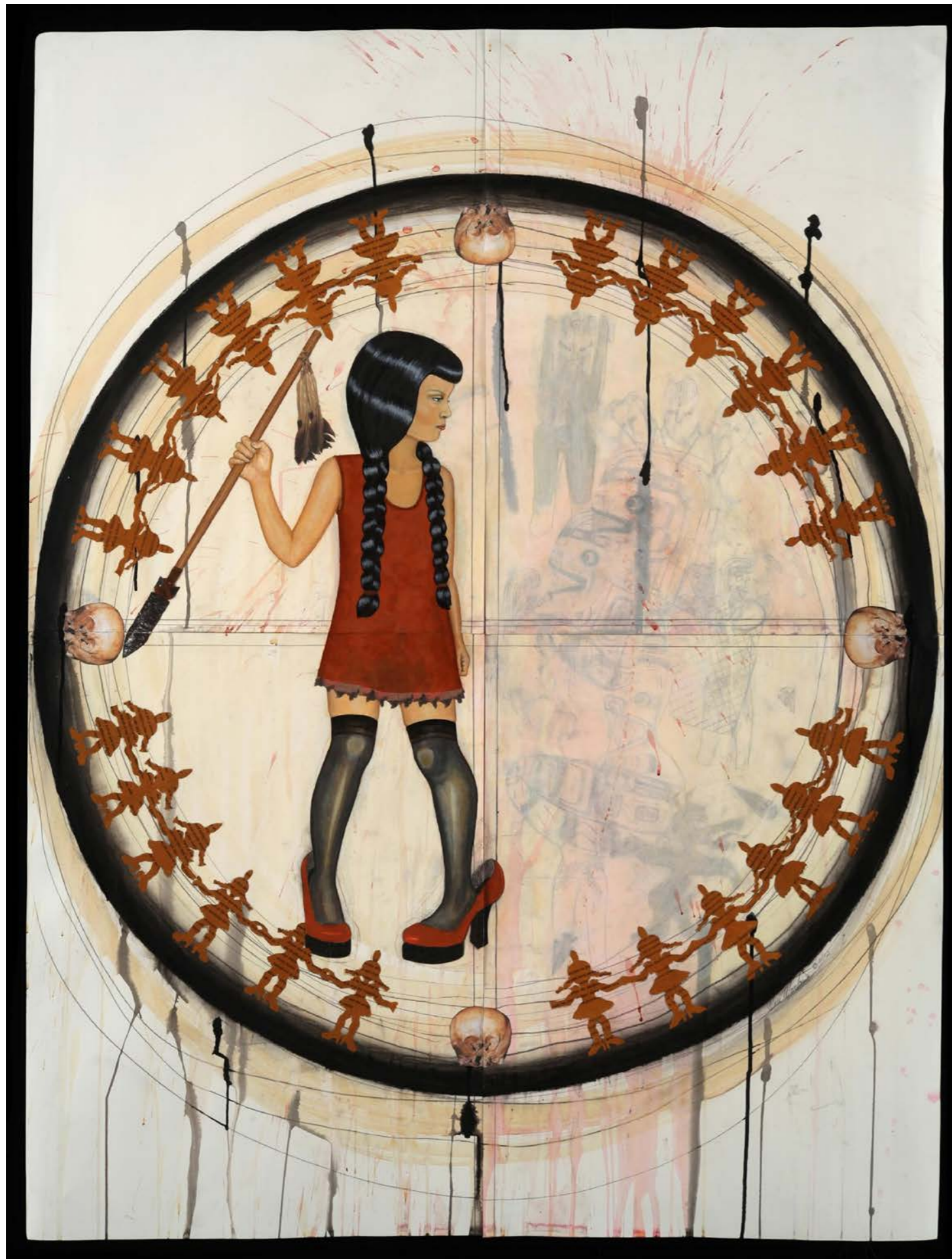
Geri Montano Slayer of Fears , 2012 Acrylic ink, graphite, charcoal, collage on paper 48 × 37 in.