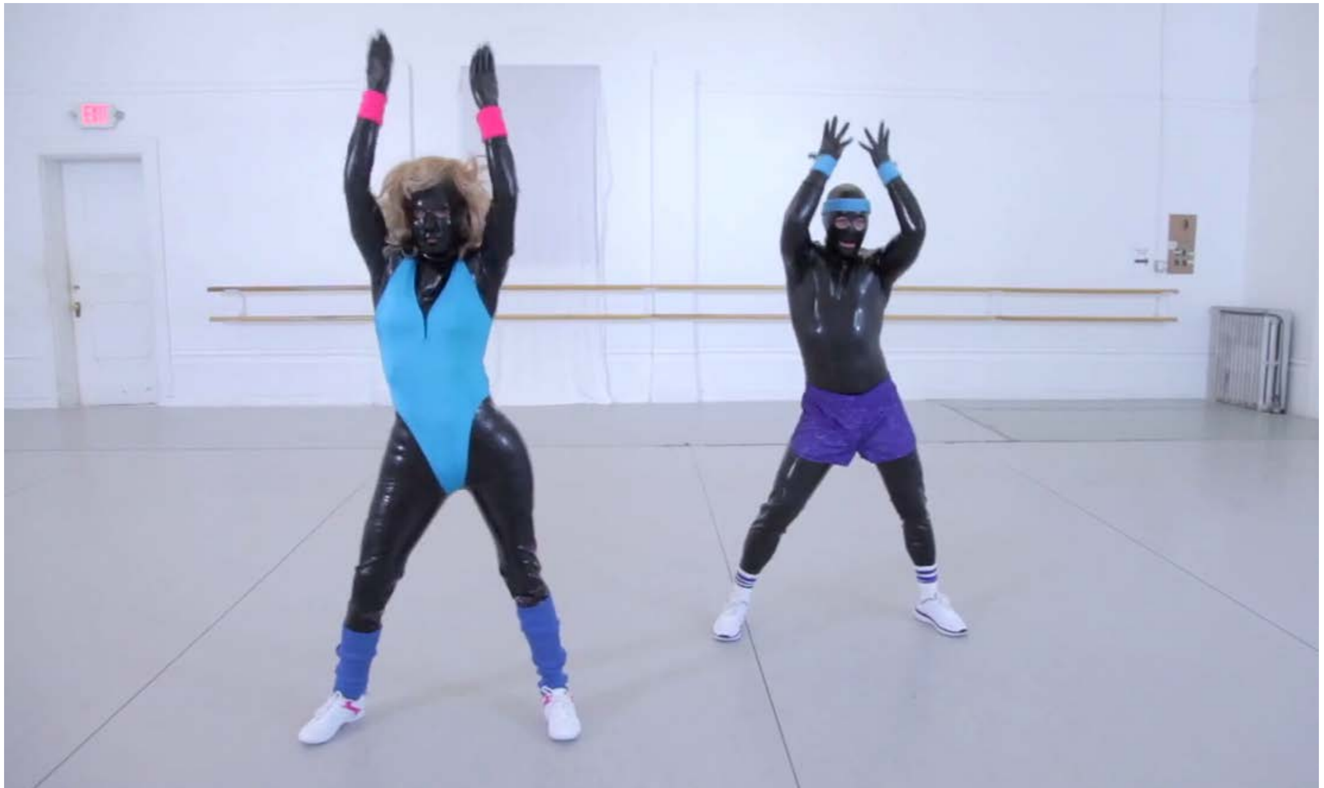
Aron Kantor MASK4MASK , 2015, Video, 5:00 minutes