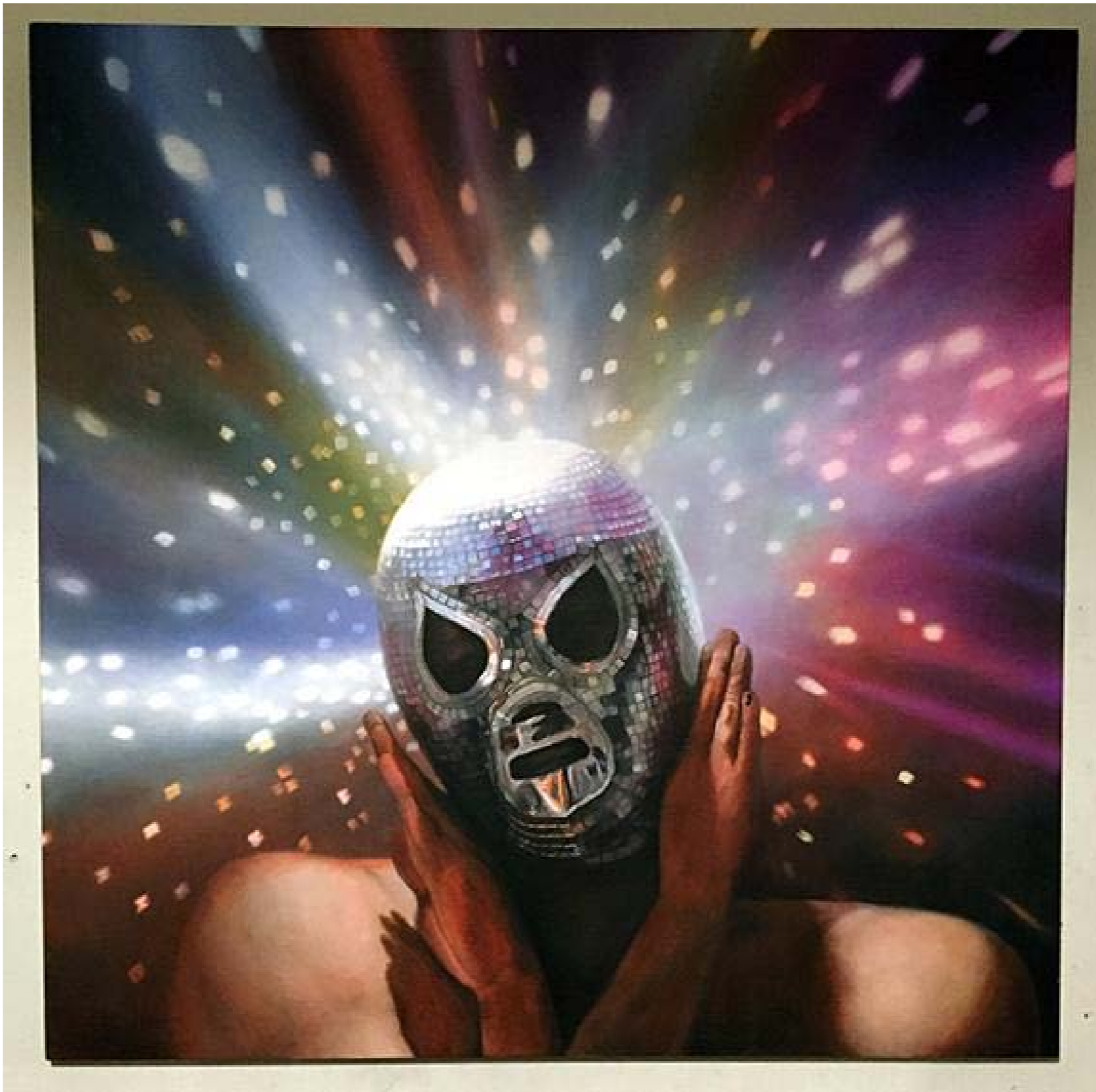
Orlando “Katia” de la Garza Untitled, 2018, Acrylic on Canvas, 36 x 36 in.