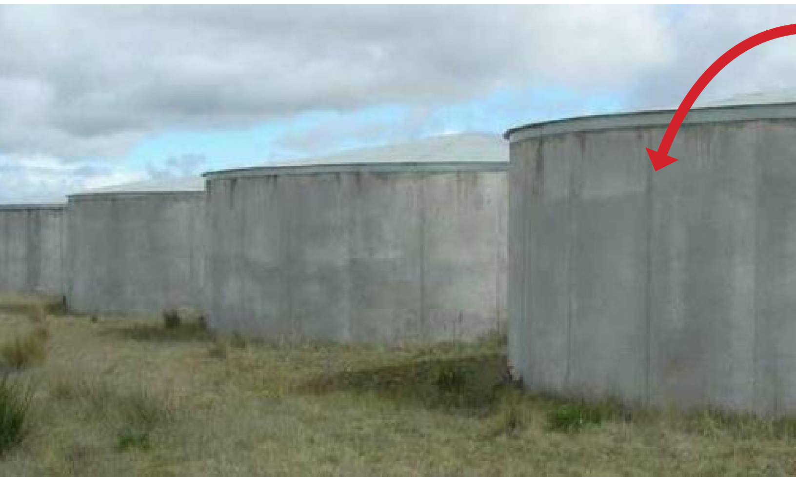
CONCRETE WATER TANKS