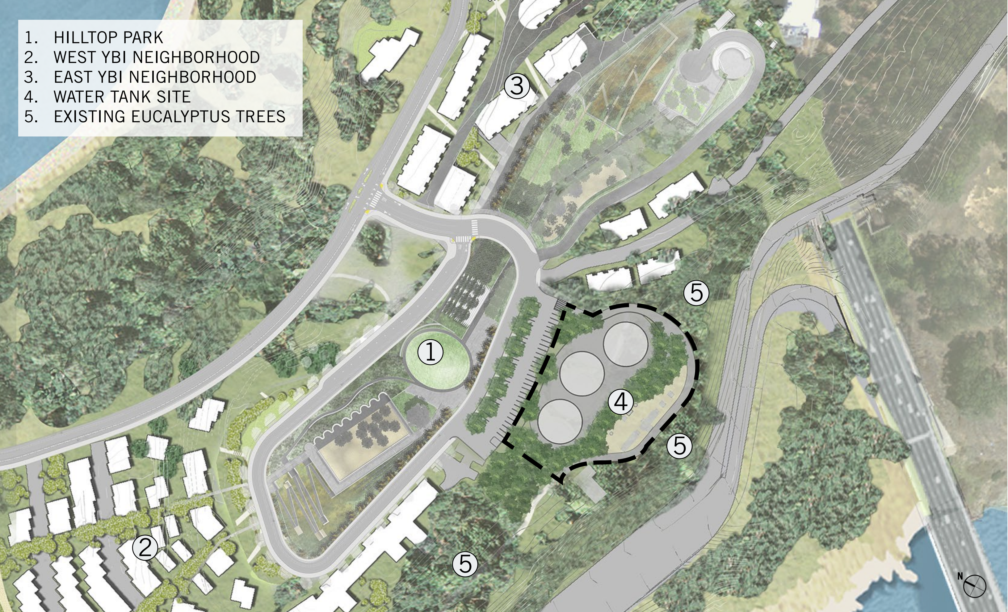
YBI - WATER TANKS SITE PLAN