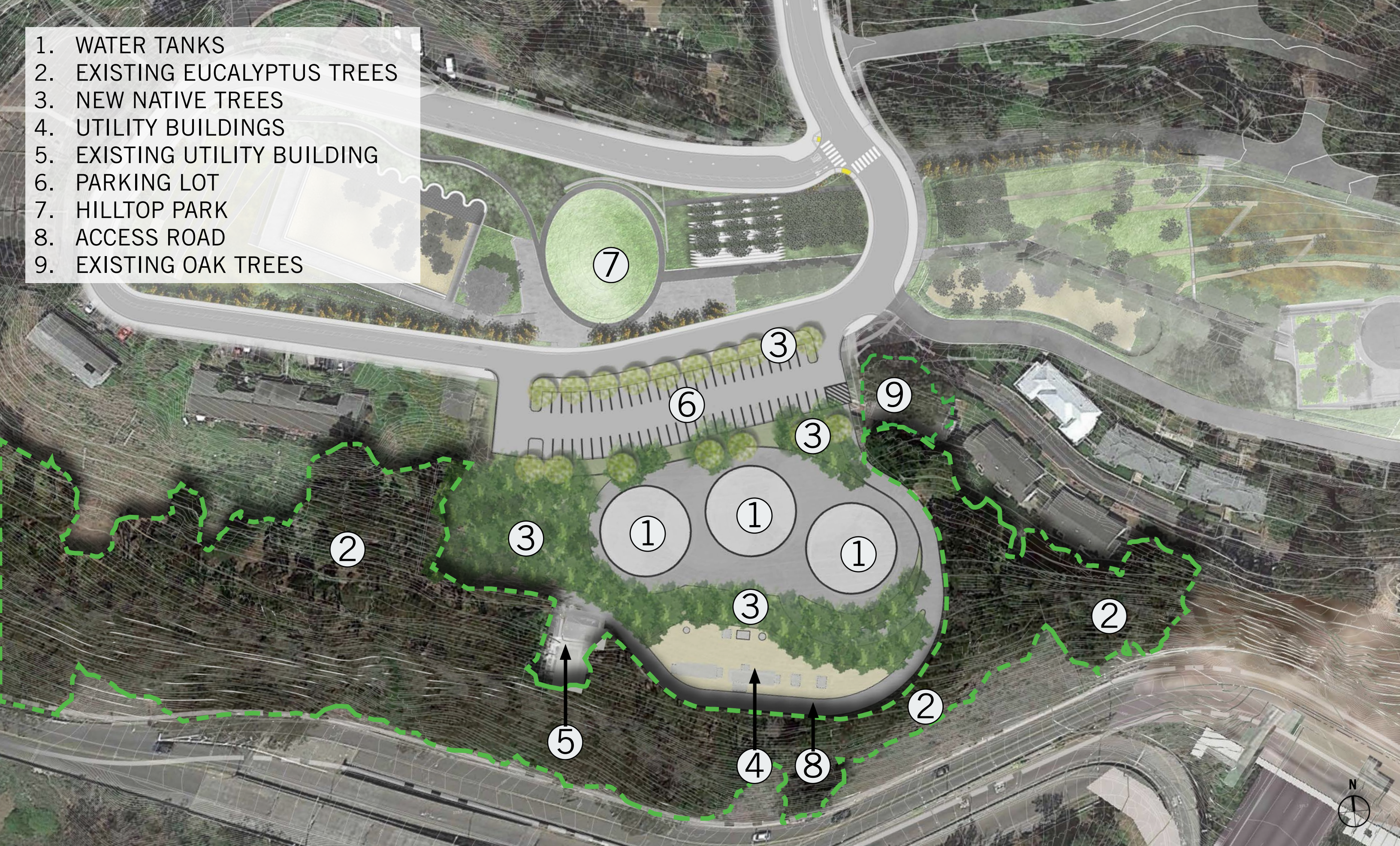
YBI - WATER TANKS SITE PLAN