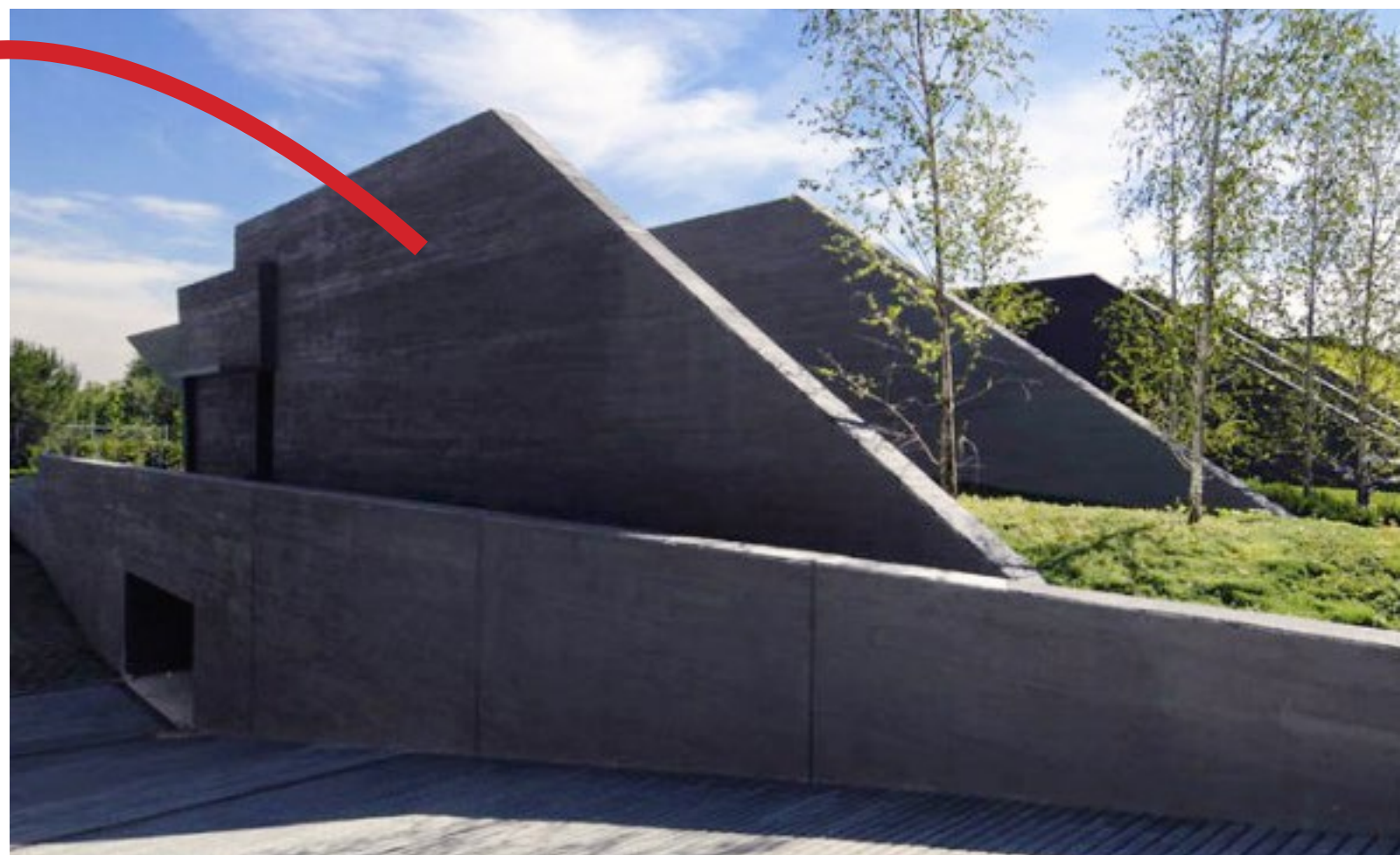
INTEGRAL COLORED CONCRETE - DARK GREY