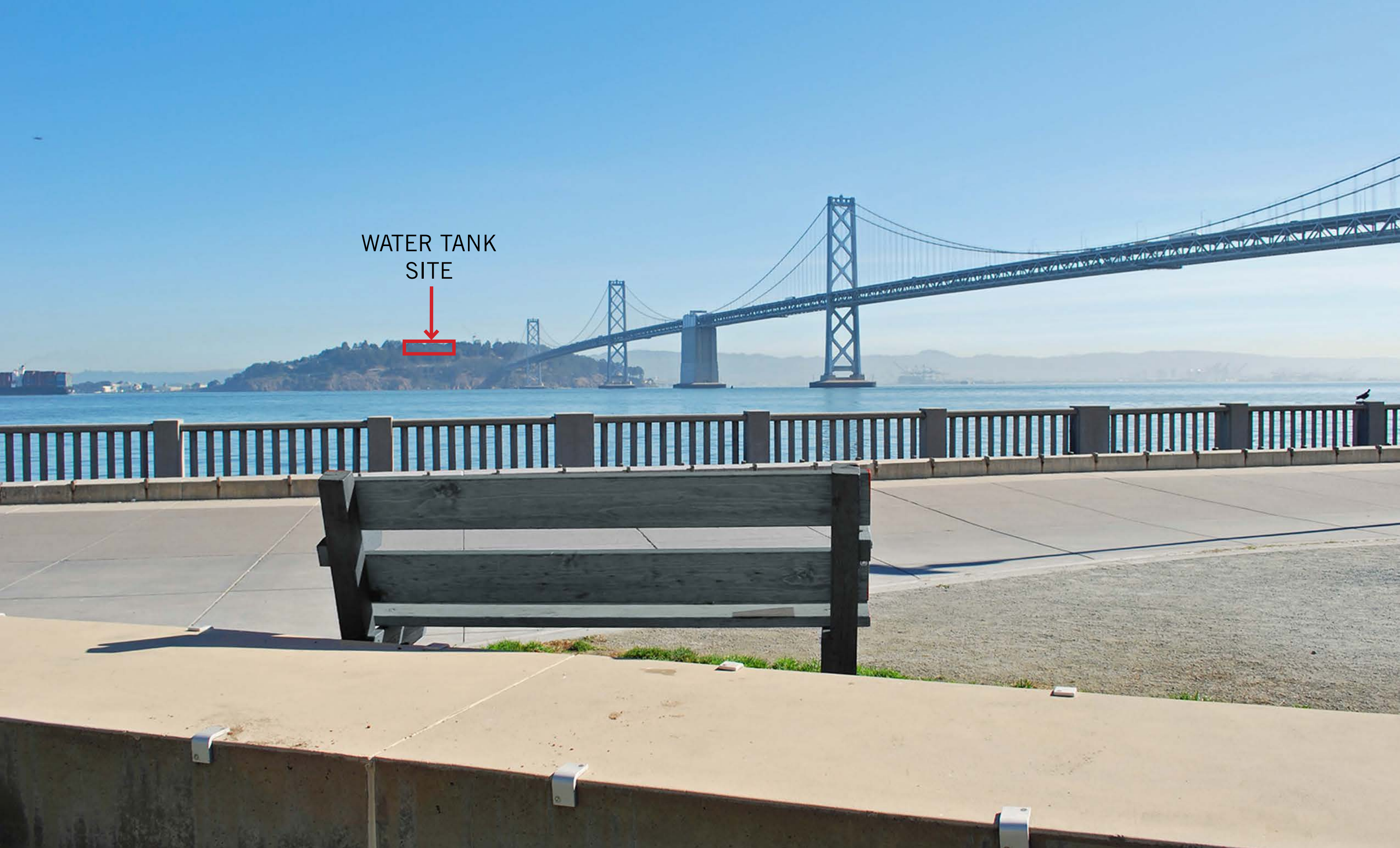
YBI - WATER TANK- VIEW FROM SAN FRANCISCO