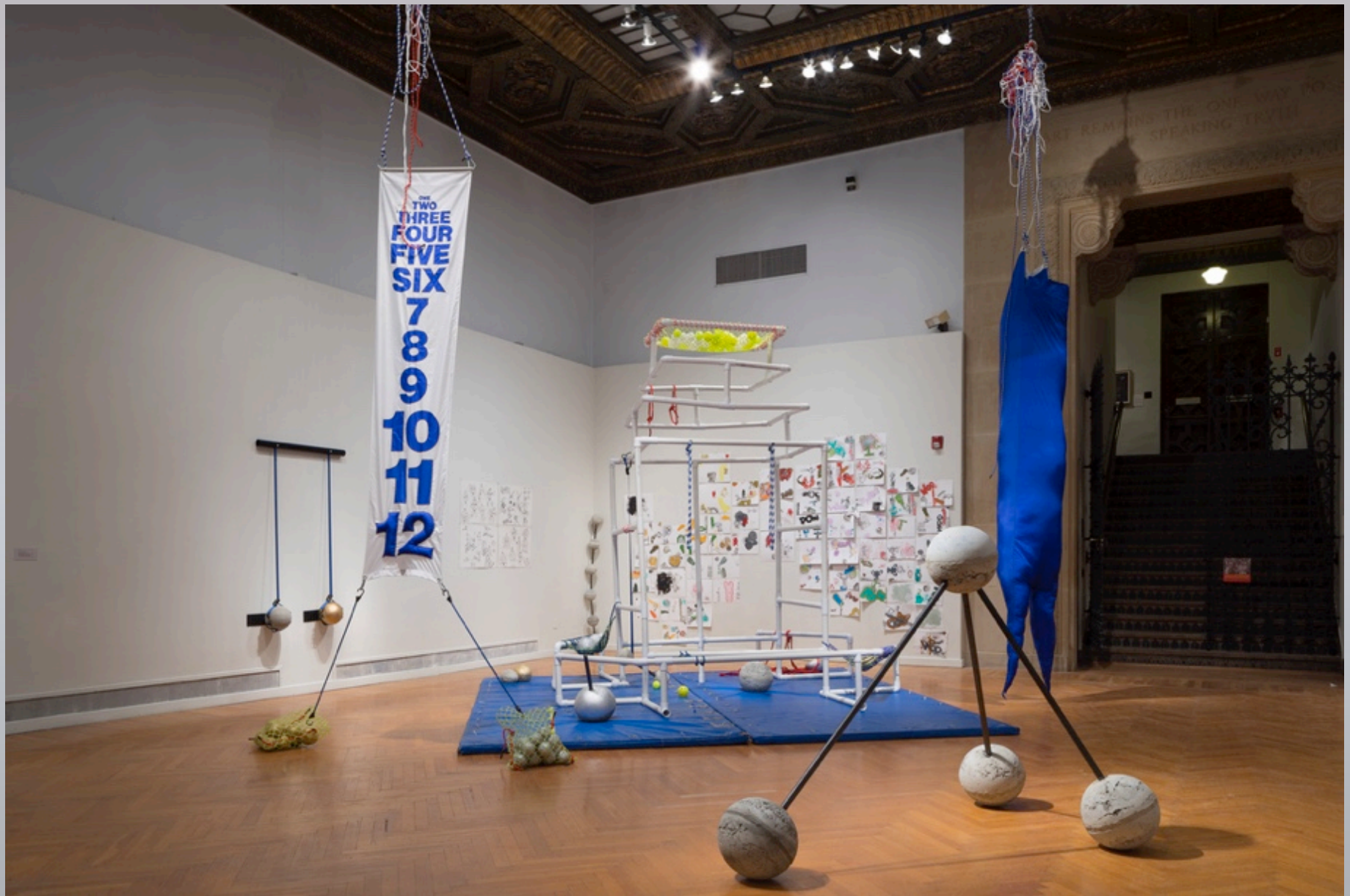
Swollen Virility , 2014. Installation view at Mills College Art Museum.