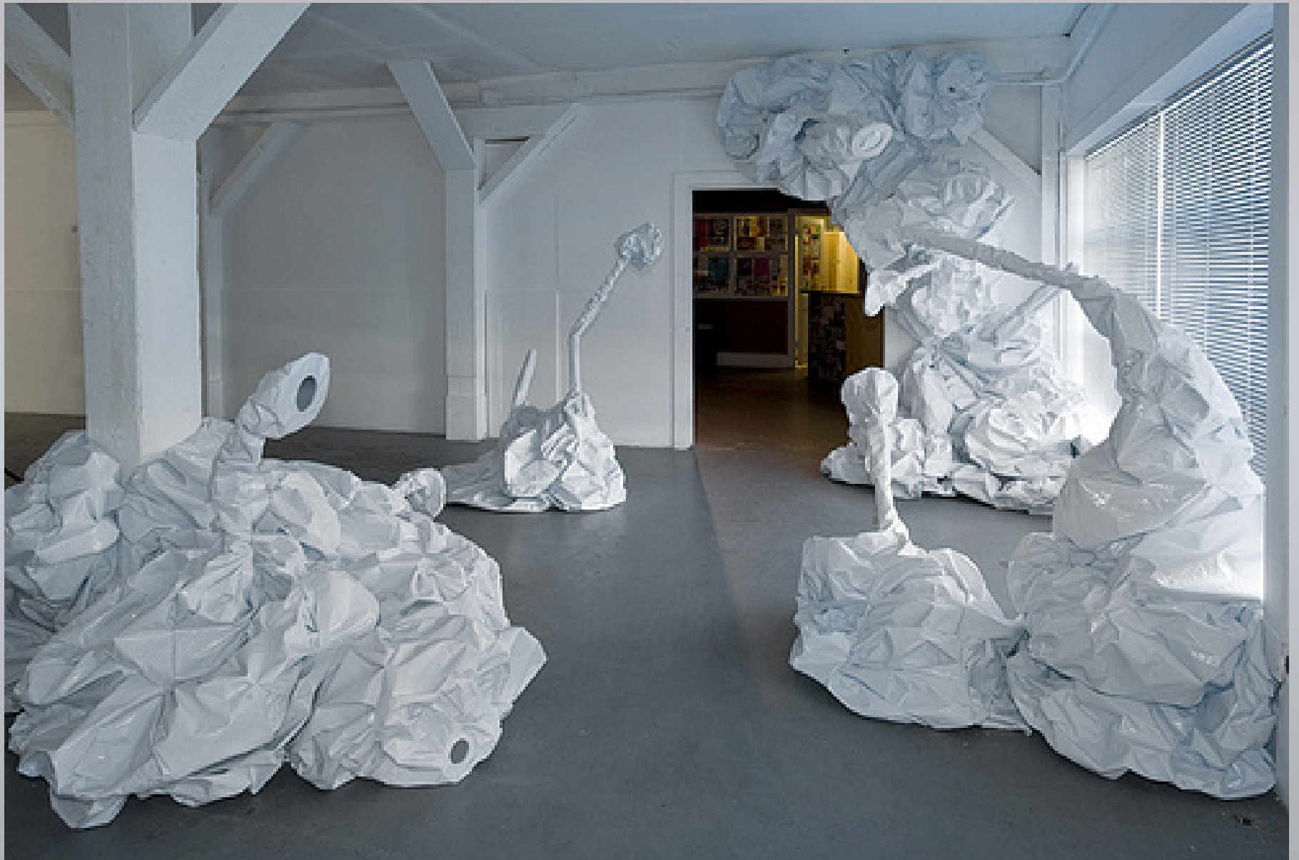
Oversight , 2008. Site-specific installation at Worksound, Portland, Oregon.