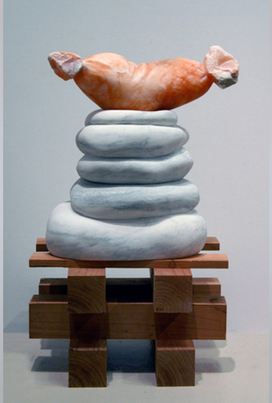
Offering , 2007. Wood, white marble, orange alabaster. 31" x 20" x 20"