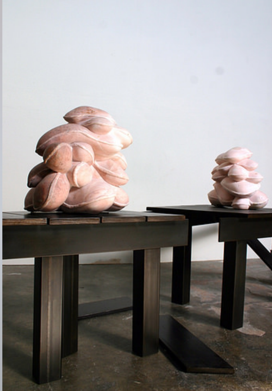
The Twins , 2014. Marble, steel. 40" x 80" x 32"