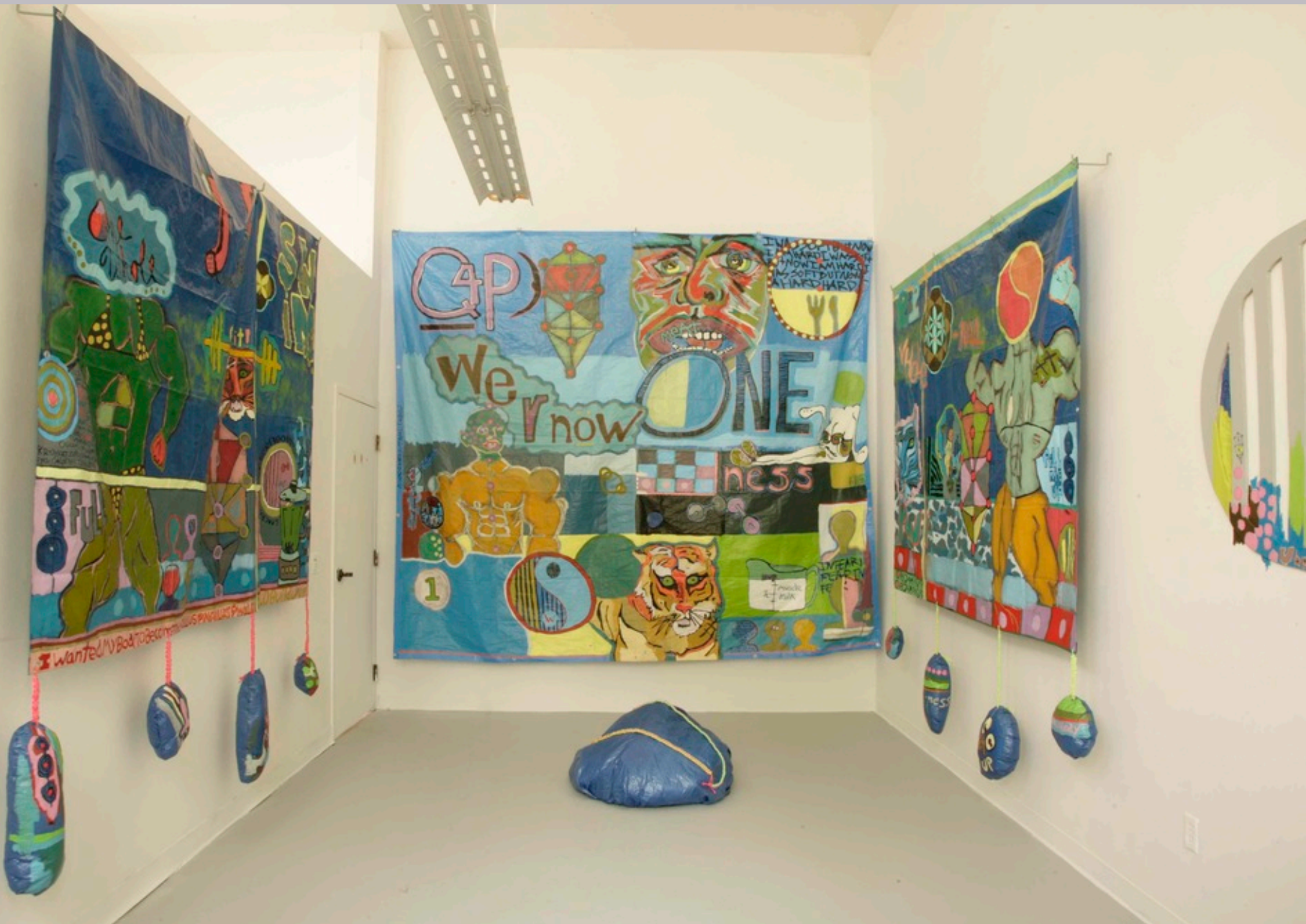
Installation view at Mills College.