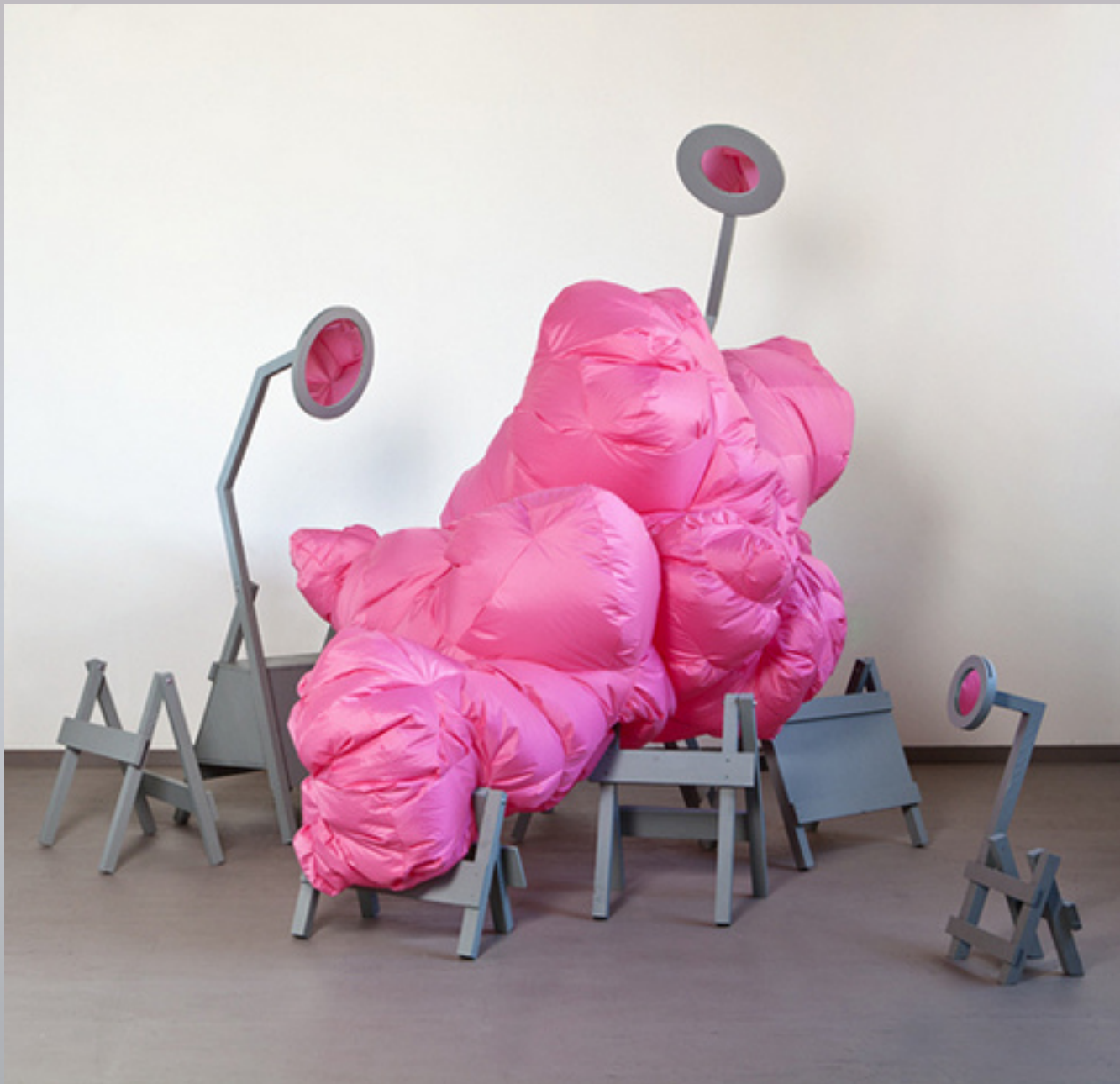
Pink Blob , 2012. Wood, fabric, thread, paint, fan, mirror. 98" x 120" x 96"