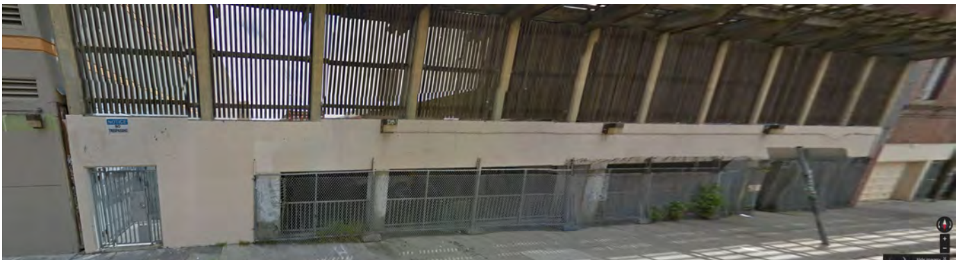
Existing north elevation