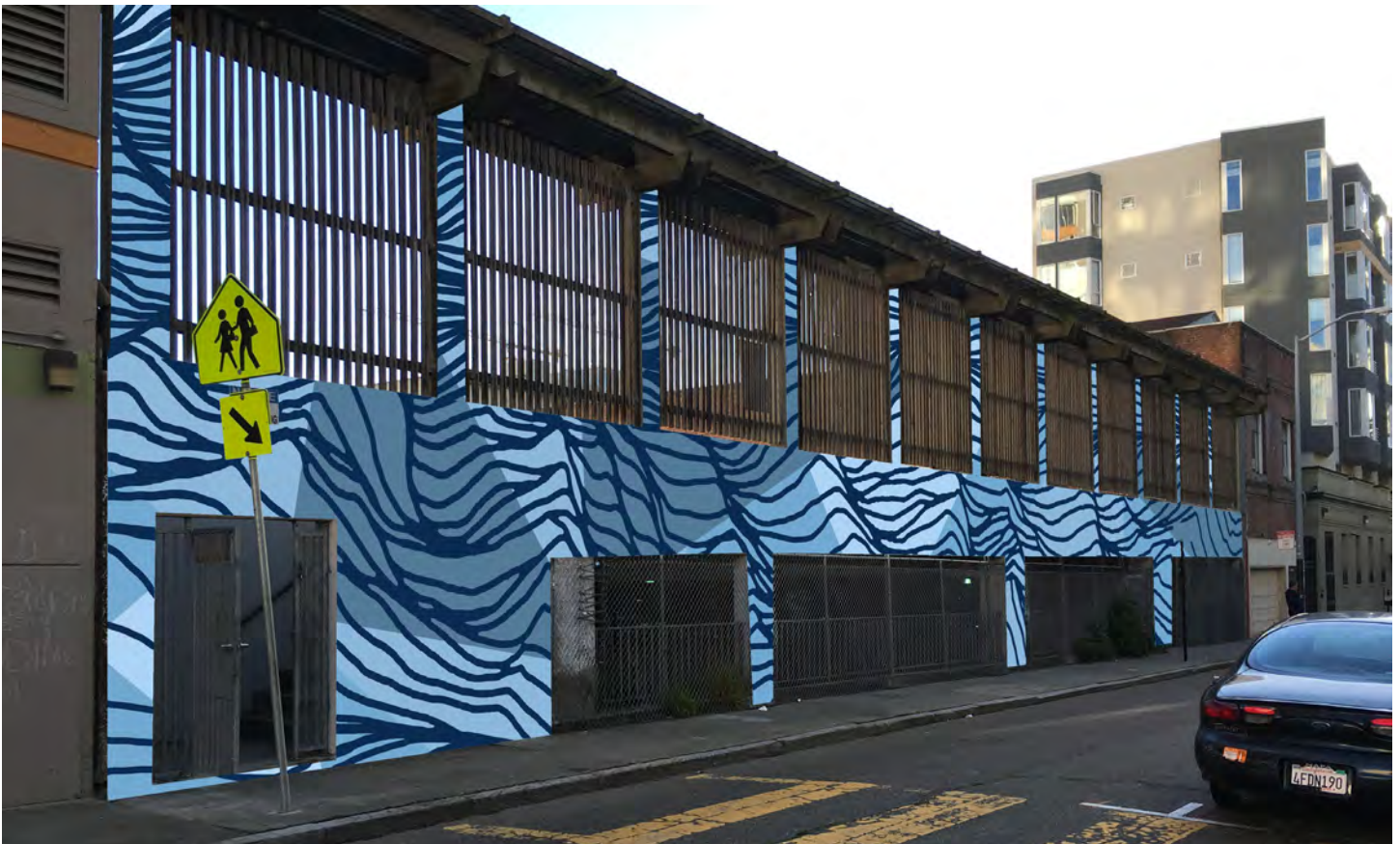
North elevation fronting Frank Norris Alley

{This image shows general composition, text and elements that will be in the final mural}