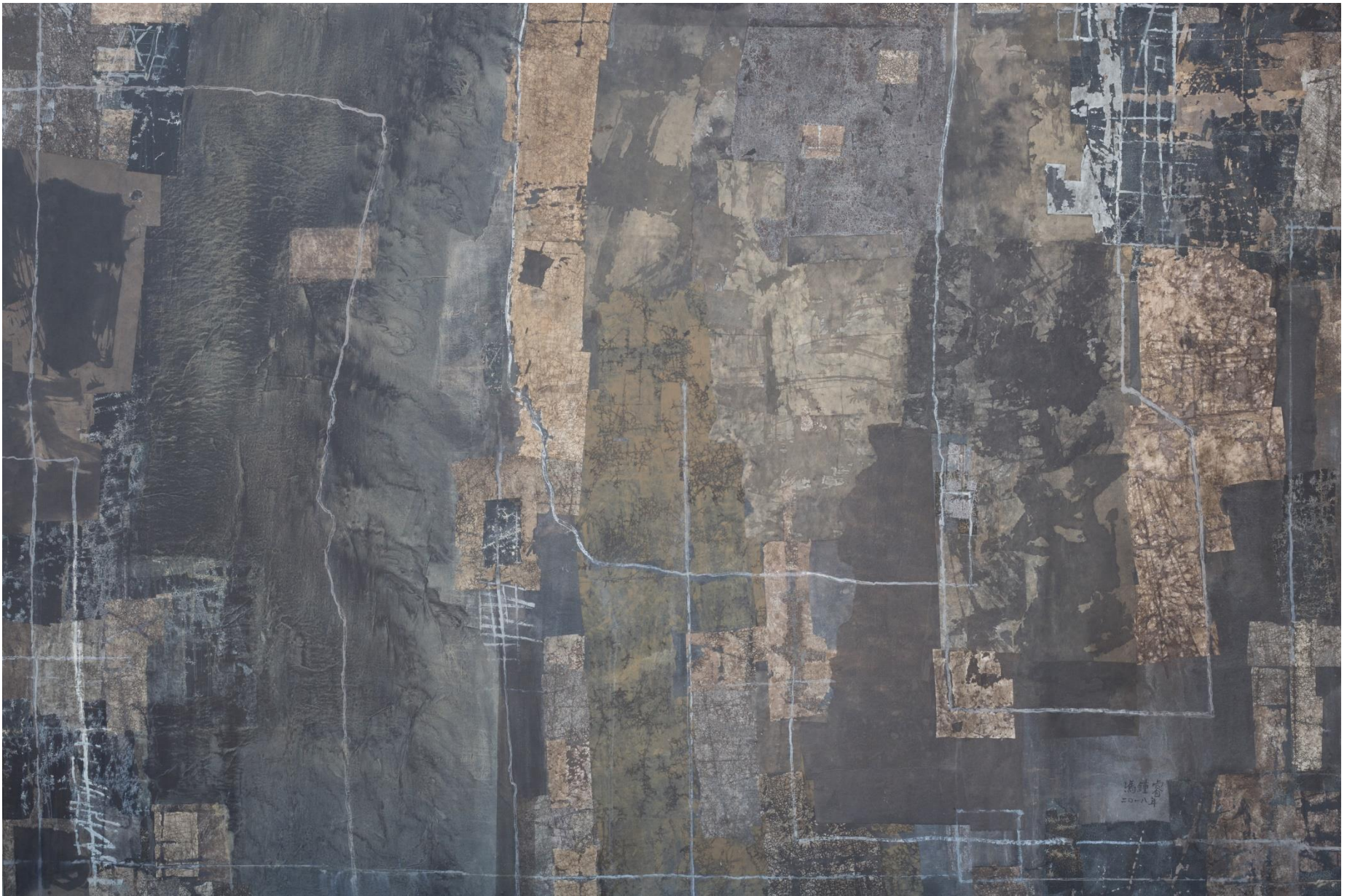
Chung Ray Fong, Painting #2018-8-6 , 2018, 60 in. x 90 in., mixed media on canvas, $72,000