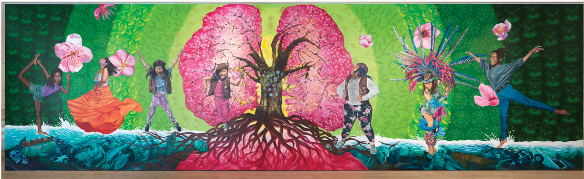
"Our Ancestor's Wildest Dreams", ©2020 Twin Walls Mural Company