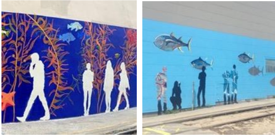
Ocean Avenue Mural Project in partnership with SFMTA Railway.