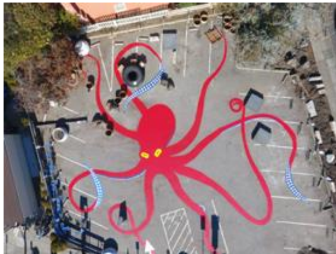
“Ophelia”, Lakeside Landing, District 7, adjacent to the proposed bus shelter mural.