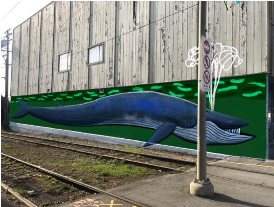
Attachment 9: One image of the proposed site and indicate mural dimensions, approx. 1,620 sq ft.