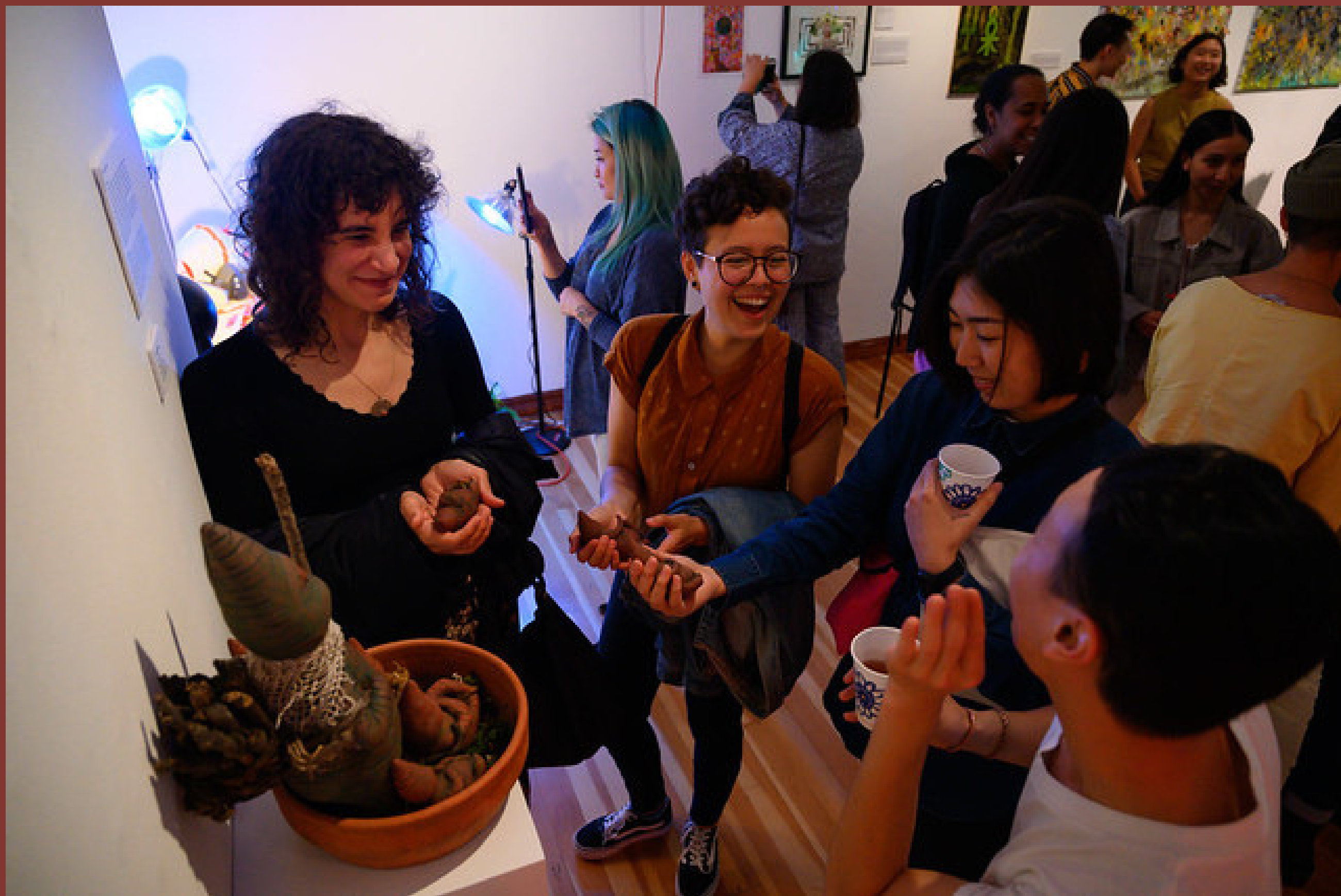
Visual Art: Eco Poca is a visual art, eco-fashion, and performance art exhibit creating a “Kukan,” a space to experience the intersection of two alternate realities — a nuclear apocalypse, vs an advanced eco-society