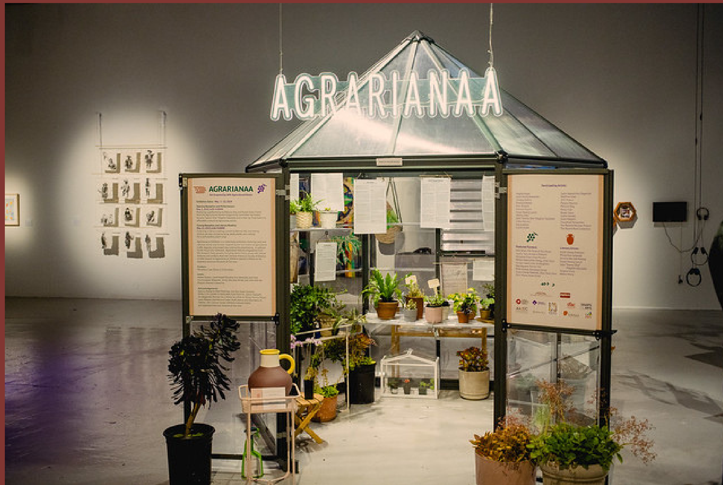
Visual Showcase: Agrariana: Art Inspired by APA Agricultural Roots as the featured visual art exhibition of the United States of Asian America Festival 2019: Collective // Memories.Co-presented by Asian American Women Artists Association.