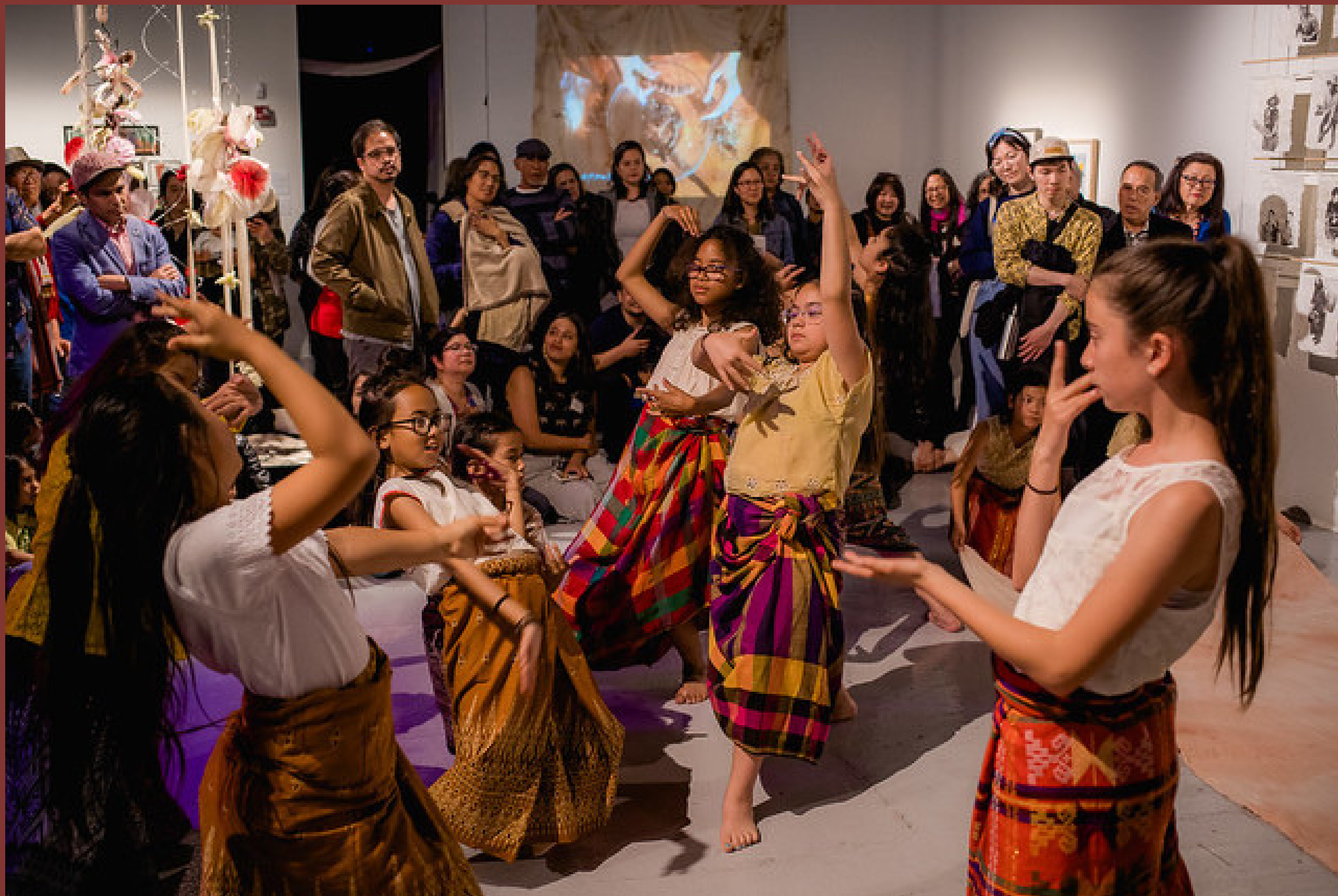
Agrariana: Youth dance ensemble from the Ulumau Collective