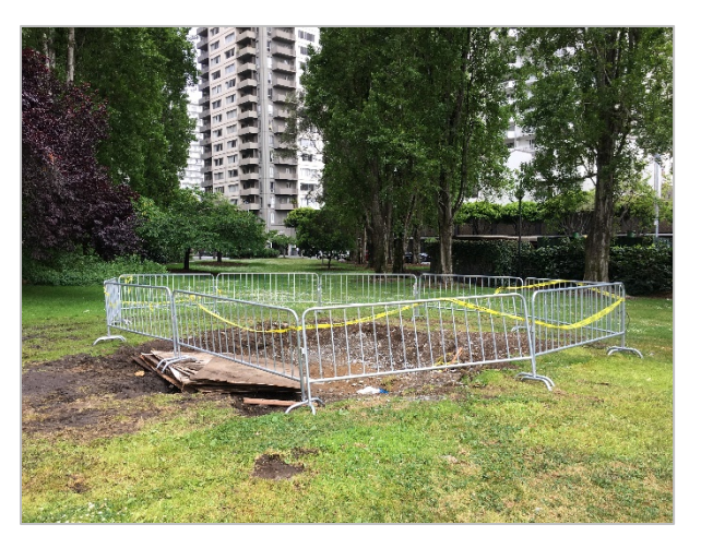
Image 8: Overall view of site after removal and demolition of base.