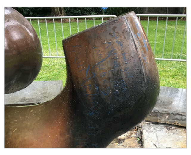
Image 2: Detail image of graffiti vandalism and patina damage from fire.