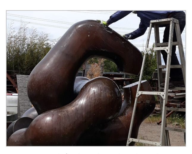
Image 10: Detail of sculpture being cleaned at Karl Reichley's Studio.