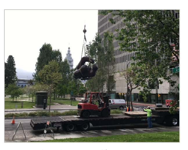
Image 6: Sculpture being removed from Sue Biermann Park via crane.