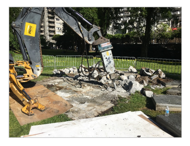
Image 7: Demolition of the concrete base after removal of the sculpture.