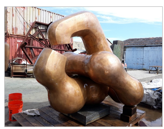
Image 12: Overall image of sculpture after patina removal and buffing of indentations and gouges.