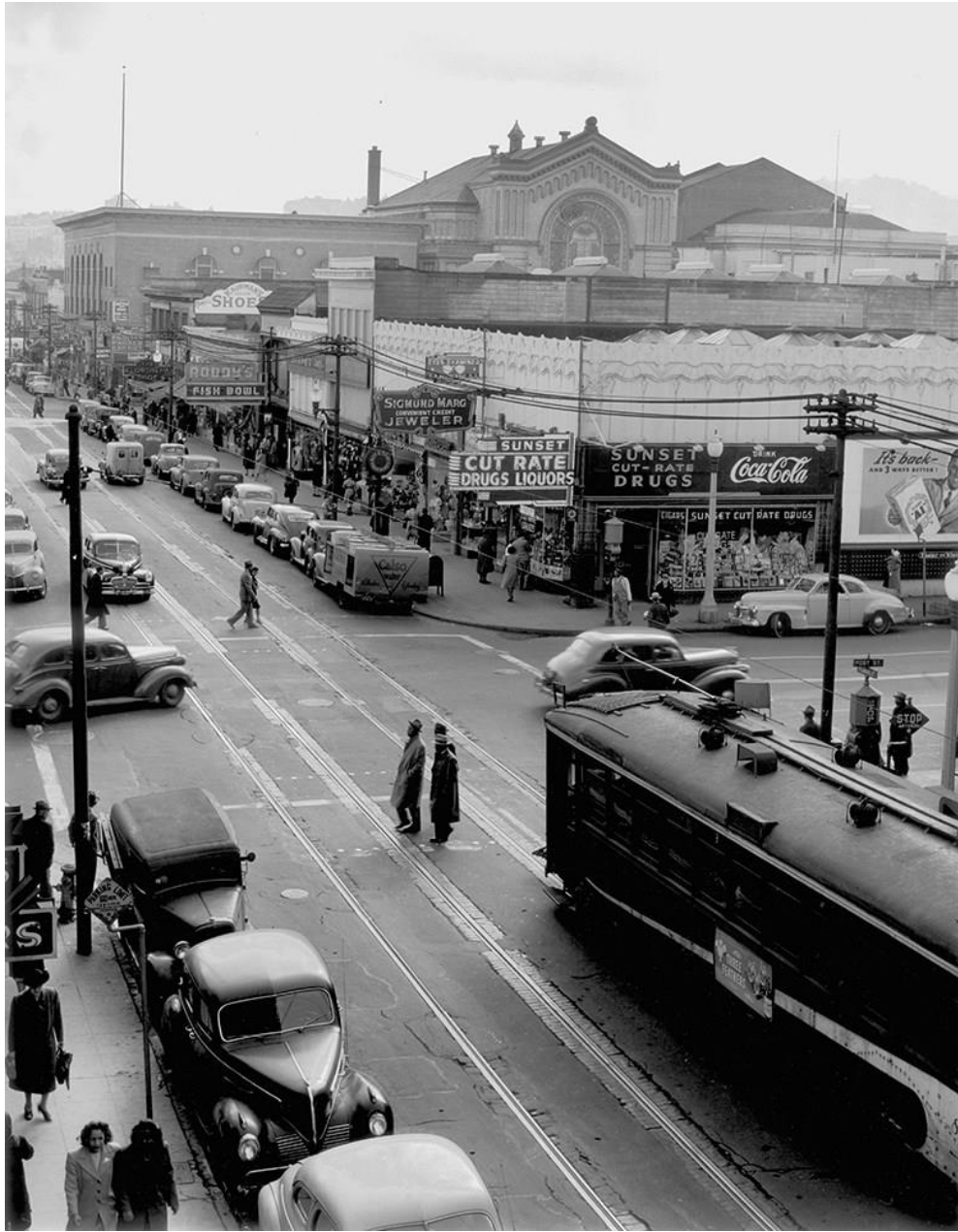
David Johnson, Bird's-Eye View of Fillmore Street, Looking South Towards Post Street and Geary Street , archival pigment print, 20" x 24", C.1940s, $400