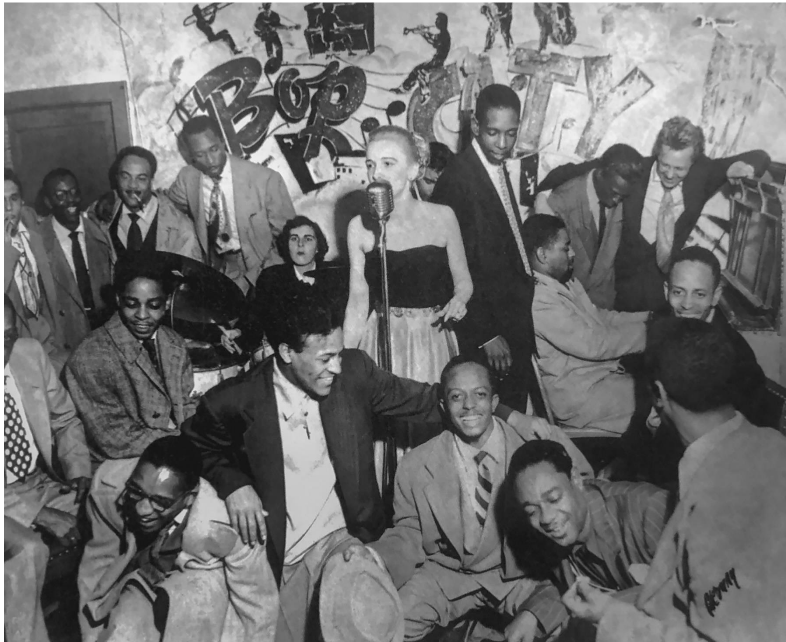
Unknown photographer, Jam Session Inside Bop City , 1951, archival pigment print, 20" x 24", 1951, $400