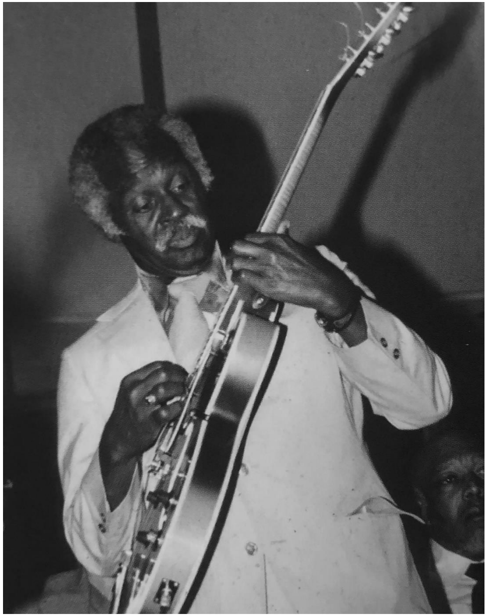
Unknown photographer, Saunders King with One of His Many Hollow-Body Guitars , archival pigment print, 20" x 24", C.1970s, $400