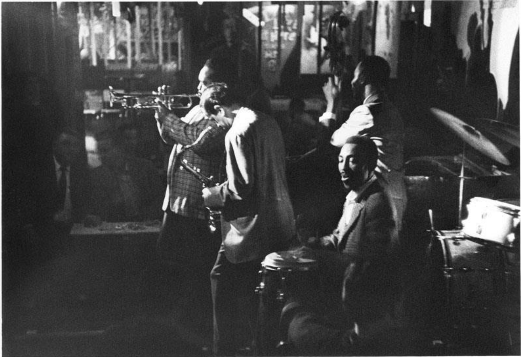
Jerry Stoll, Jam Session Inside Bop City , archival pigment print, 20" x 24", date unknown, $400