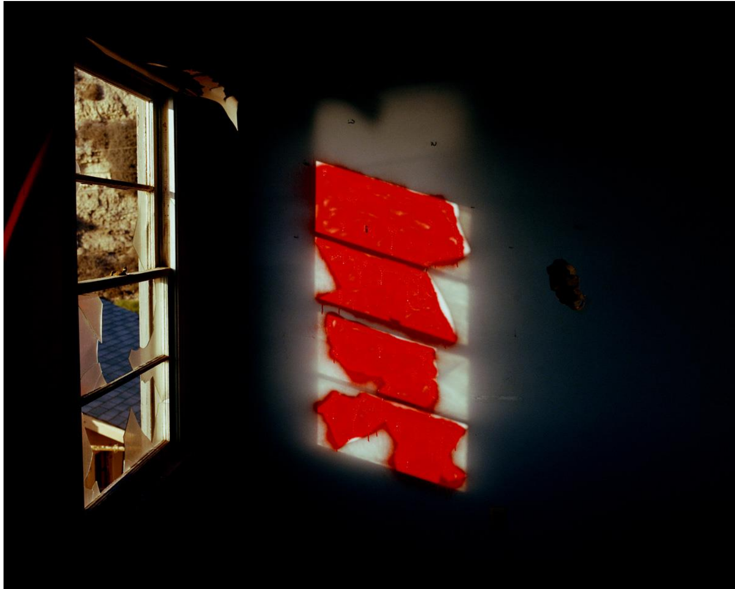
John Divola, Zuma #5, archival digital color pigment print, 24" x 30", $10,000