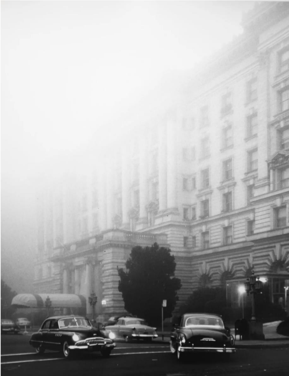
Fred Lyon, Fairmont Hotel in Fog atop San Francisco's Nob Hill , vintage gelatin silver print, 14" x 11", C.1950s, $7,500