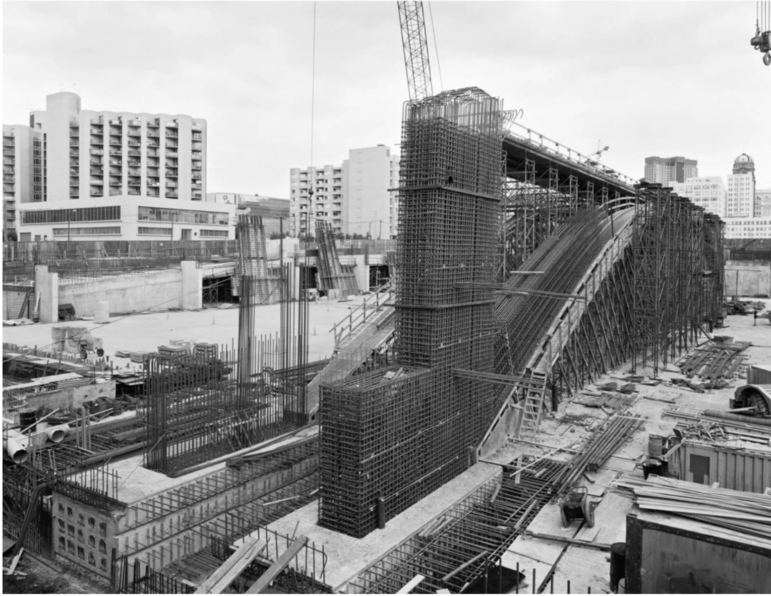
Catherine Wagner, Arch Construction IV, George Moscone Site, San Francisco , archival pigment print, 20" x 24", 1978, $12,000