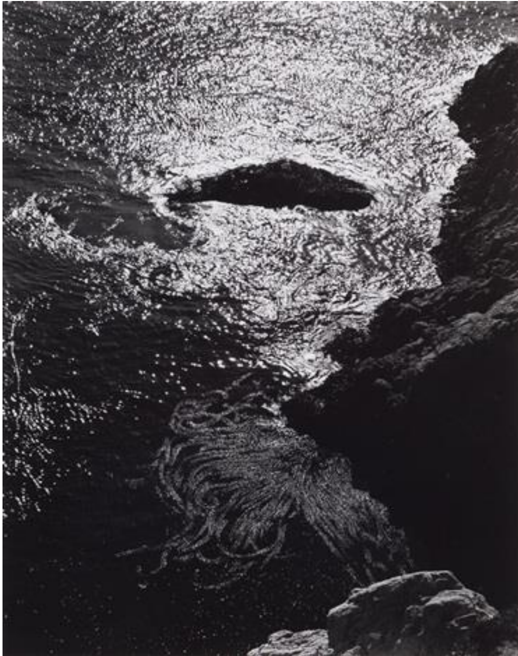
Edward Weston, China Cove , gelatin silver print, 7-1/2" x 9-1/2", date unknown, $6,000