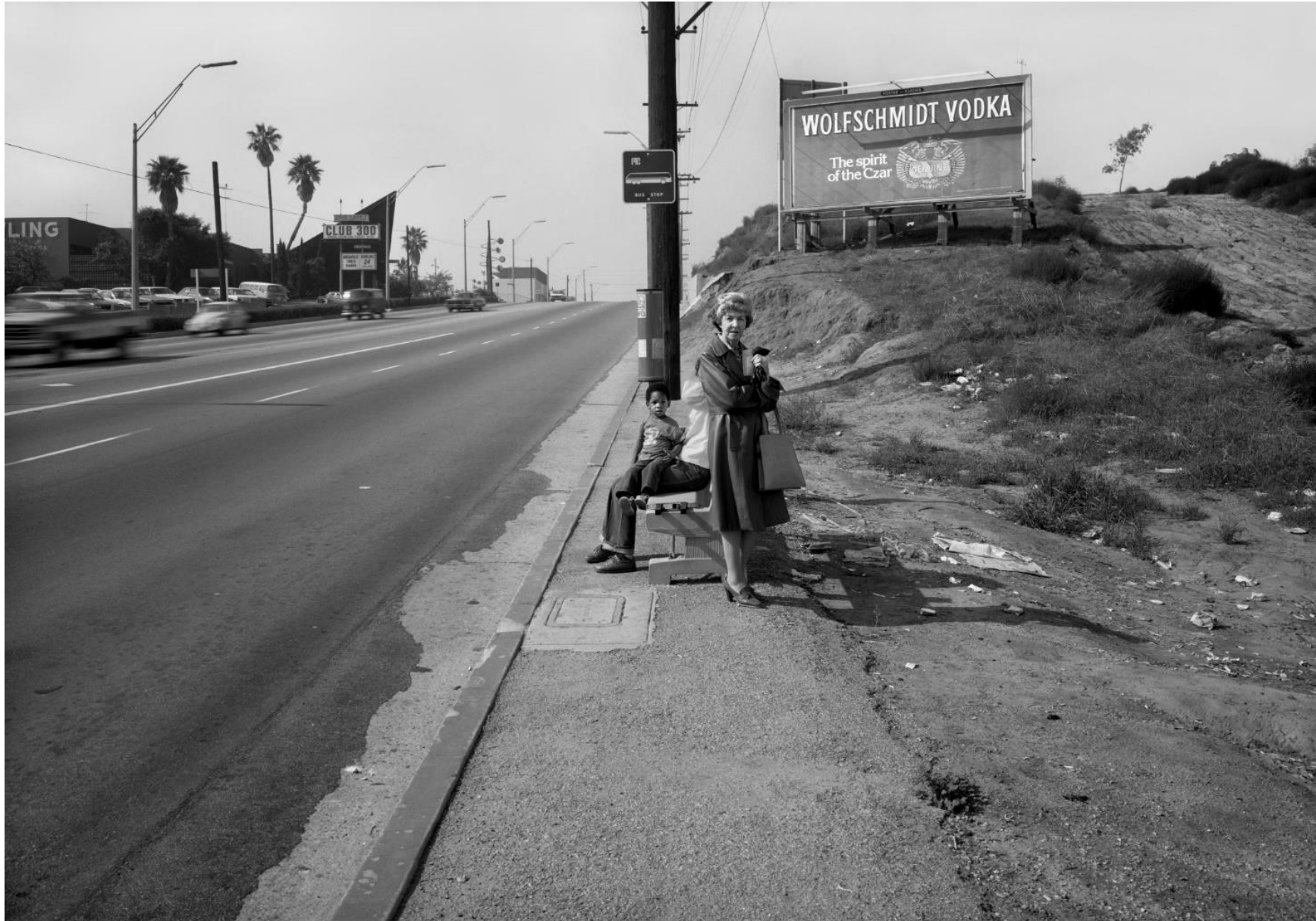
Anthony Hernandez, Public Transit Areas #10 , gelatin silver print, 30" x 40", 1980, $9,000