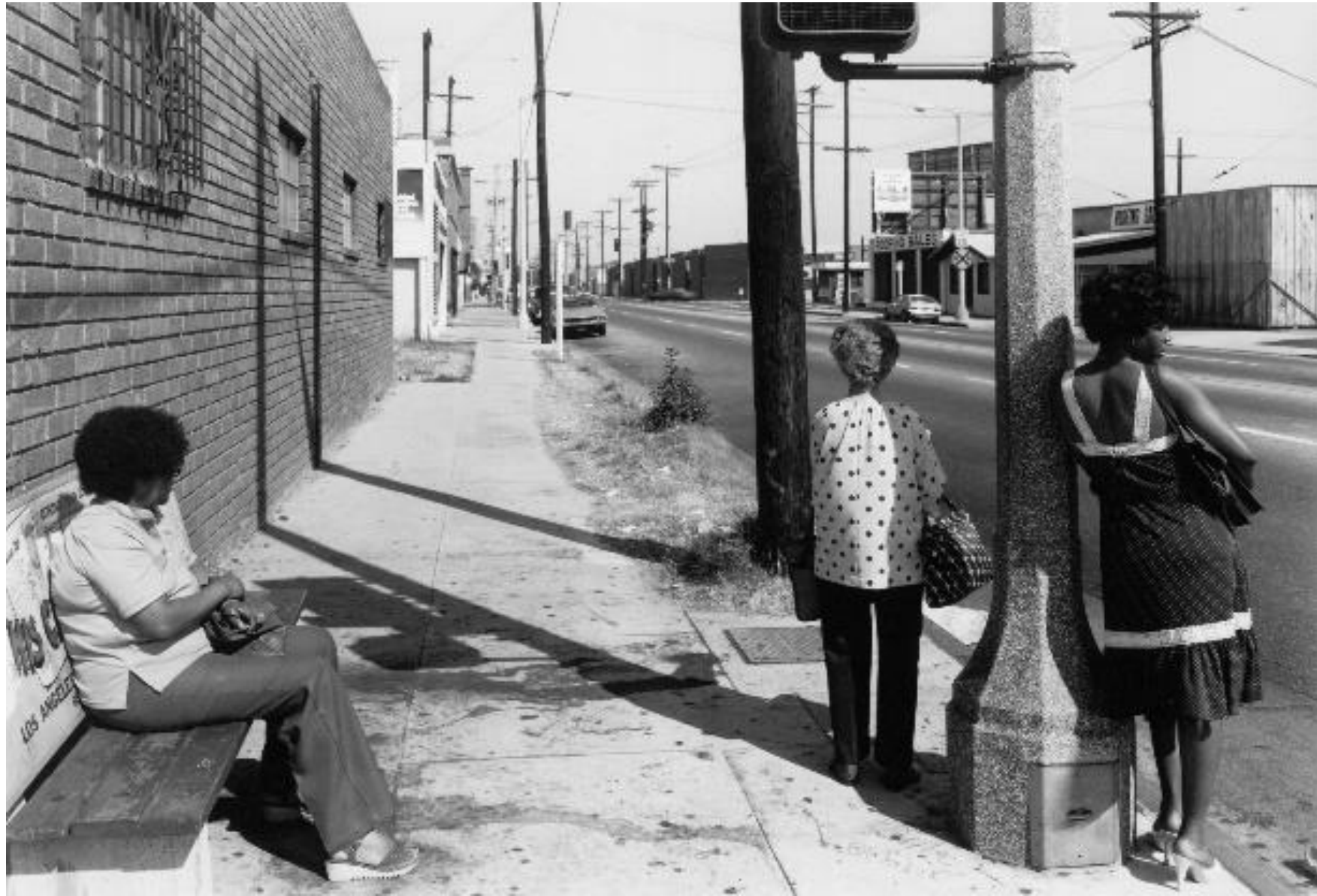
Anthony Hernandez, Public Transit Areas #46 , gelatin silver print, 30" x 40", 1979, $9,000