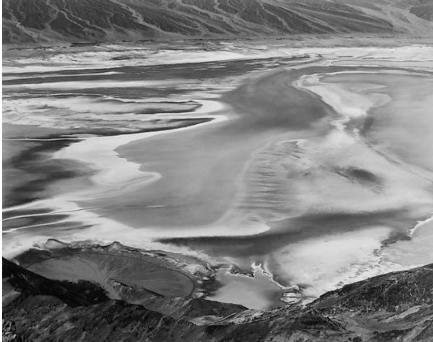
Edward Weston, Dante's View , gelatin silver print, 7-1/4" x 9-1/4", 1938, $8,000