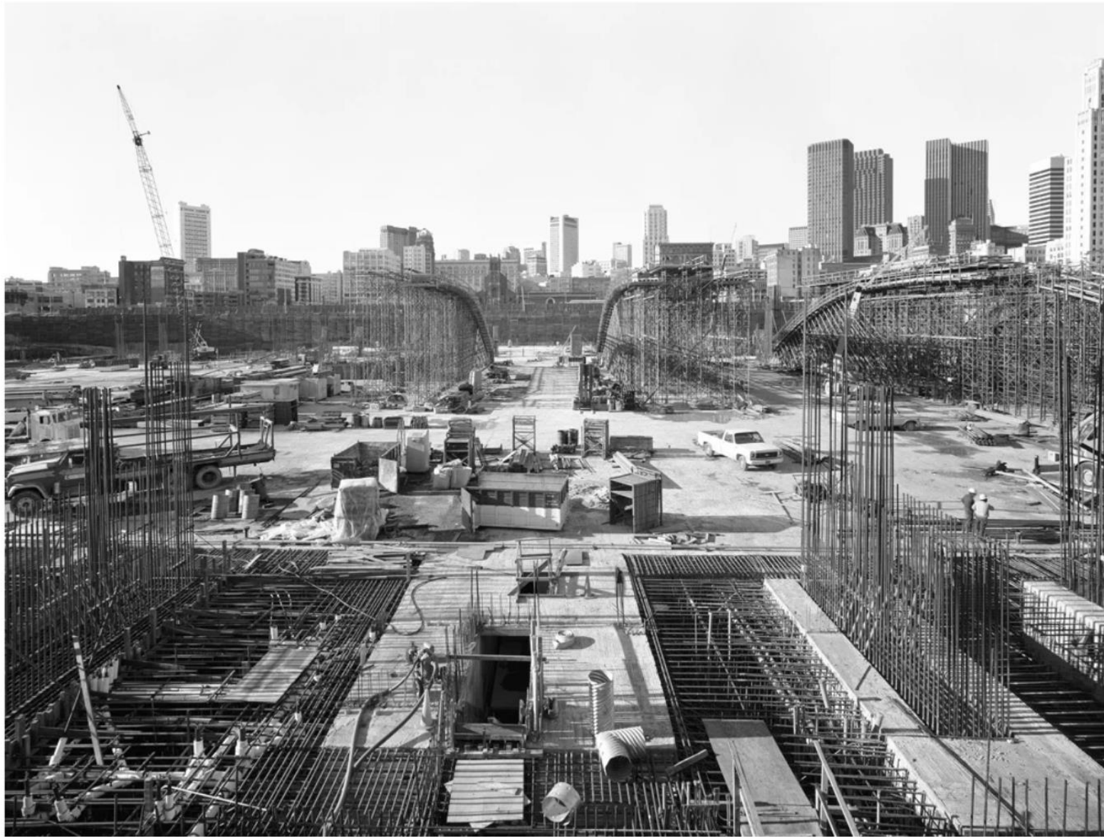
Catherine Wagner, Northern Vista, George Moscone Site, San Francisco , archival pigment print, 20" x 24", 1978, $12,000