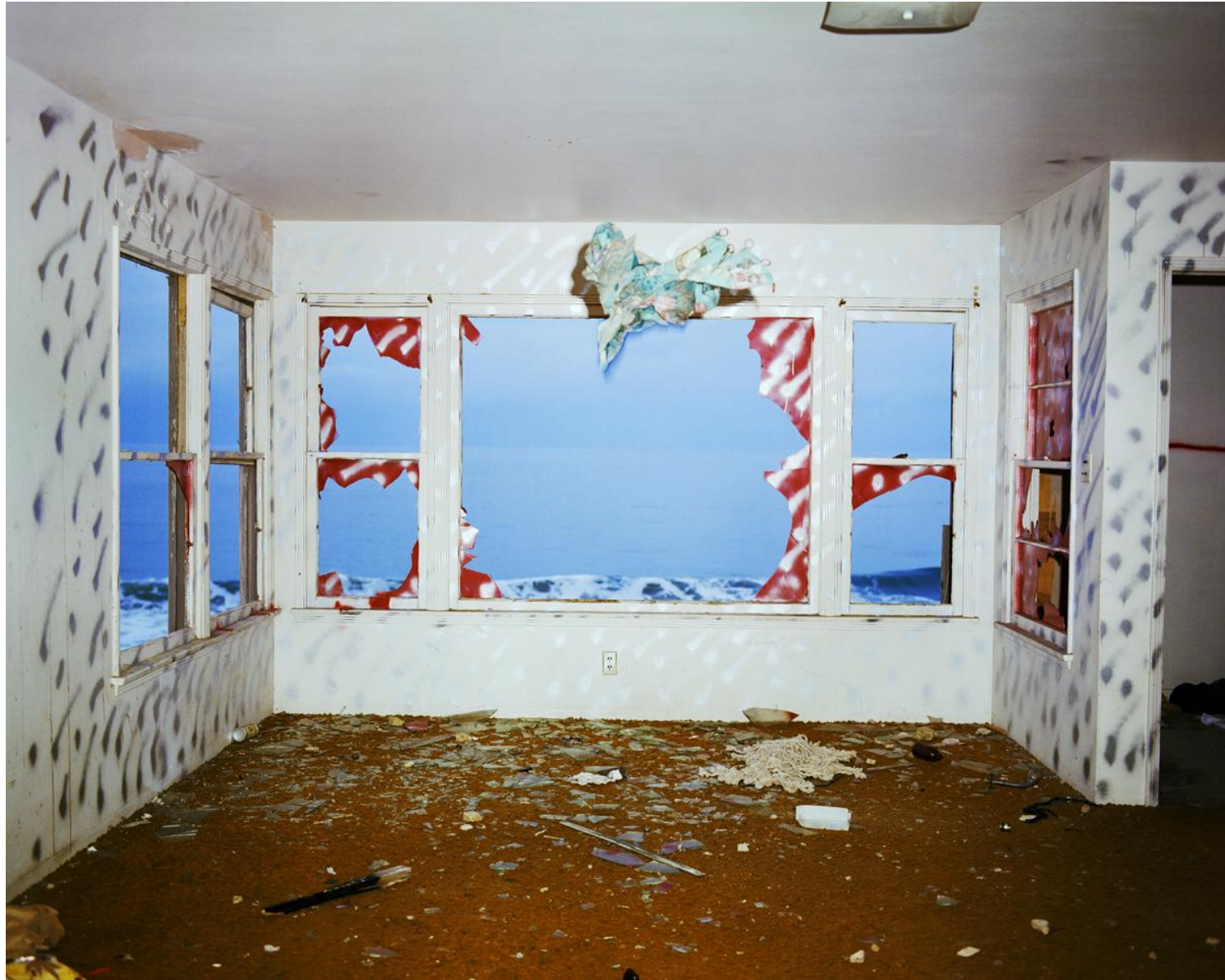
John Divola, Zuma #12, archival digital color pigment print, 24" x 30", $10,000