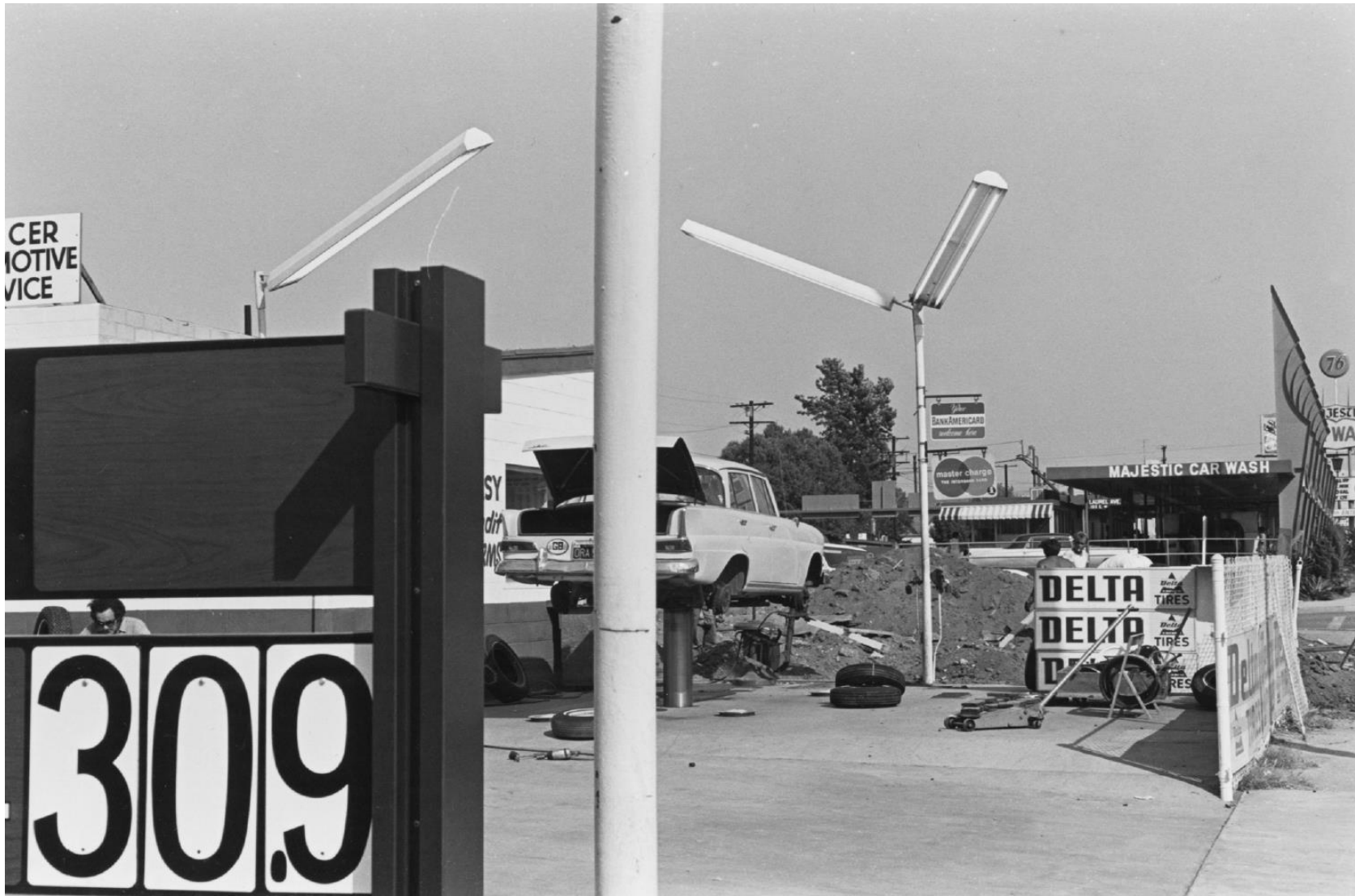
Lee Friedlander, Los Angeles, California , gelatin silver print, 11" x 14", 1970, $14,000