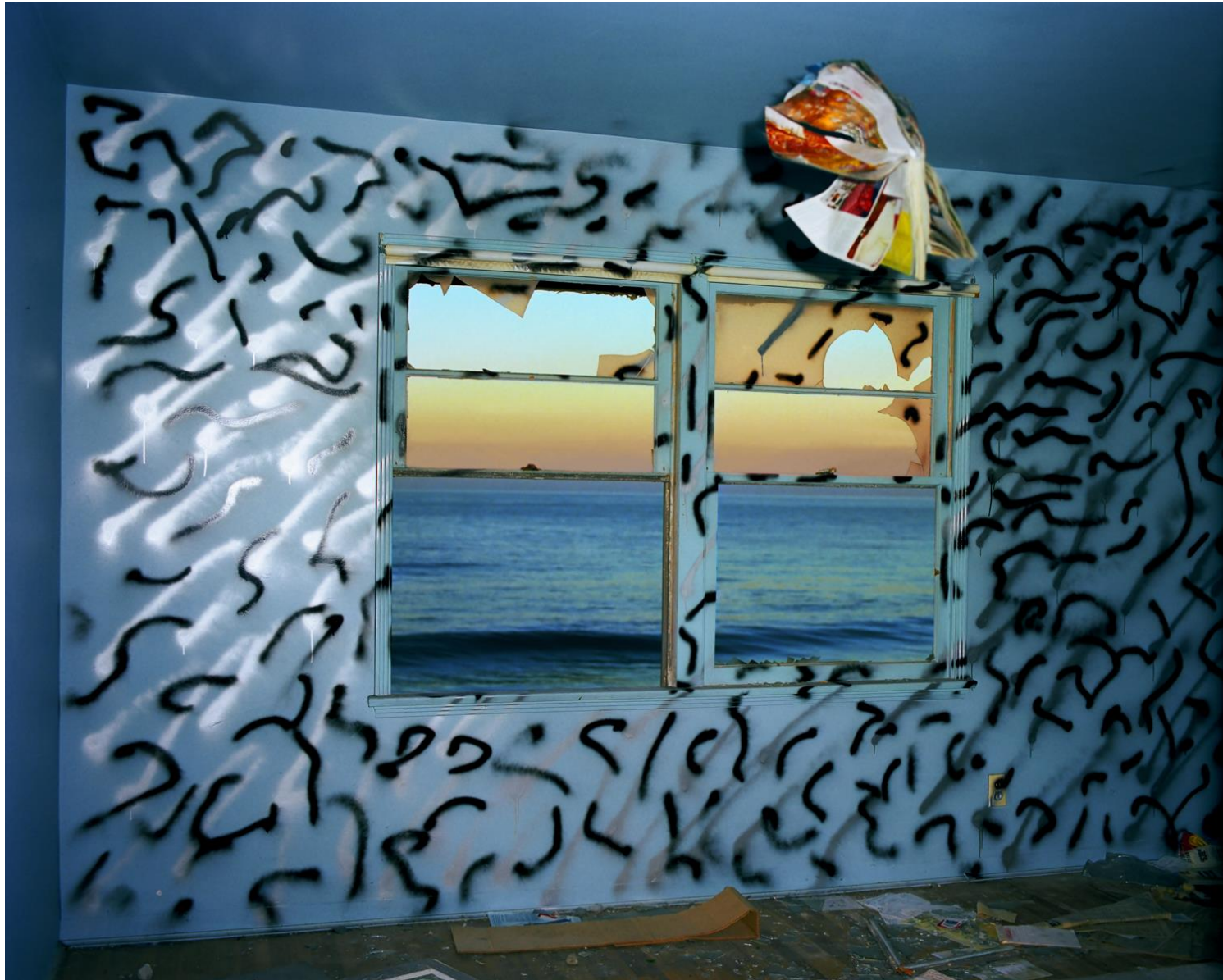
John Divola, Zuma #70, archival digital color pigment print, 24" x 30", $10,000