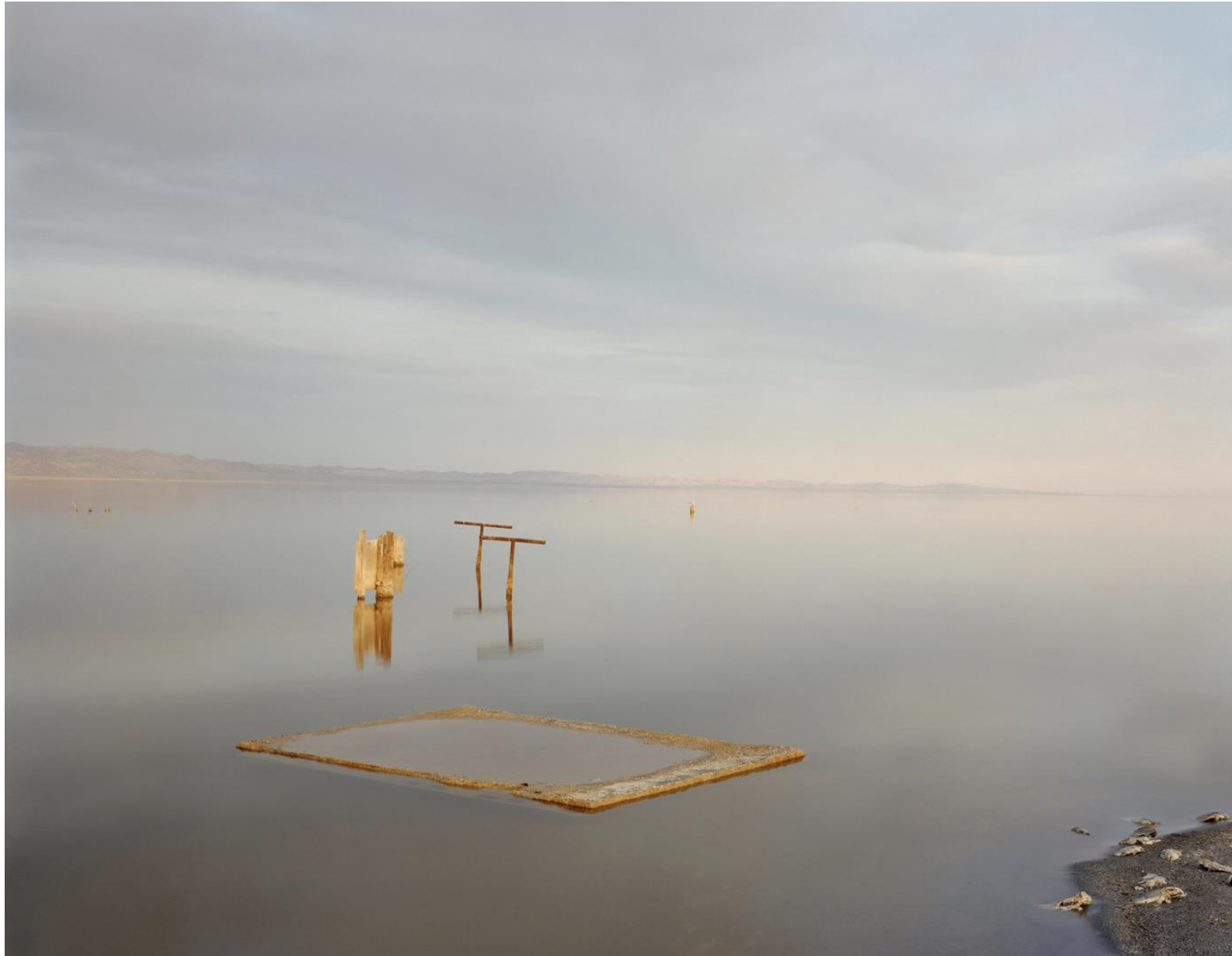
Richard Misrach, Dead Fish, Salton Sea , pigment print, 20" x 24", 1983, $18,000