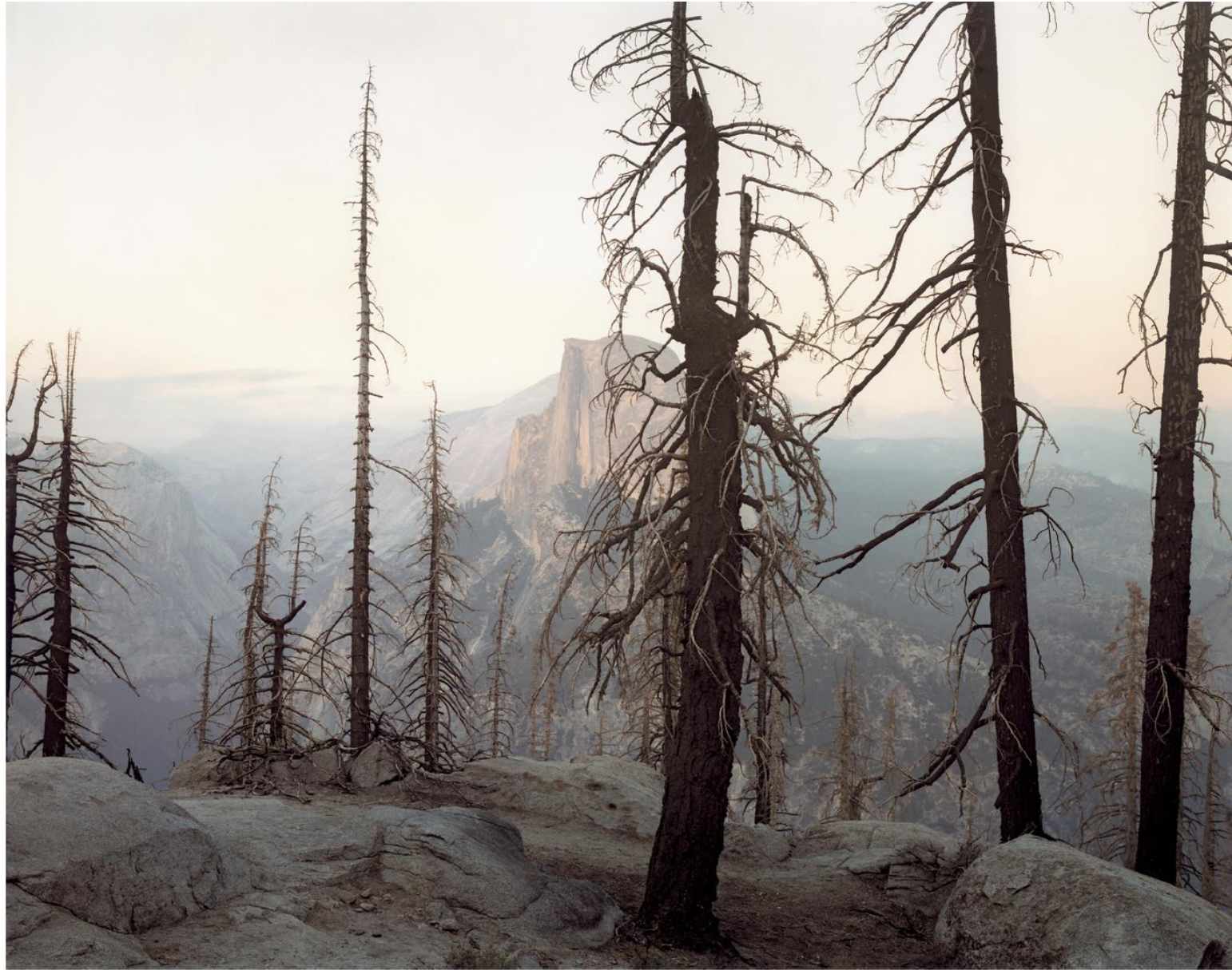
Richard Misrach, Burnt Forest and Half Dome, Yosemite , pigment print, 30" x 37", 1988, $18,000