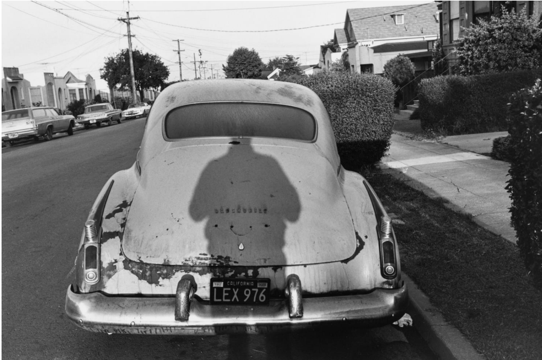
Lee Friedlander, Alameda, California , gelatin silver print, 11" x 14", 1967, $9,000