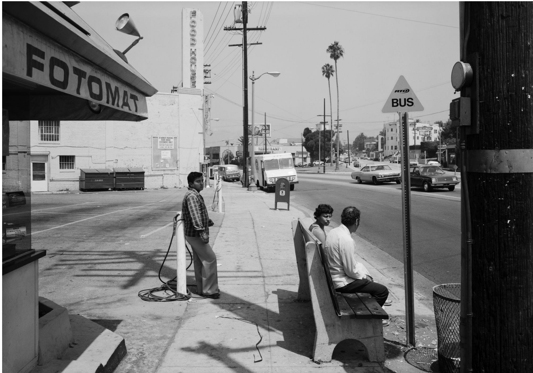
Anthony Hernandez, Public Transit Areas #8 , gelatin silver print, 30" x 40", 1979, $9,000