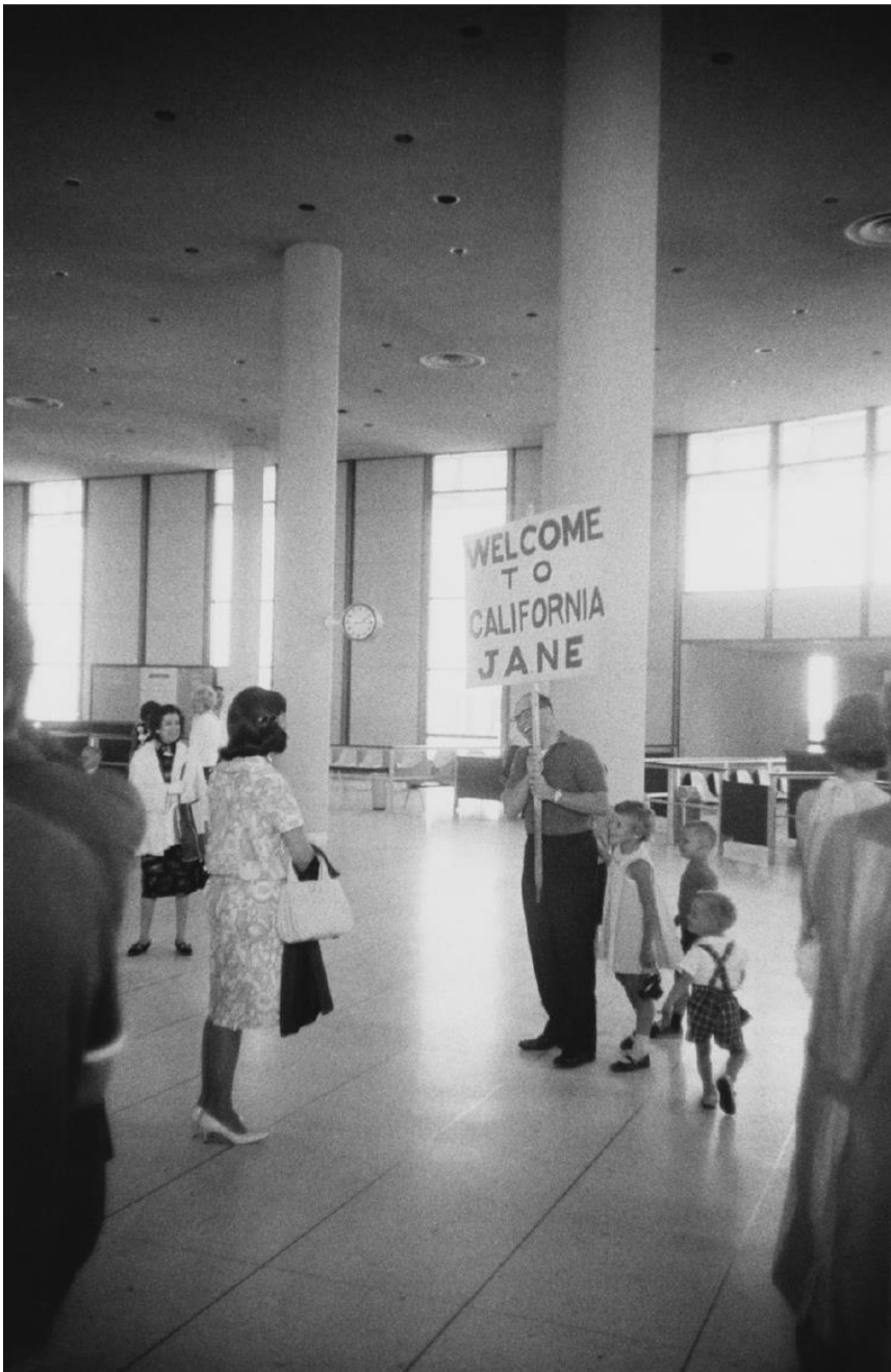
Garry Winnogrand, Los Angeles International Airport, gelatin silver print, 14" x 11", 1964, $9,500