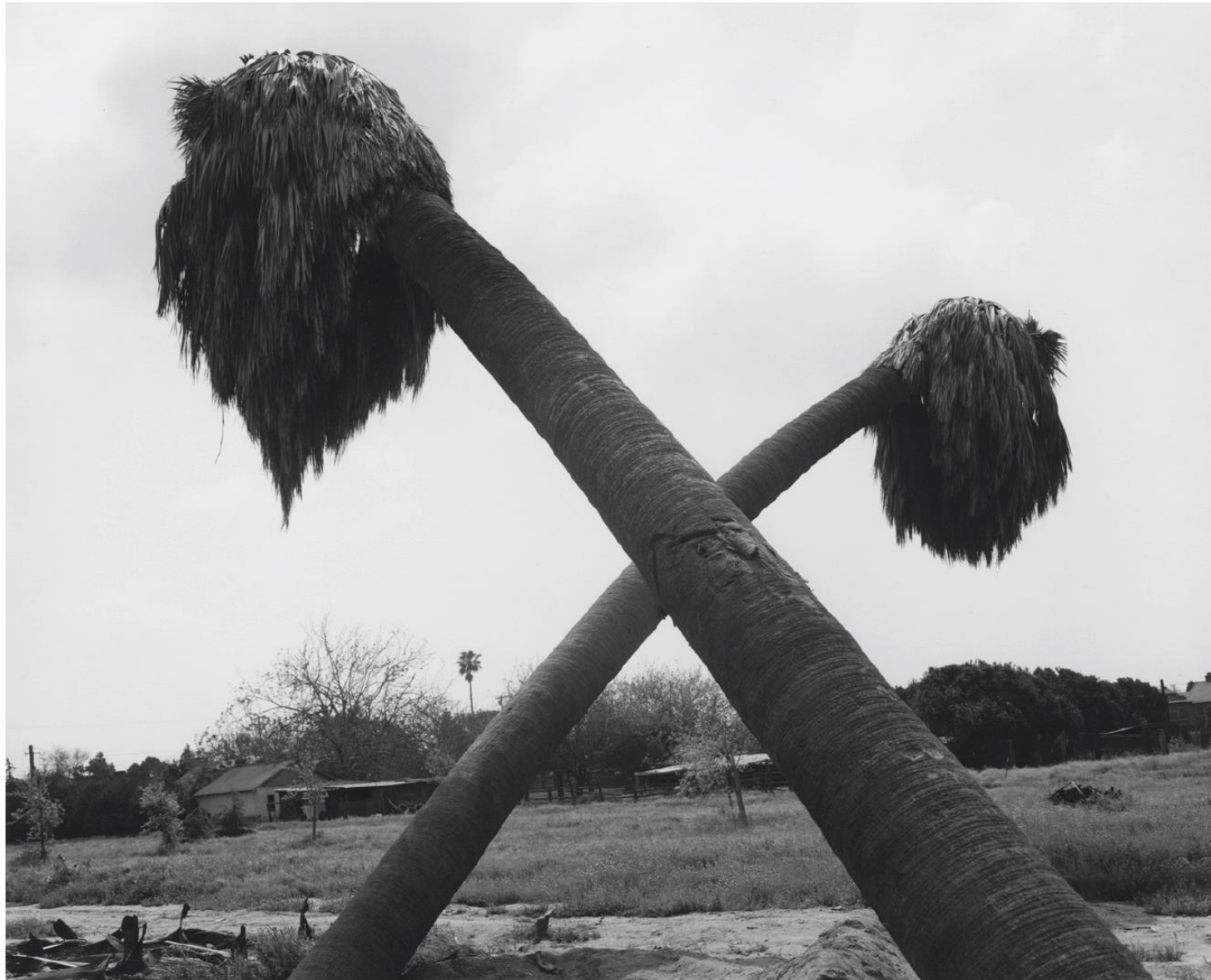
Robert Adams, Dead Palms, Partially Uprooted, Ontario, California , gelatin silver print, 16" x 20", 1983, $21,000