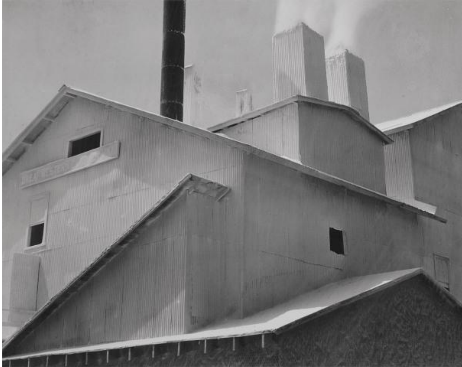
Edward Weston, Plasterworks , gelatin silver print, 9-1/8" x 7-1/4", 1927, $12,000