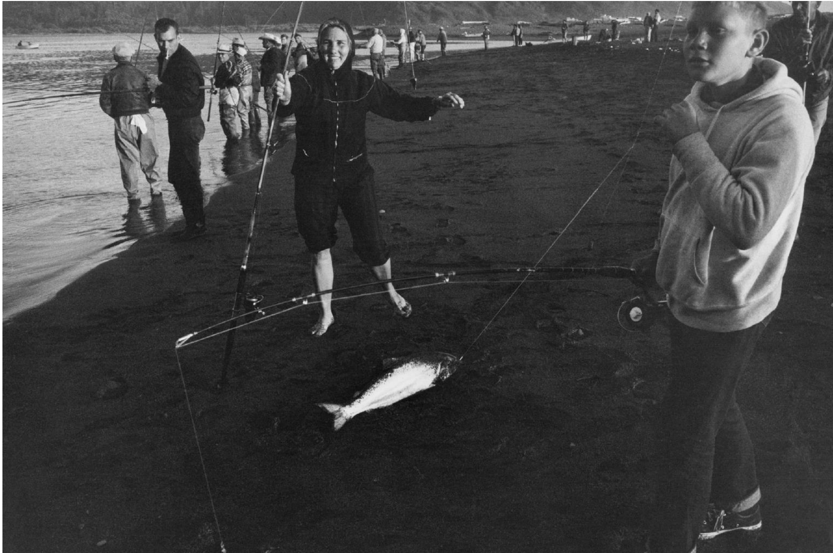
Garry Winnogrand, Klamath River, California, gelatin silver print, 14" x 11", 1964, $21,000