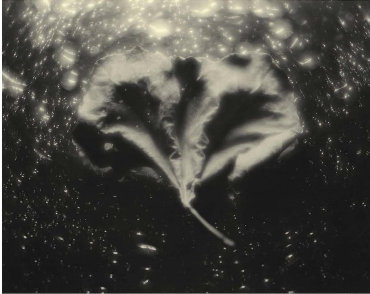
Linda Connor, Leaf, California , contact print on printing out paper, 8" x 10", 1972, $3,500