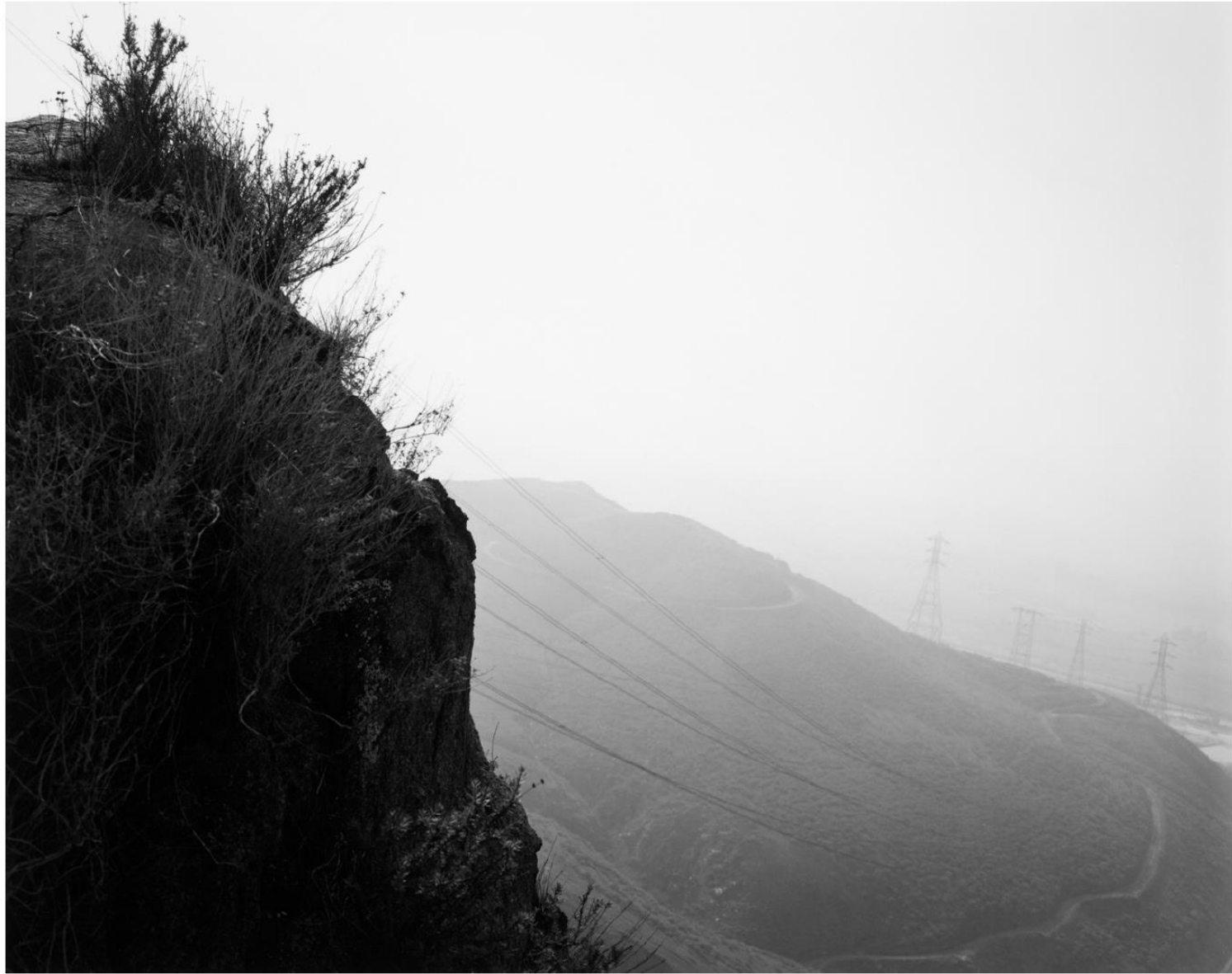
Robert Adams, La Loma Hills, Colton California , gelatin silver print, 16" x 20", 1983, $19,000