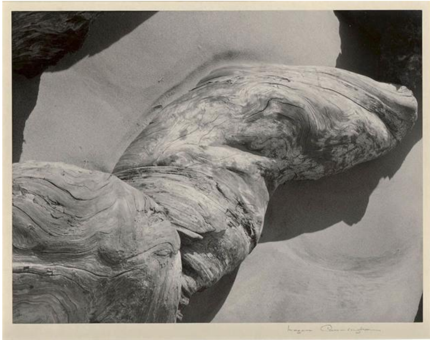
Imogen Cunningham, Log on Beach , vintage gelatin silver print, 7-1/2" x 9-1/4", 1948, $25,000