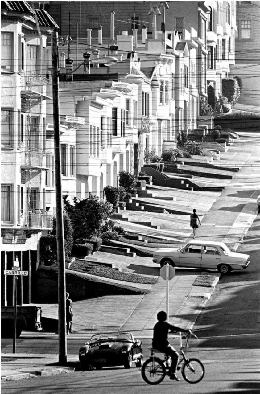
Fred Lyon, Boy on Bicycle, Cabrillo and 22 nd Avenue , gelatin silver print, 14" x 11", C.1950s, $2,500