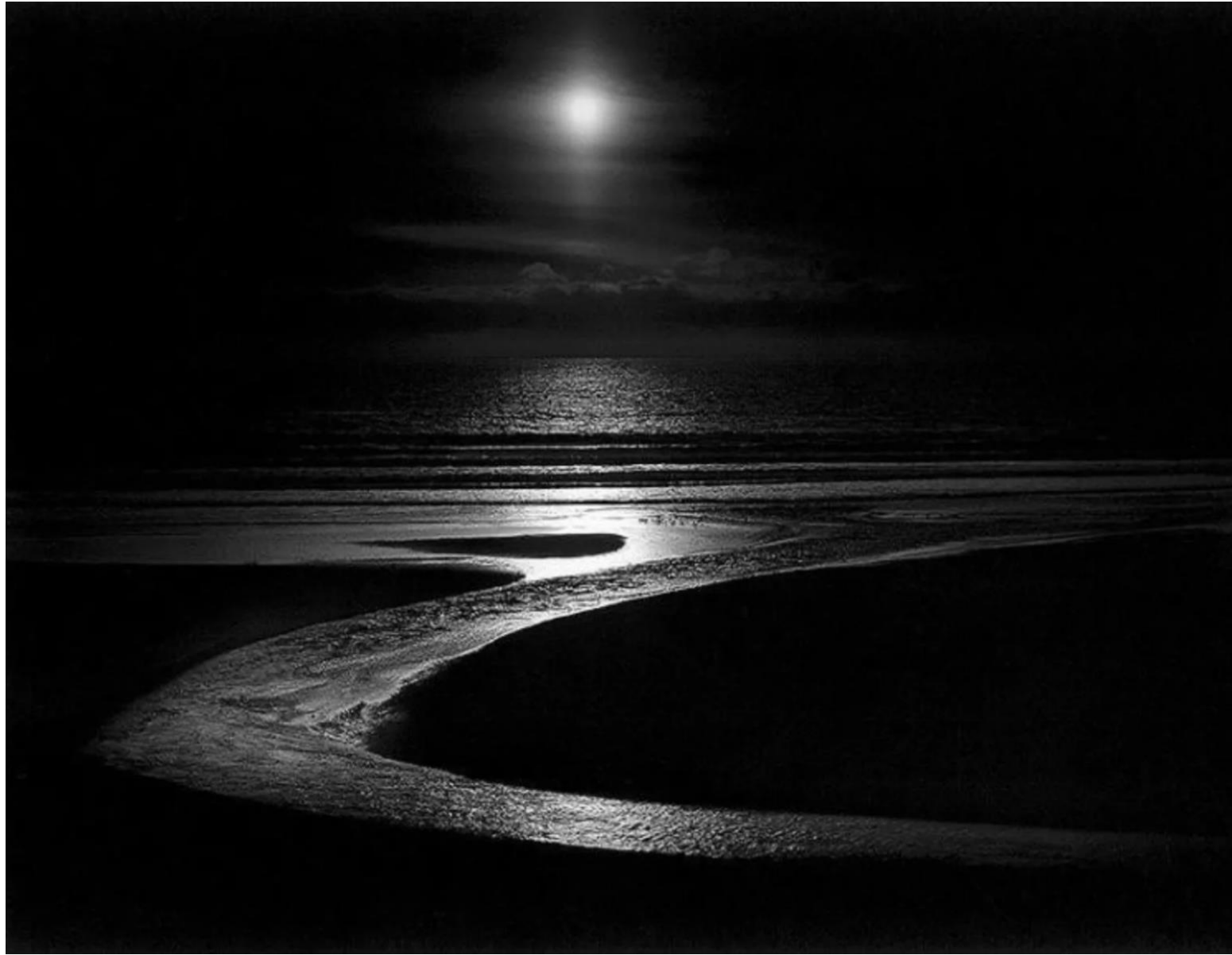
Wynn Bullock, Let There be Light , silver gelatin print, 7-1/2" x 9-1/2", 1954, $25,000