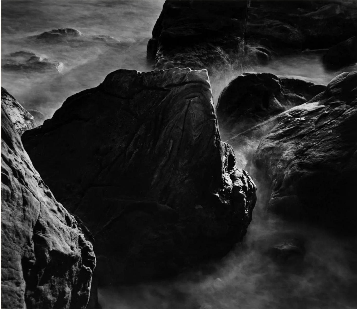
Wynn Bullock, Rocks and Waves , vintage silver gelatin print, 7-1/2" x 9", 1968, $10,000