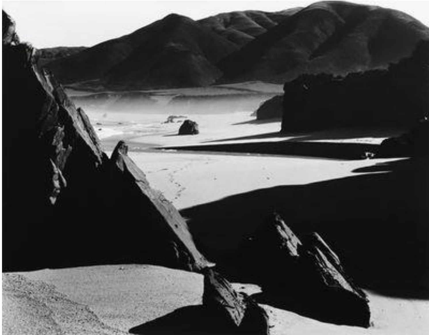
Brett Weston, Garrapata Beach, California , gelatin silver print, 7-1/2" x 9-1/2", 1954, $10,000