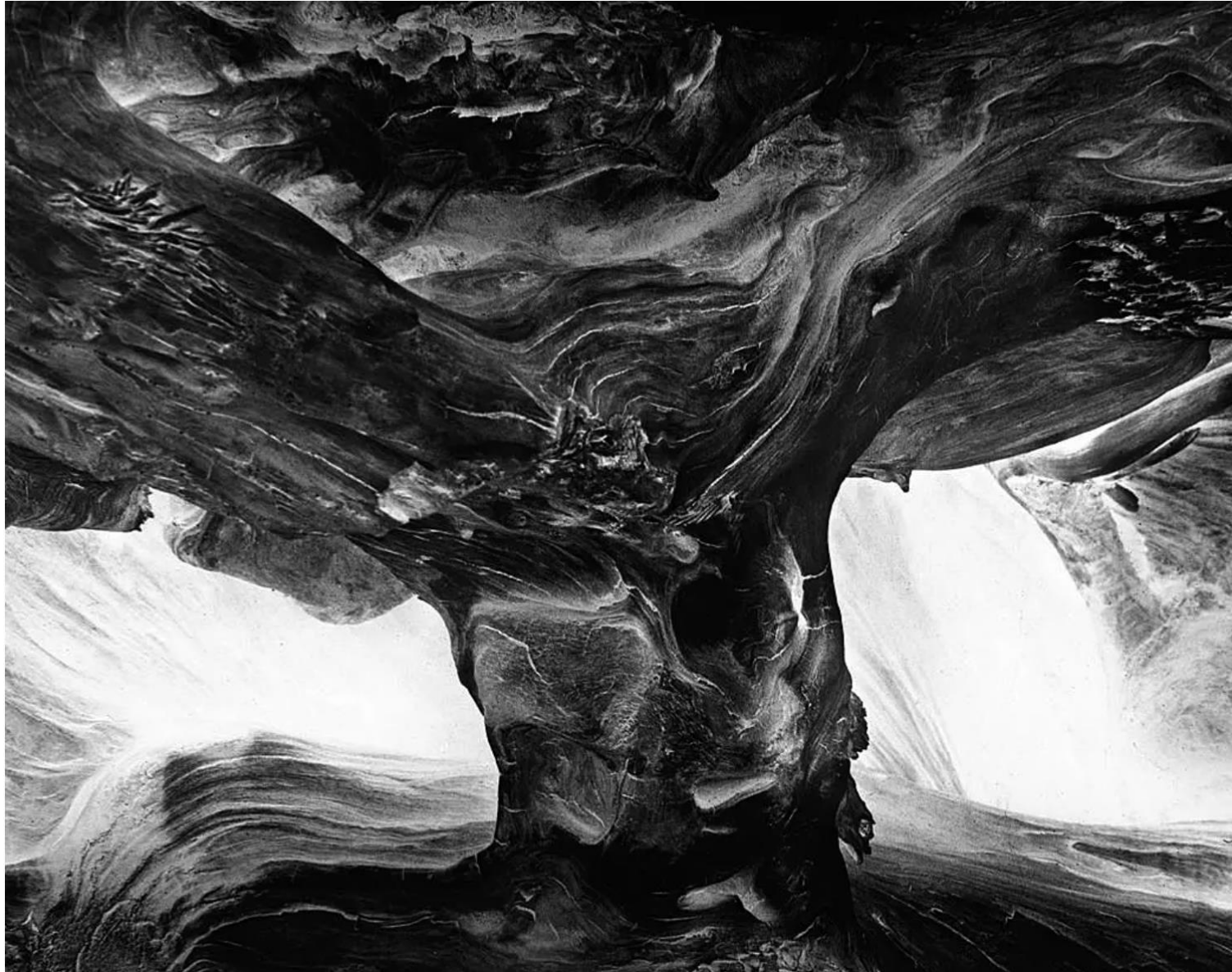
Wynn Bullock, Tree Trunk , vintage gelatin silver print, 7-1/2" x 9-1/2", 1971, $15,000