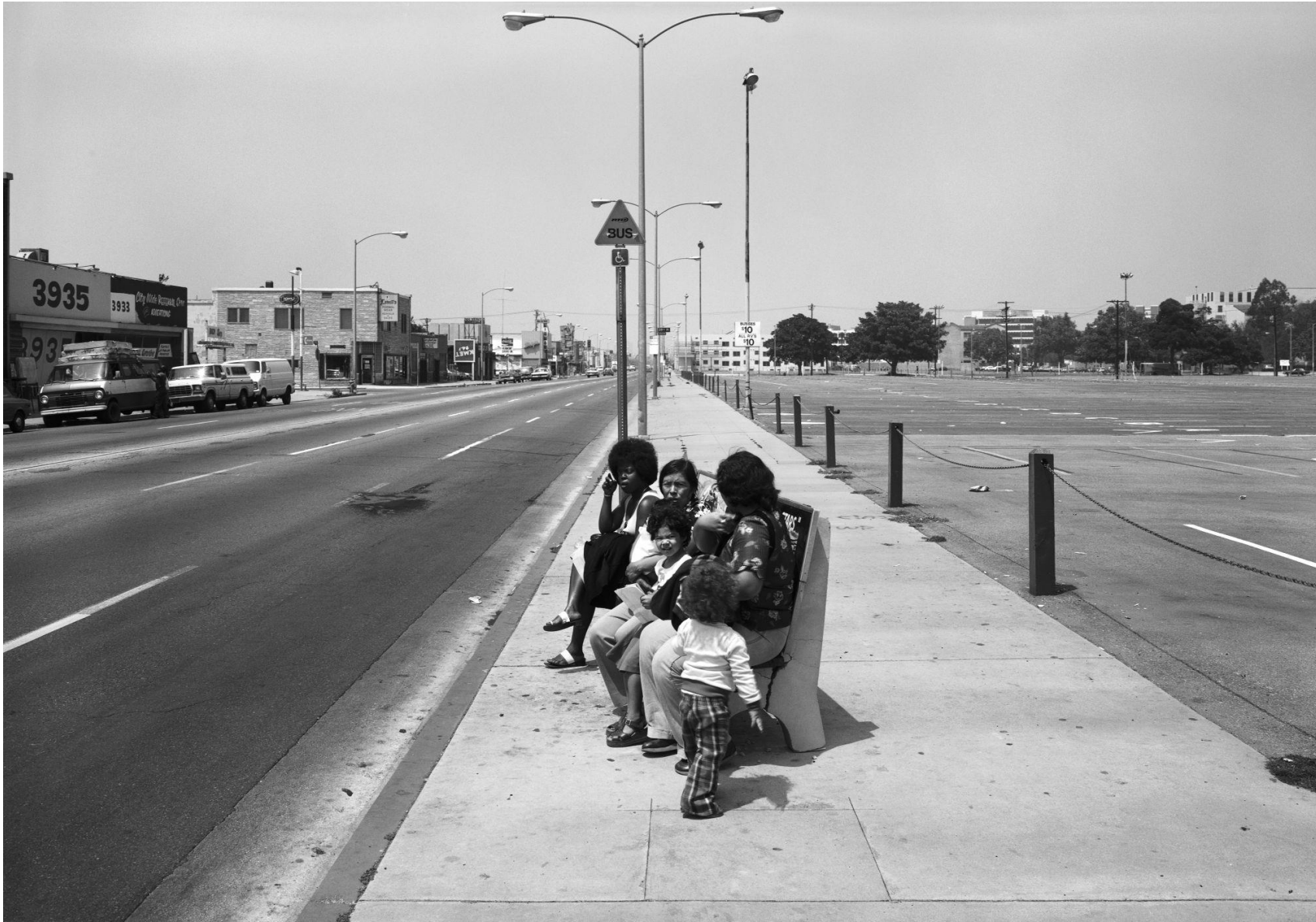
Anthony Hernandez, Public Transit Areas #6 , gelatin silver print, 30" x 40", 1979, $9,000