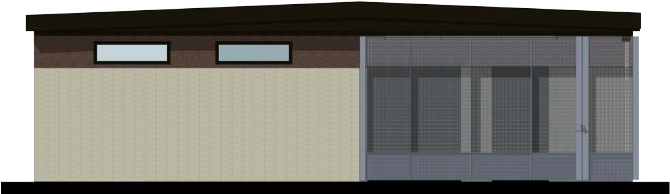
SOUTH GATE ELEVATION CLOSED