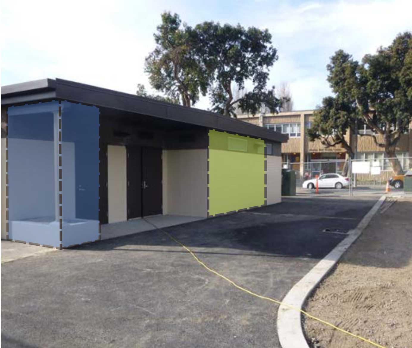
OPEN (DURING DAY)