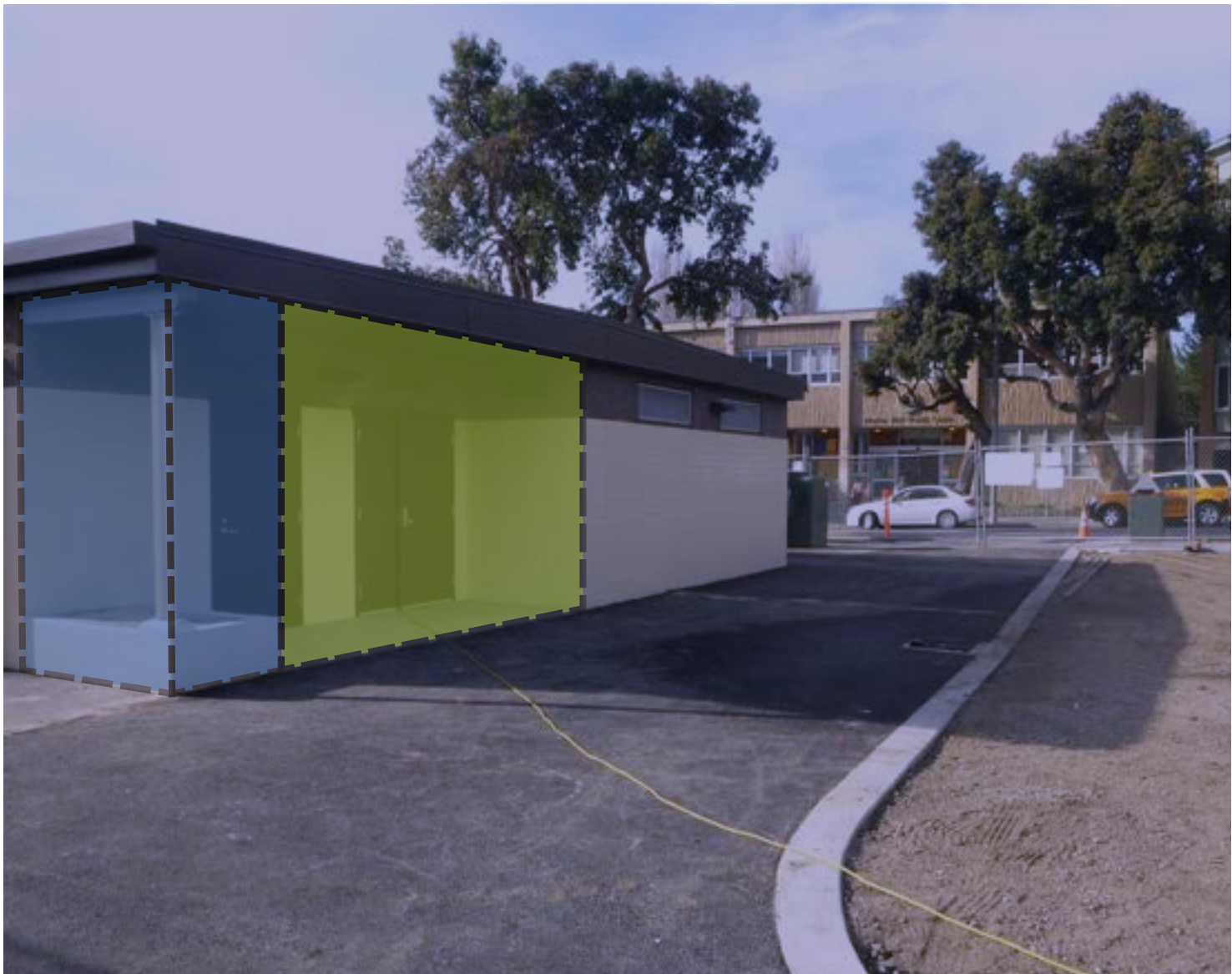
CLOSED (AT NIGHT)