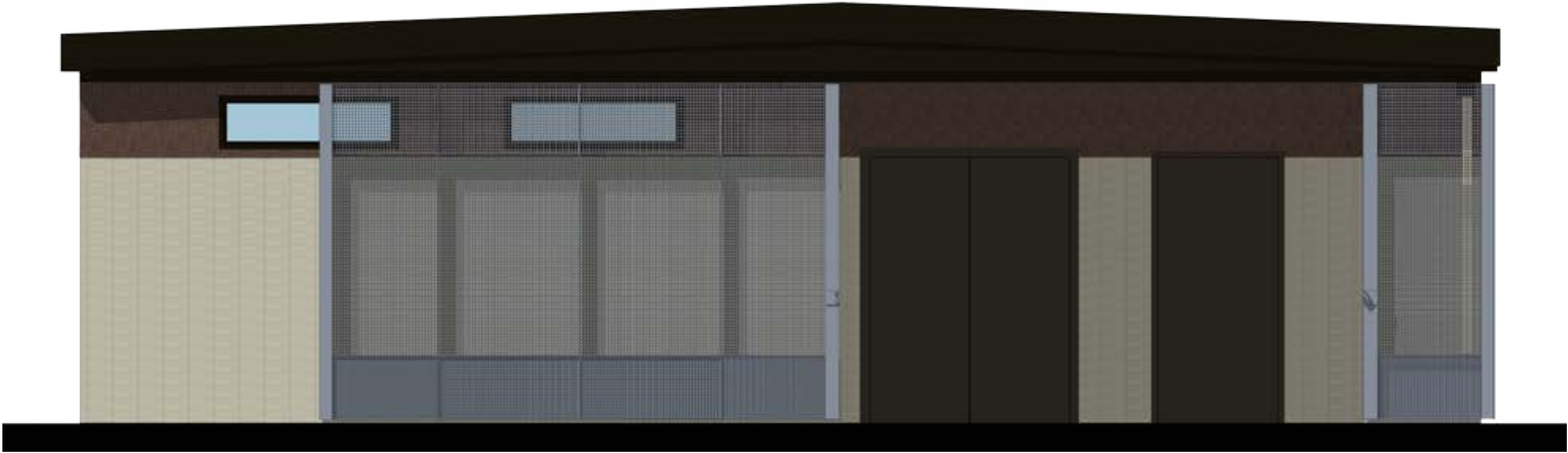
SOUTH GATE ELEVATION OPEN