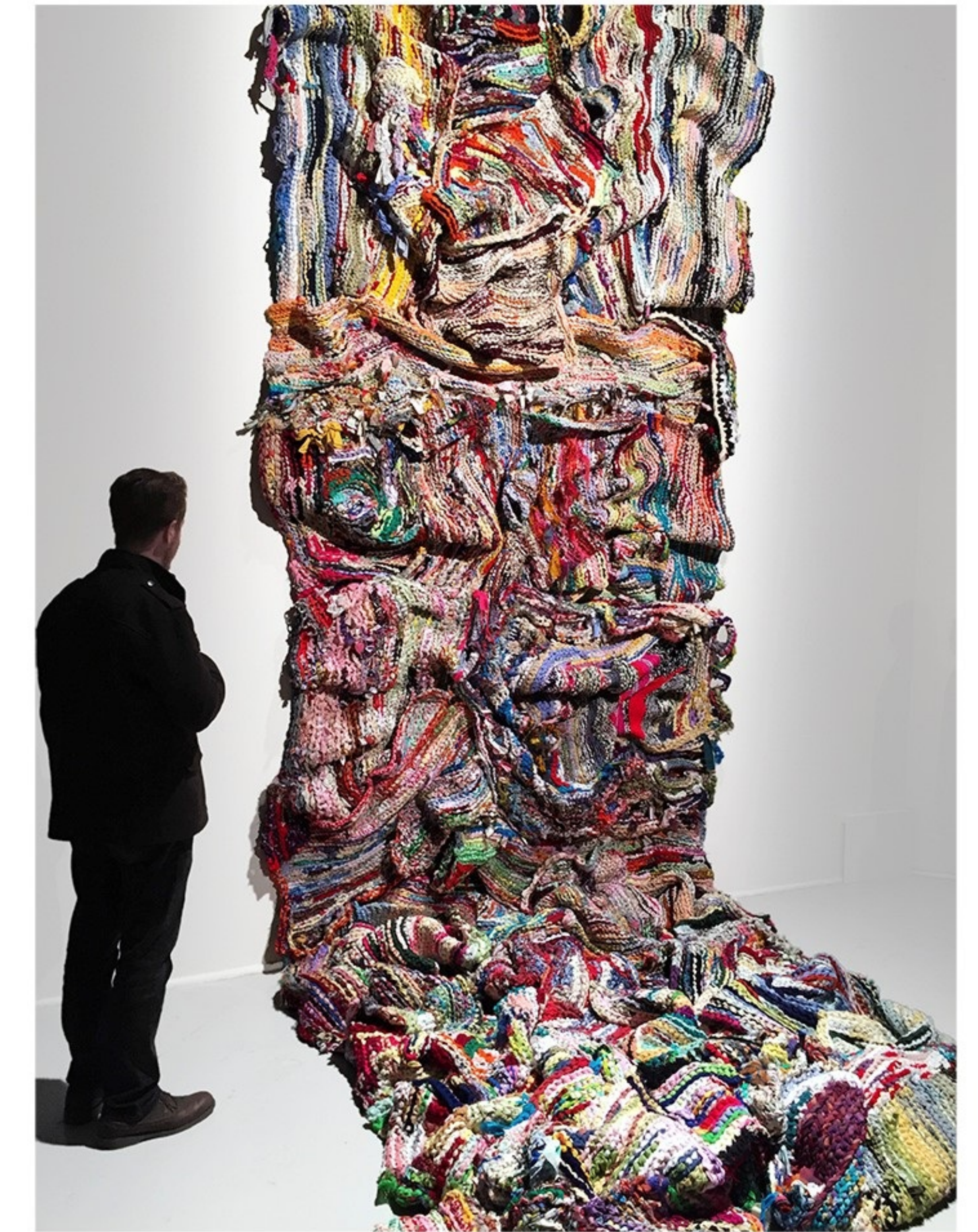
Above: Large sculpture with figure for scale Below: Detail of texture

Woven Calmness consists of a 23 feet by 9 feet crocheted fabric tapestry, specifically designed for the main lobby area at the Southeast Health Center Expansion. I incorporate different hand-weaving techniques—braiding, quilting, sewing, and crocheting strips of fabric—to create a three-dimensional woven tapestry. I have specifically designed large, one-of-a-kind, re-purposed Berkeley redwood crochet hooks to weave the tapestries. Woven Calmness is based on the premier African-American tradition of using improvisation and contrasting colors as the primary structure for creativity and design. Each tapestry represents the role of folk-art weaving and fabric traditions within the African-American community and their imbued powers to heal, support, and unite in times of adversity. Each tapestry will be attached on a wooden panel, mounted on the wall with metal cleats, protected by plexiglass and inset into the wall.