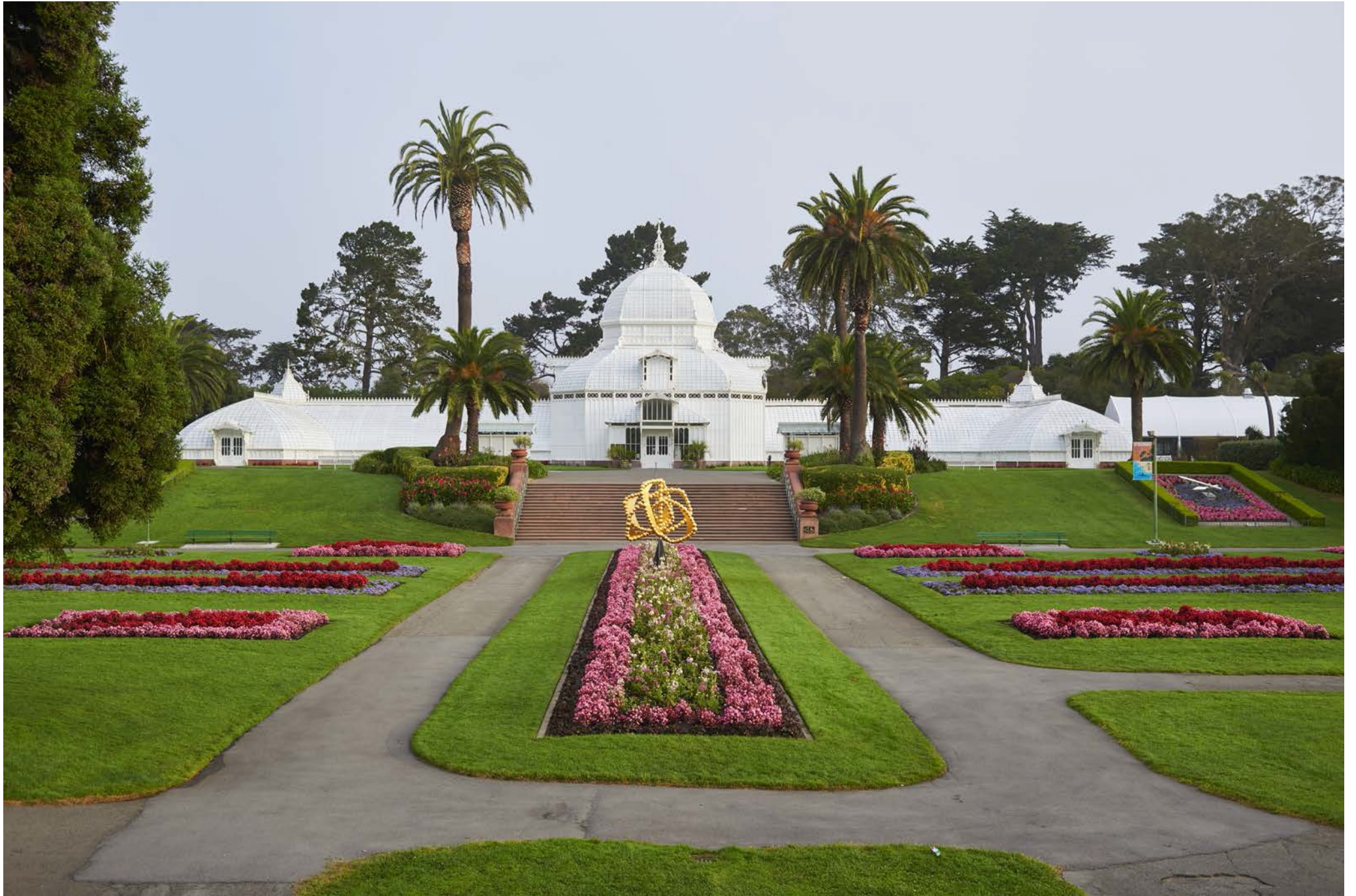
Jean-Michel Othoniel / La Rose des Vents / San Francisco 2015