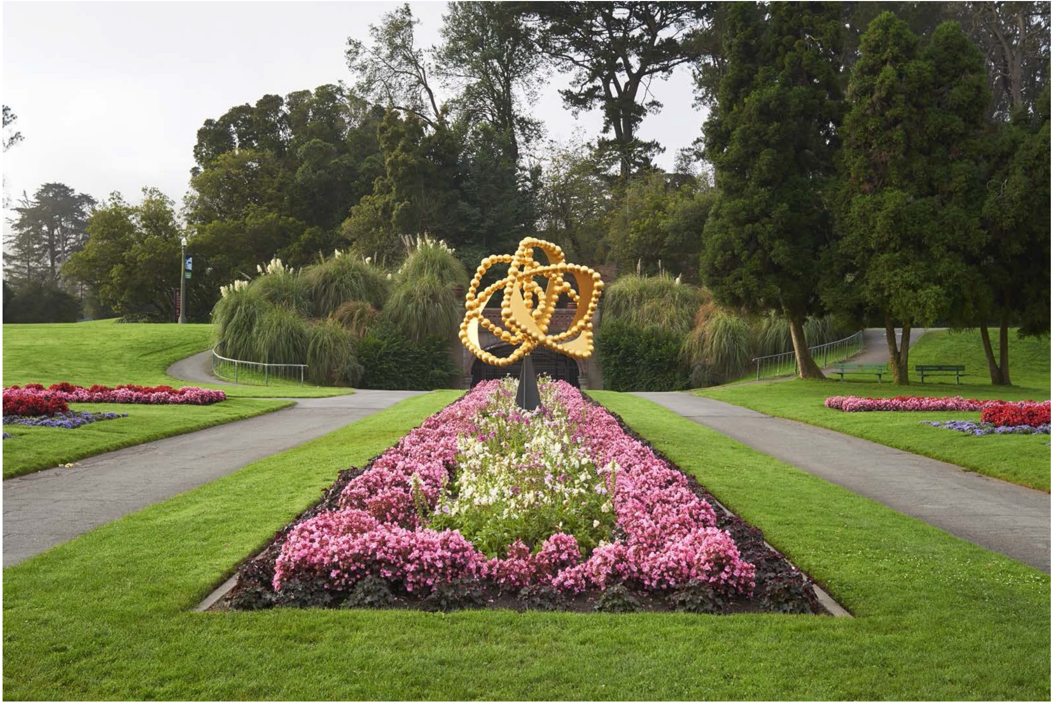
Jean-Michel Othoniel / La Rose des Vents / San Francisco 2015