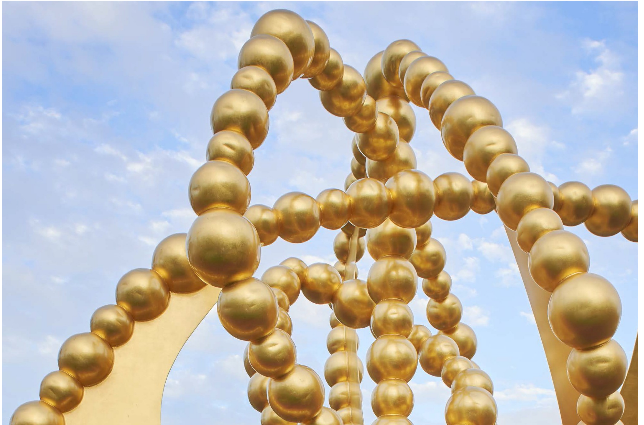
Jean-Michel Othoniel / La Rose des Vents / San Francisco 2015