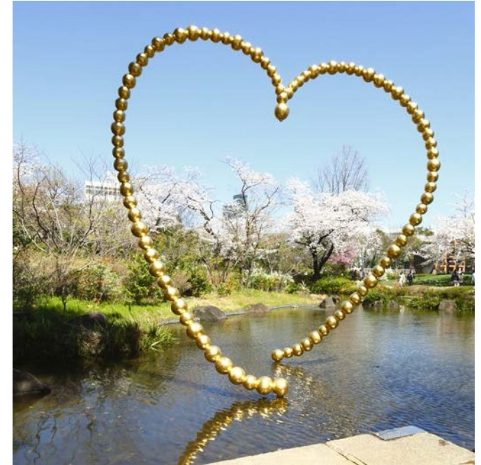
Kin No Kokoro , 2013 Mori Garden, Tokyo