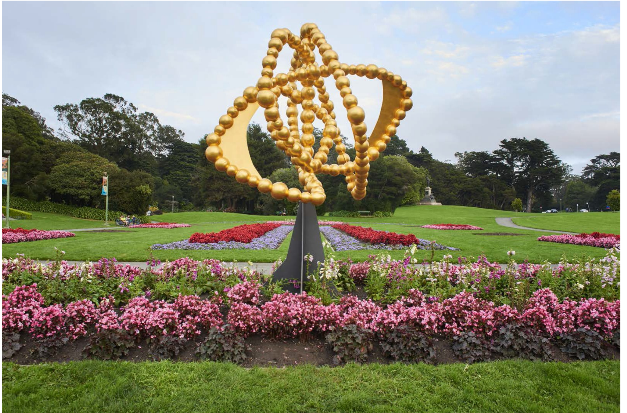
Jean-Michel Othoniel / La Rose des Vents / San Francisco 2015