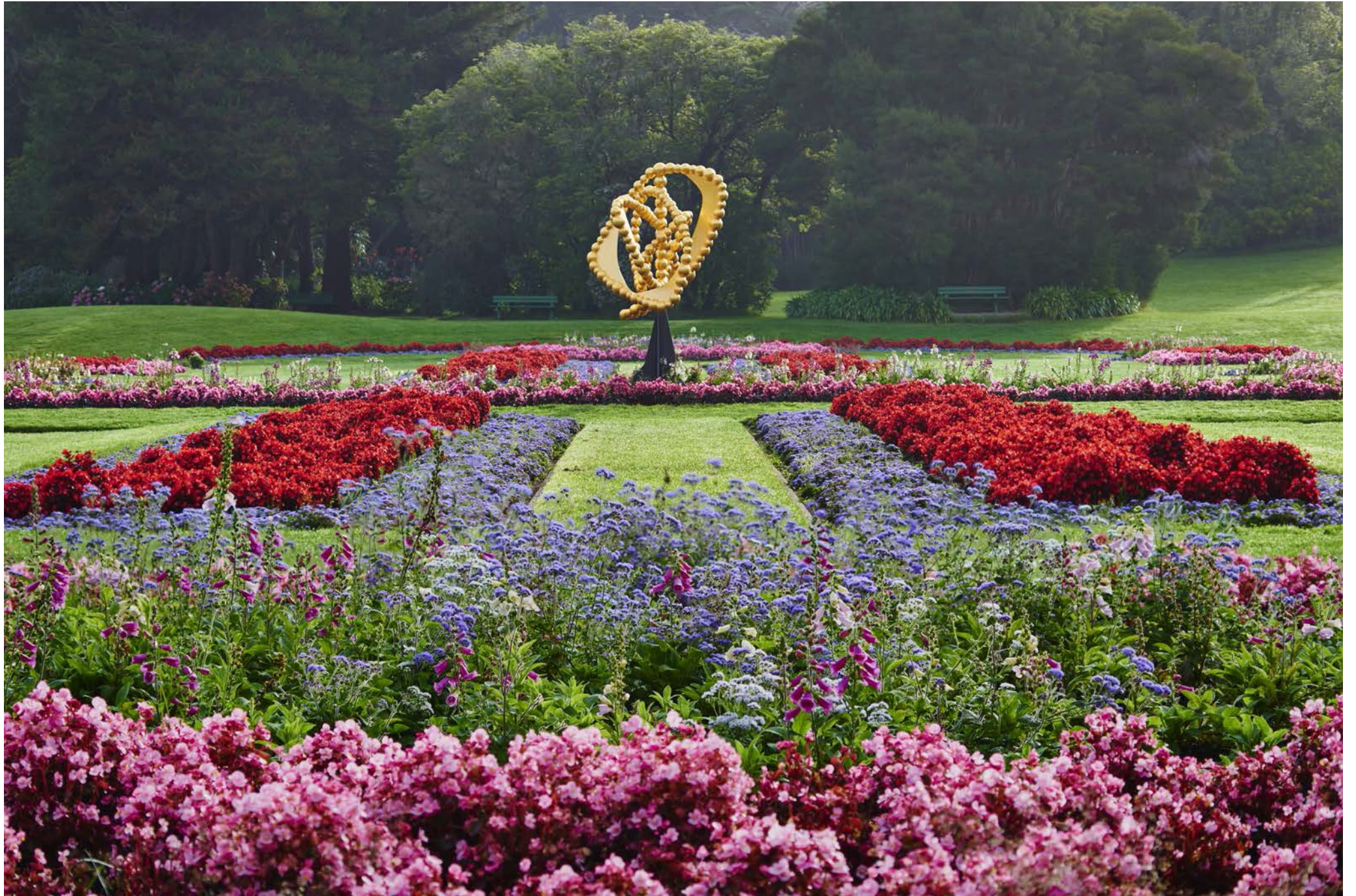
Jean-Michel Othoniel / La Rose des Vents / San Francisco 2015