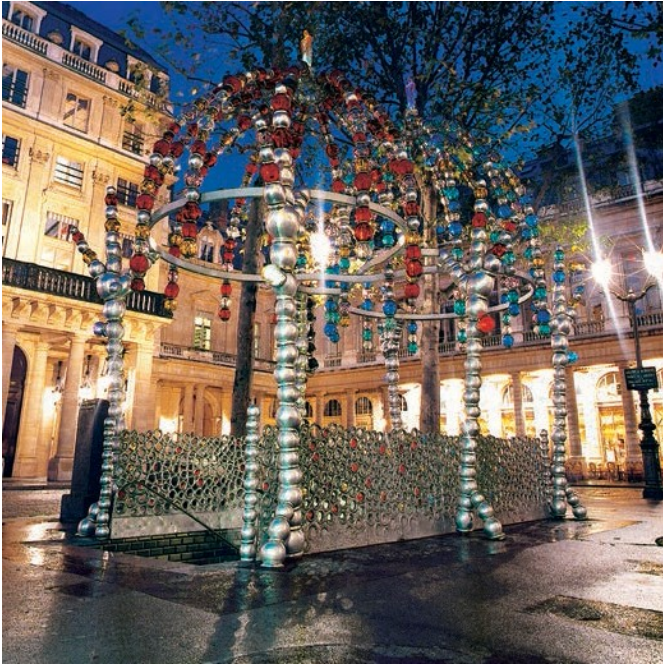
The Kiosk of the Nightwalkers , 2000 Place Colette, Paris