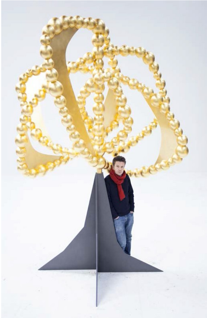
Jean-Michel Othoniel with La Rose des Vents , 2015.

Born in 1964 in Saint-Étienne. Lives and works in Paris.