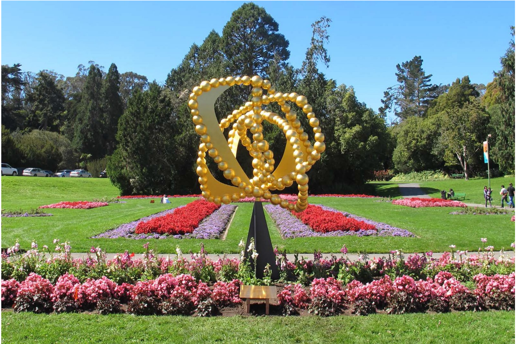
Jean-Michel Othoniel / La Rose des Vents / San Francisco 2015