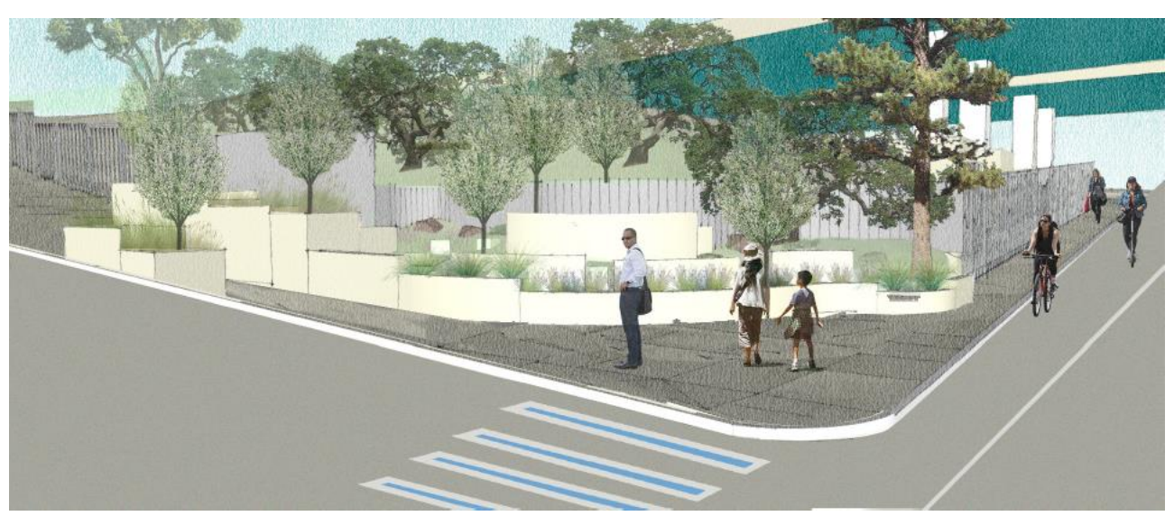
Upcoming capital improvements on Vermont Street (design in progress)