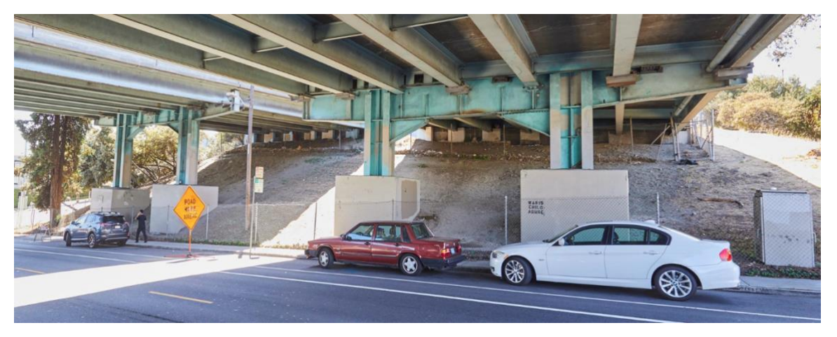
Current site condition