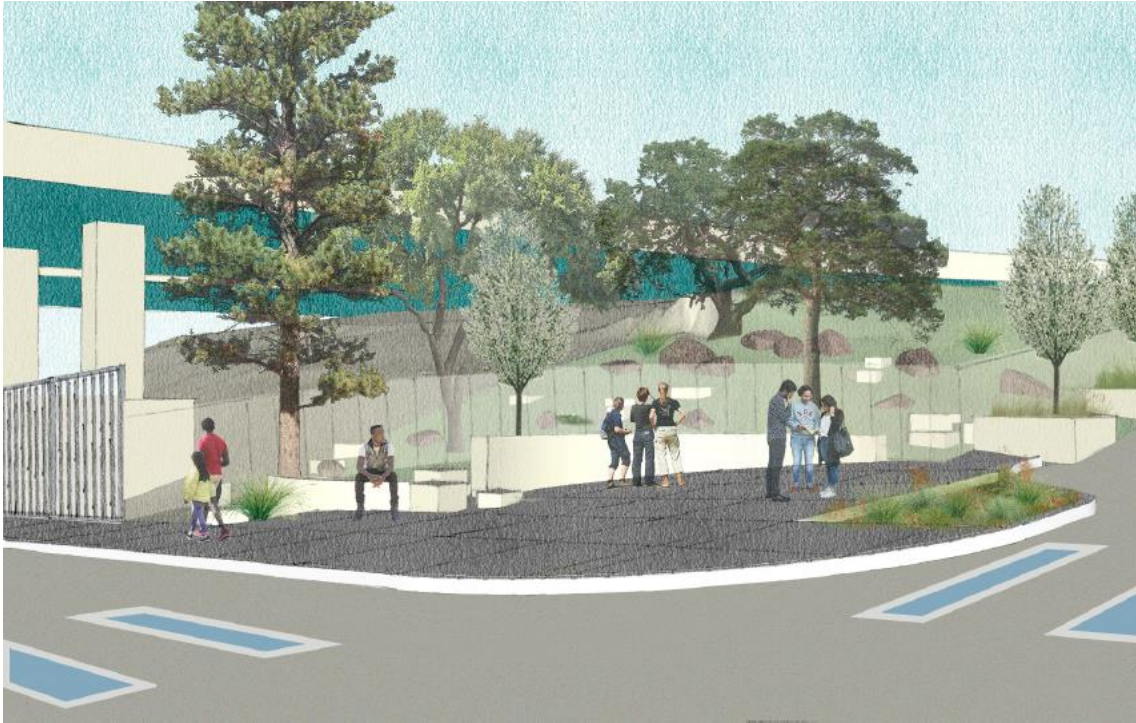
Upcoming capital improvements on San Bruno Avenue (design in progress)