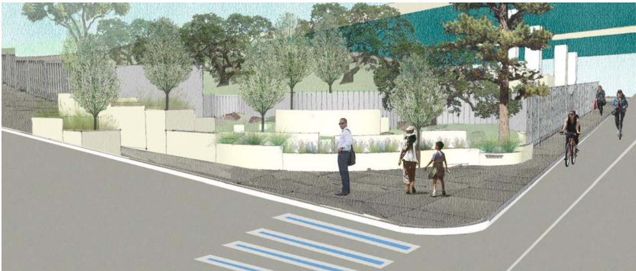
Upcoming capital improvements on Vermont Street (design in progress)