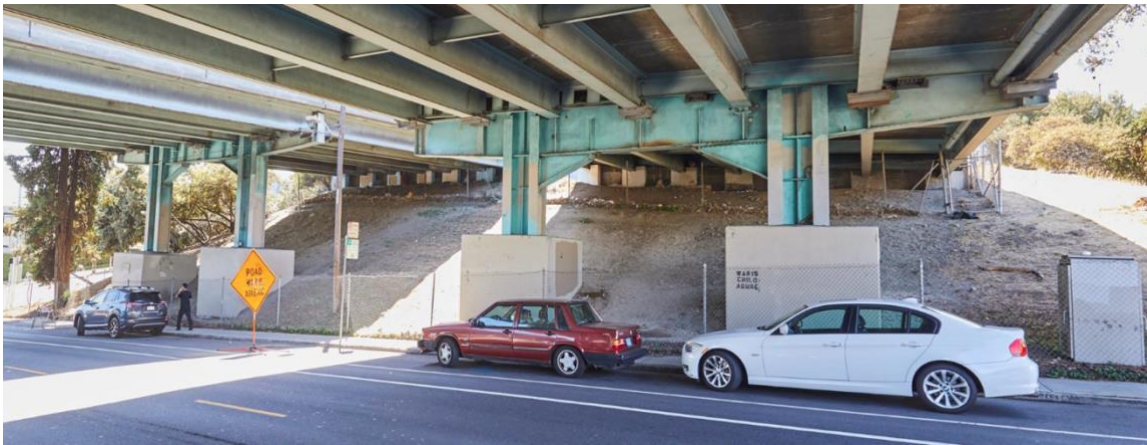
Current site condition