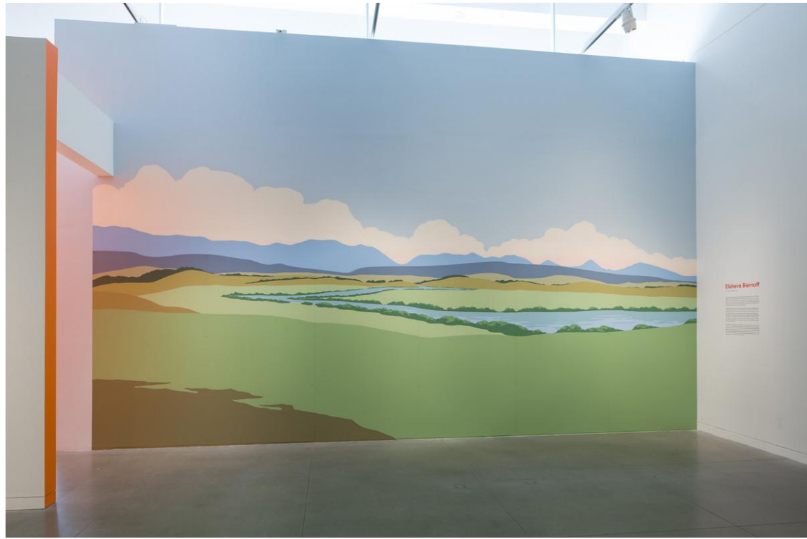
Elshava Barroff Landscape with River and Mountains