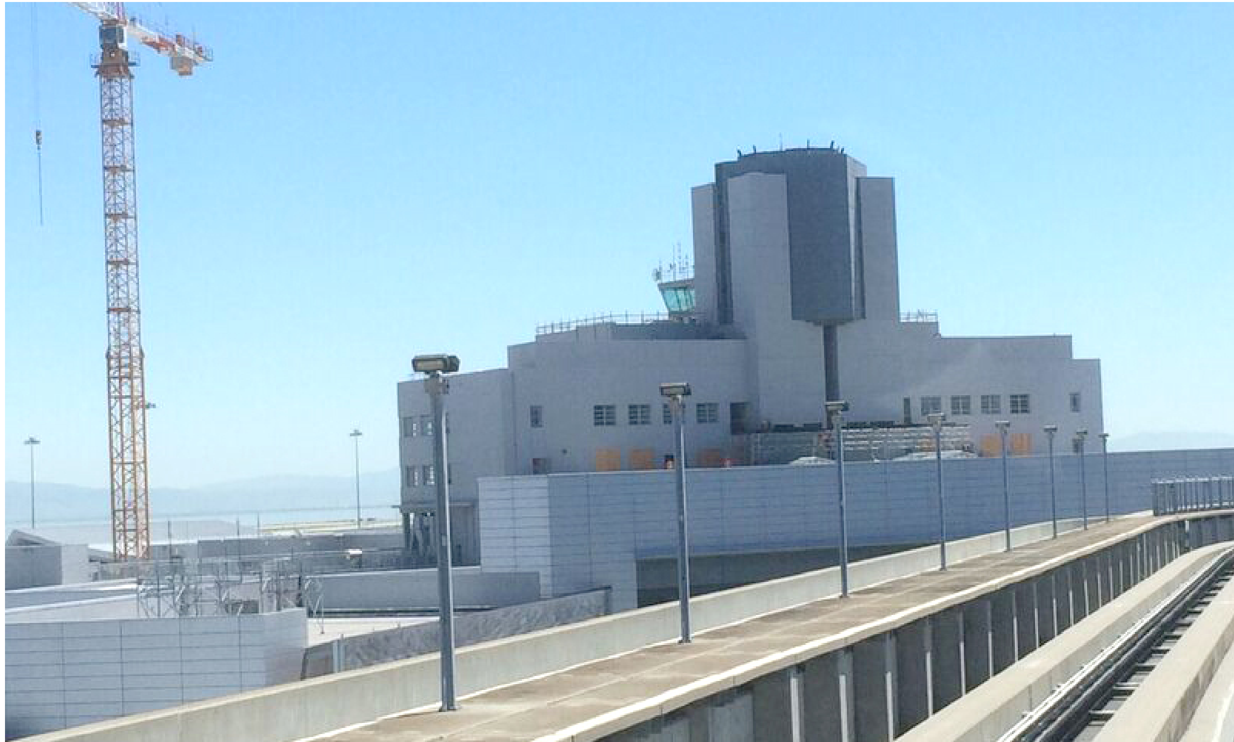
Existing Building to be Demolished