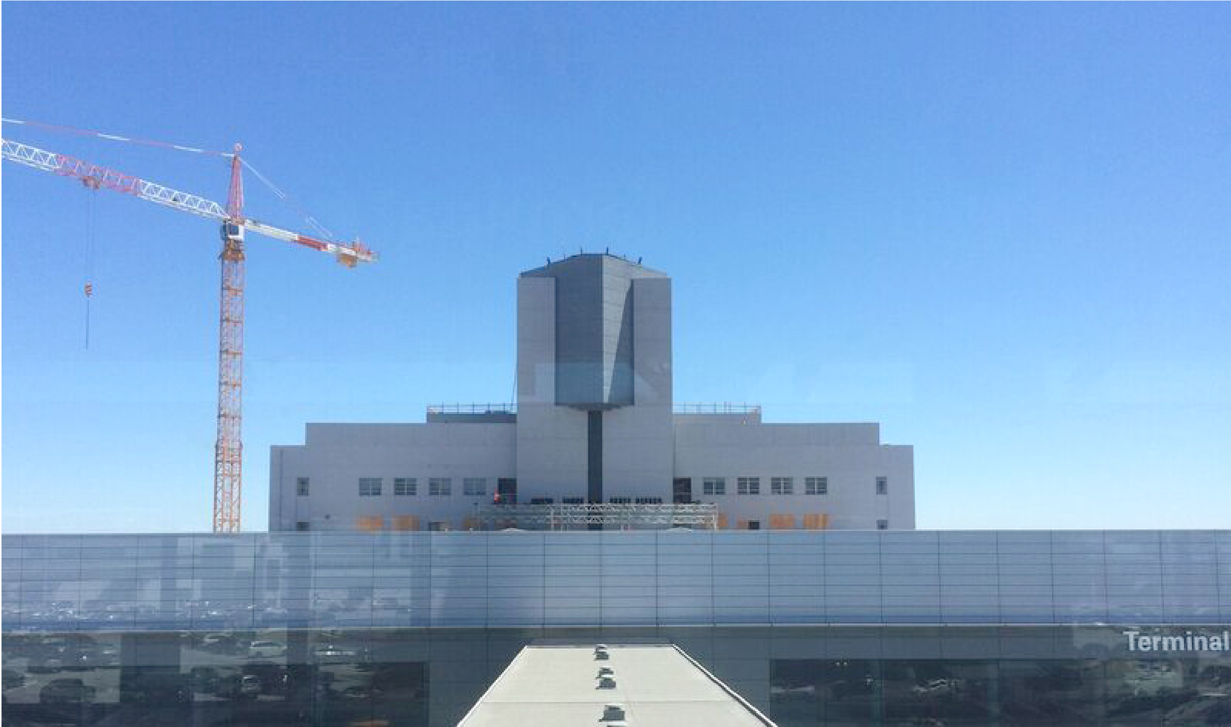
Existing Building to be Demolished