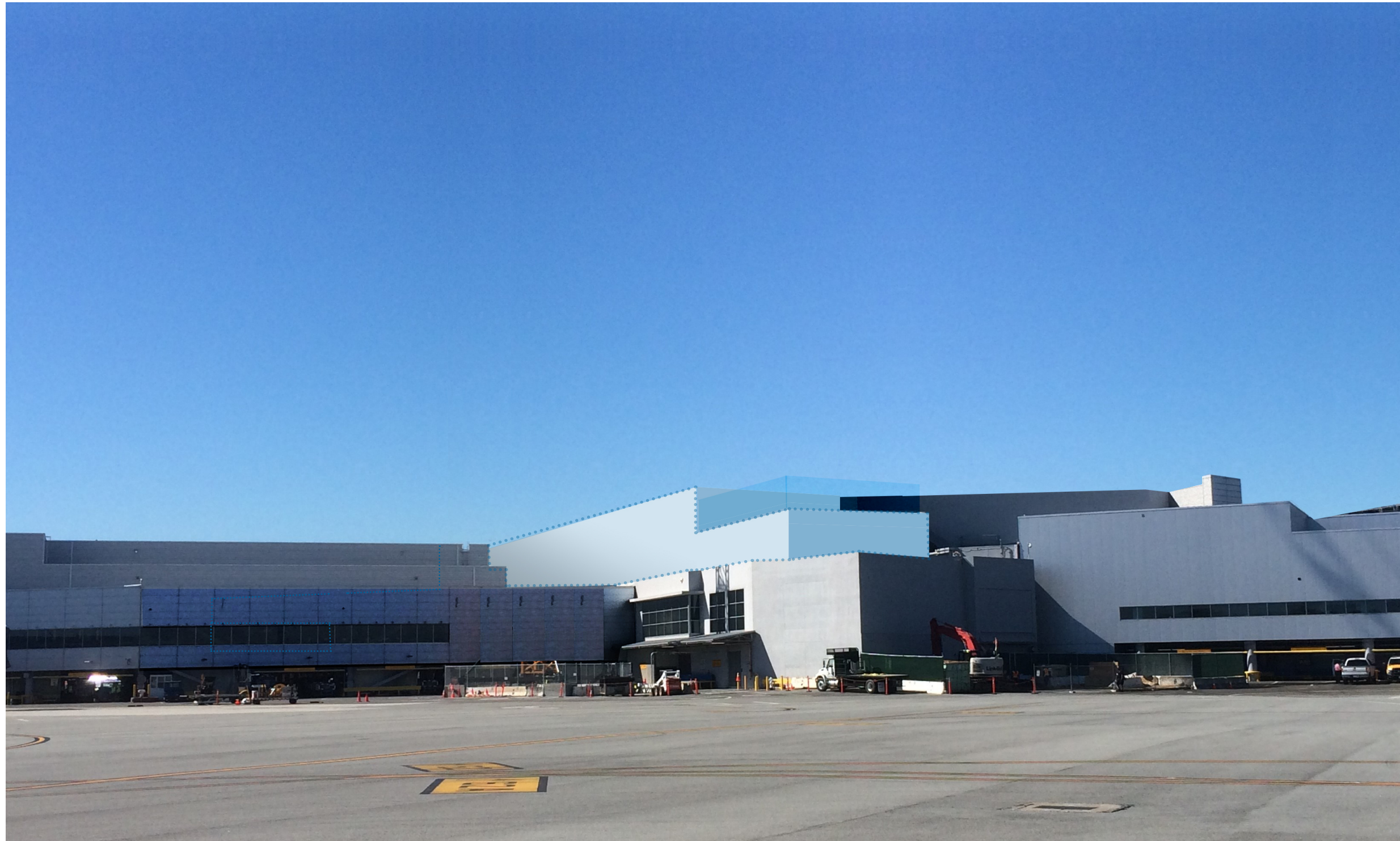
Existing Building to be Demolished