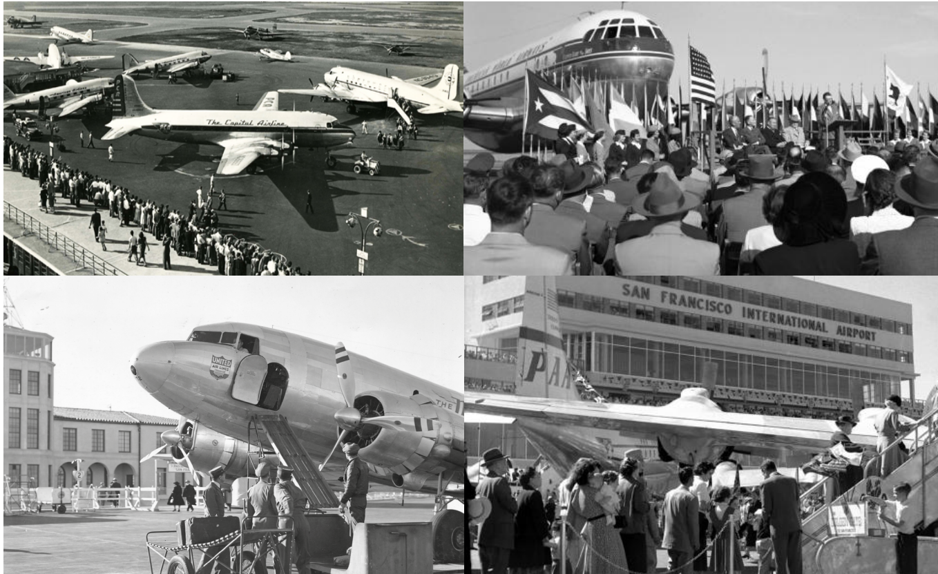
A HISTORY OF PUBLIC OBSERVATION AND ENGAGEMENT AT SFO