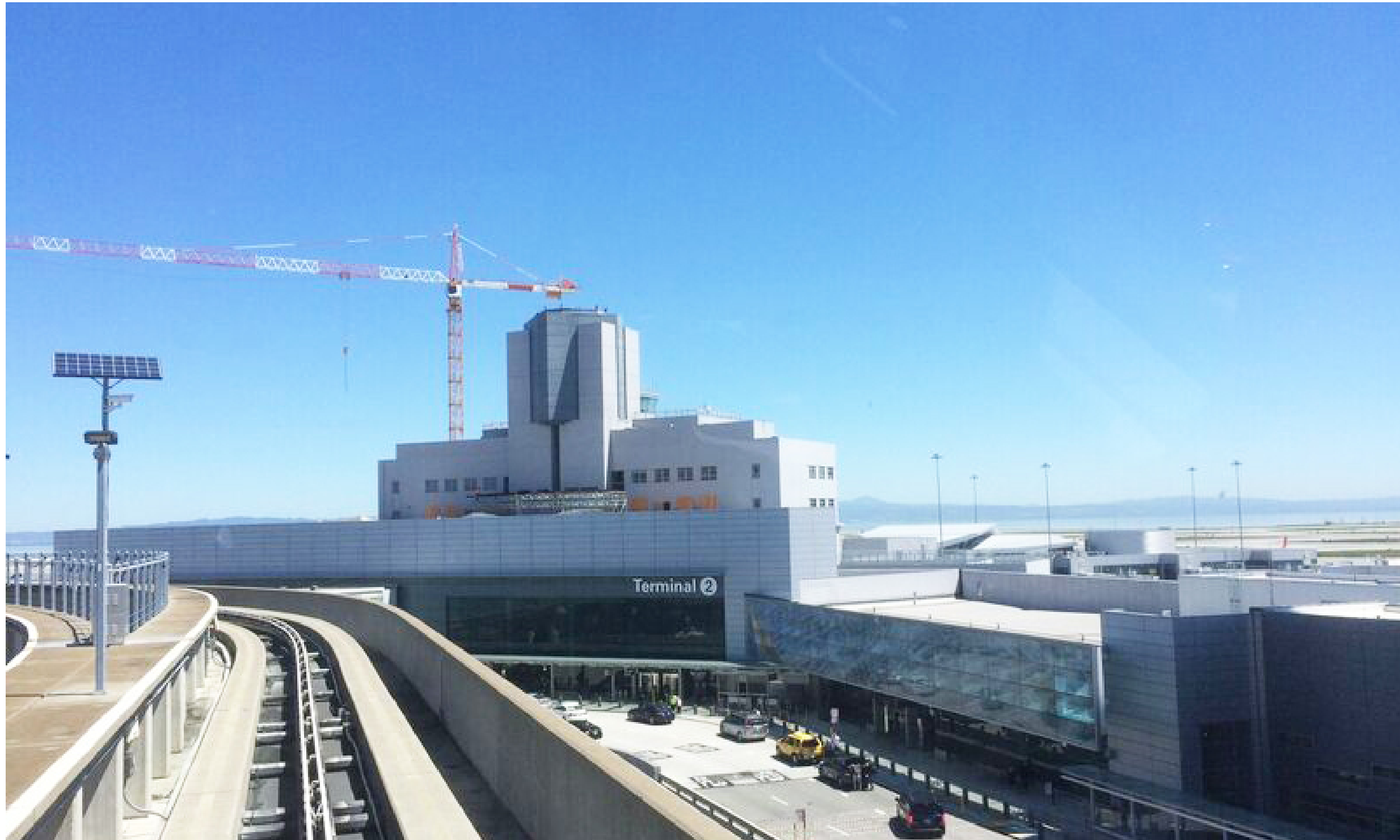
Existing Building to be Demolished