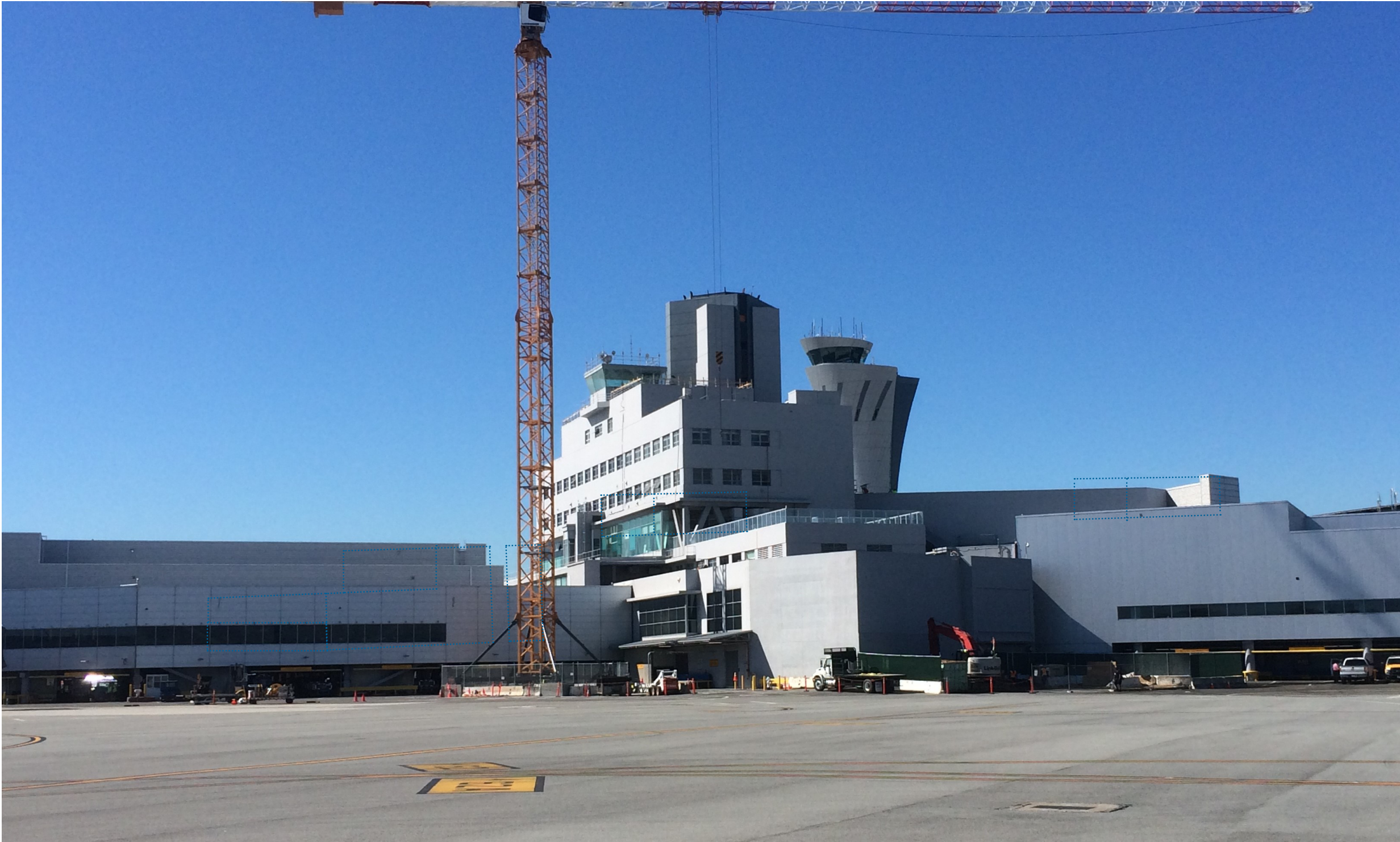
Existing Building to be Demolished