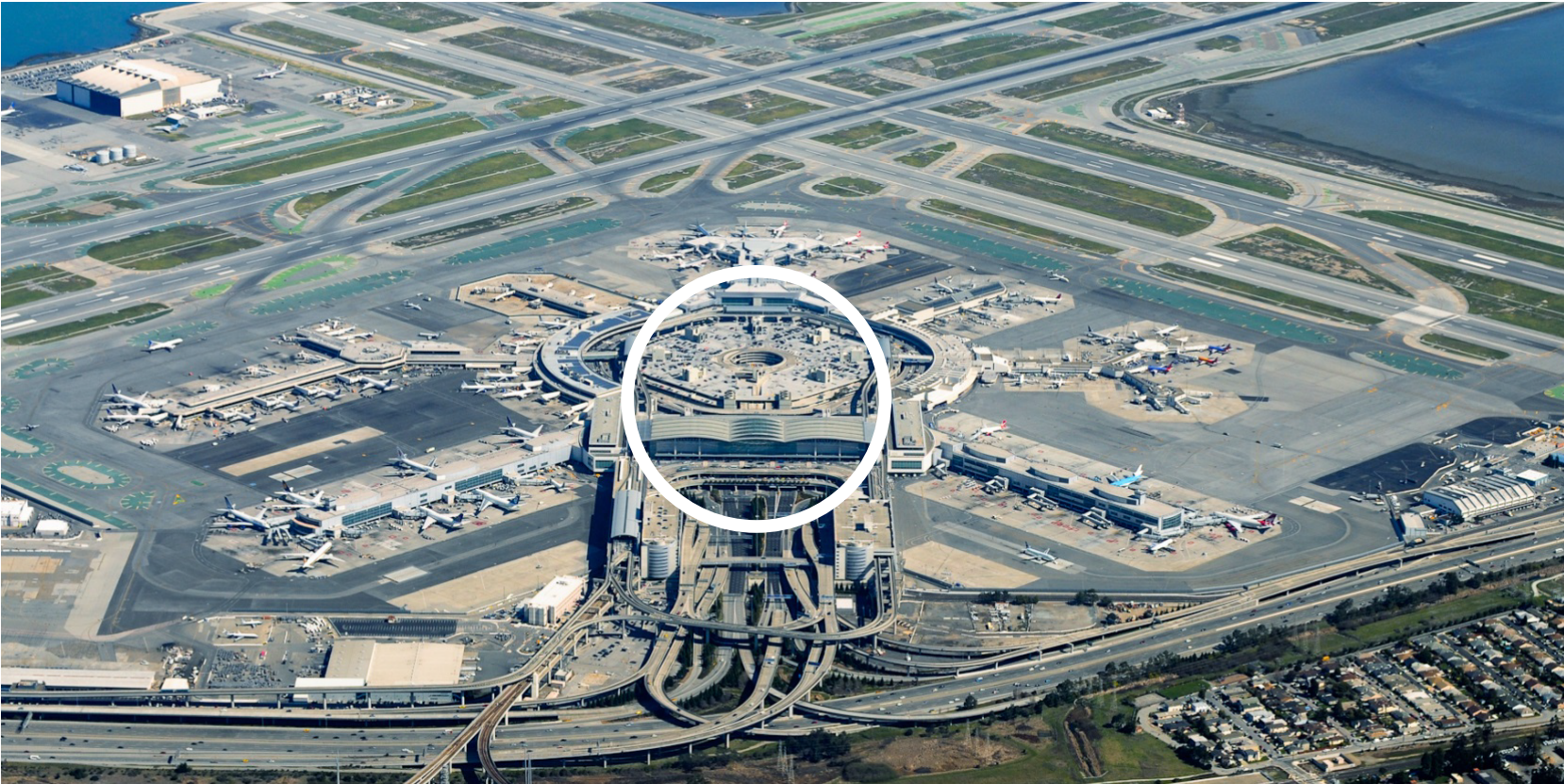
GEOGRAPHIC CENTER OF SFO