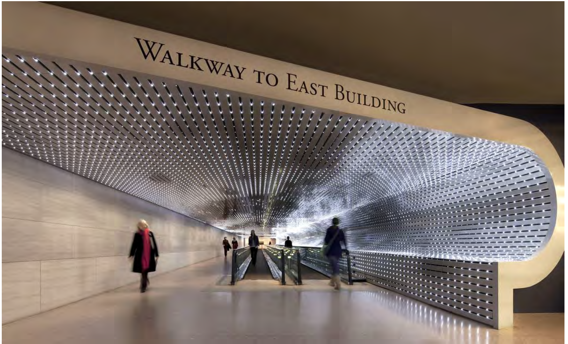
The National Gallery of Art, Washington D.C. 2008.