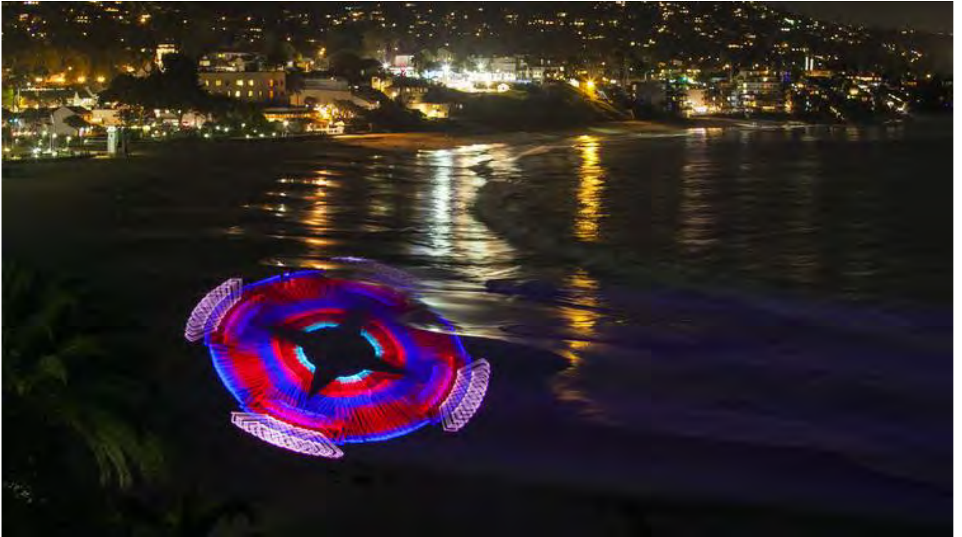
Laddie John Dill 'Electric Light Blanket' 2015. Site specific installation at the Laguna Art Museum, CA.