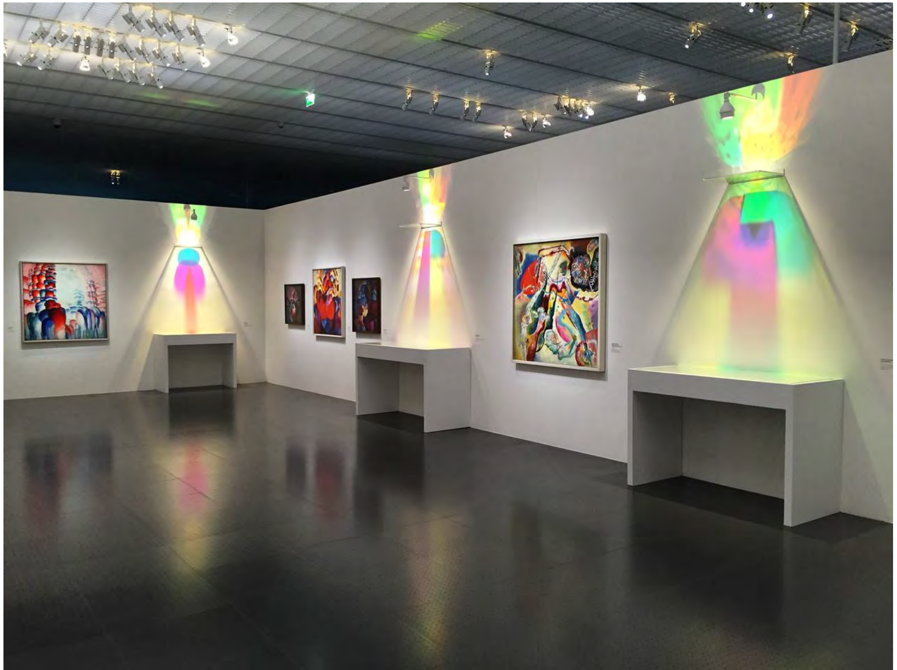
Christian Sampson 'Cosa Mentale' 2015. Site specific installation at the Centre Pompidou, Paris.