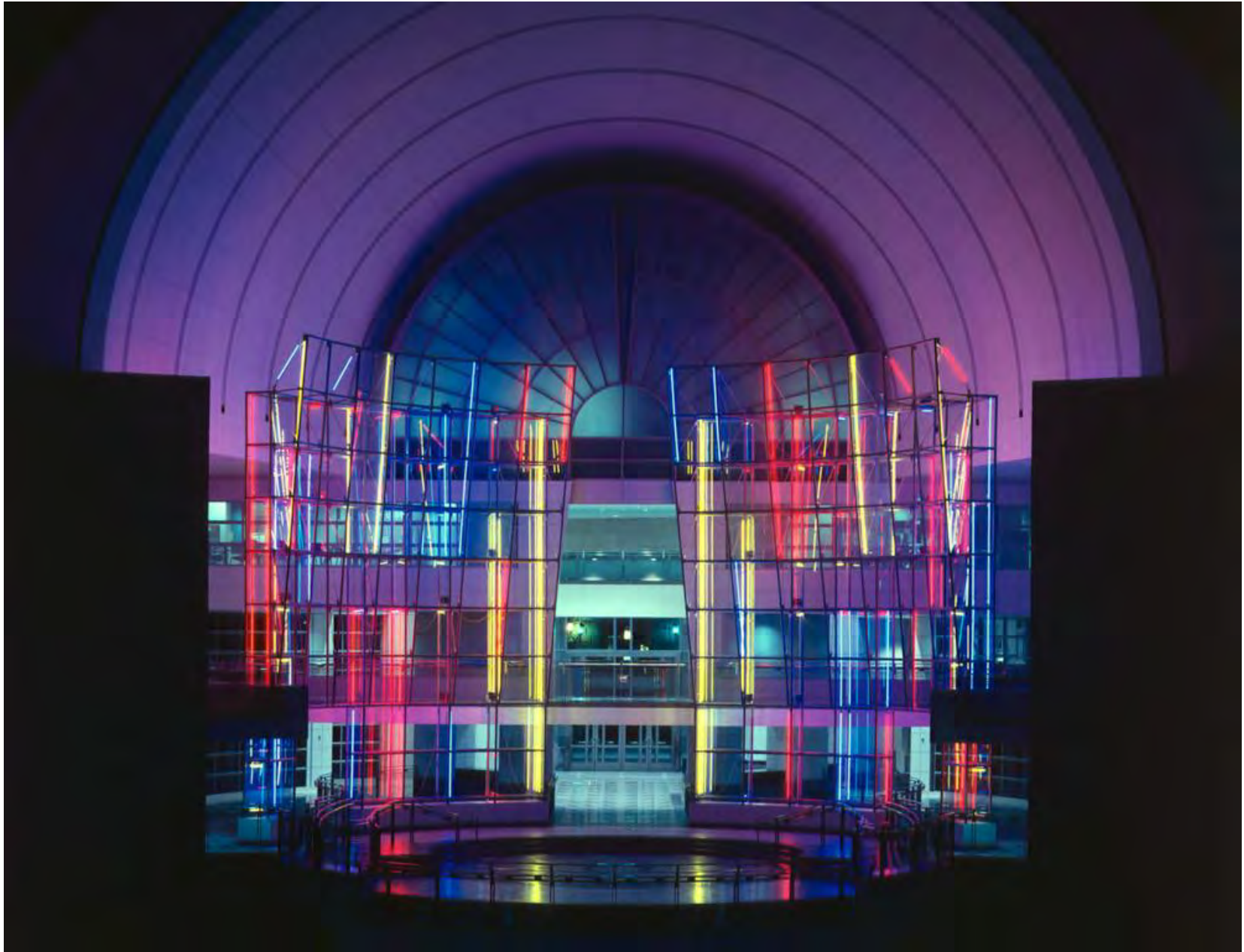
Permanent installation at the Ronald Reagan Building and International Trade Center, Washington D.C. 1998.