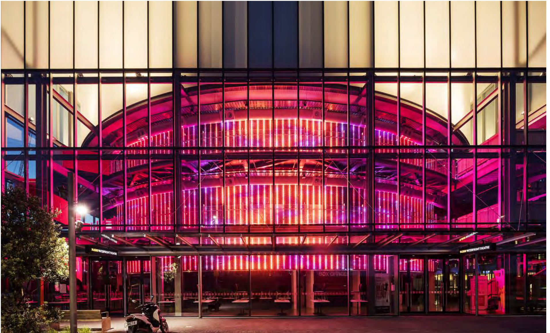
Site-specific installation for the Auckland Theatre Company, New Zealand. 2016.