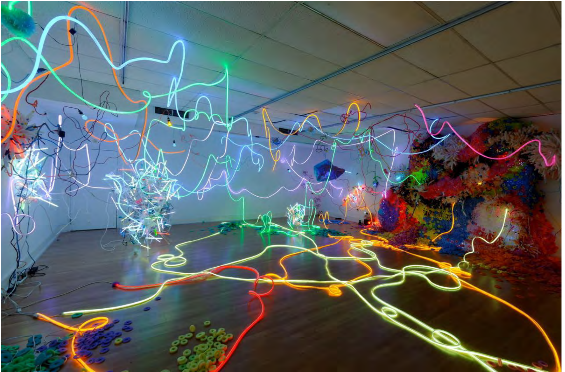
'Primordial Garden' 2012. Mixed media, LED light, CCF light, steel and plastics. 32 x 24 x 10 feet.