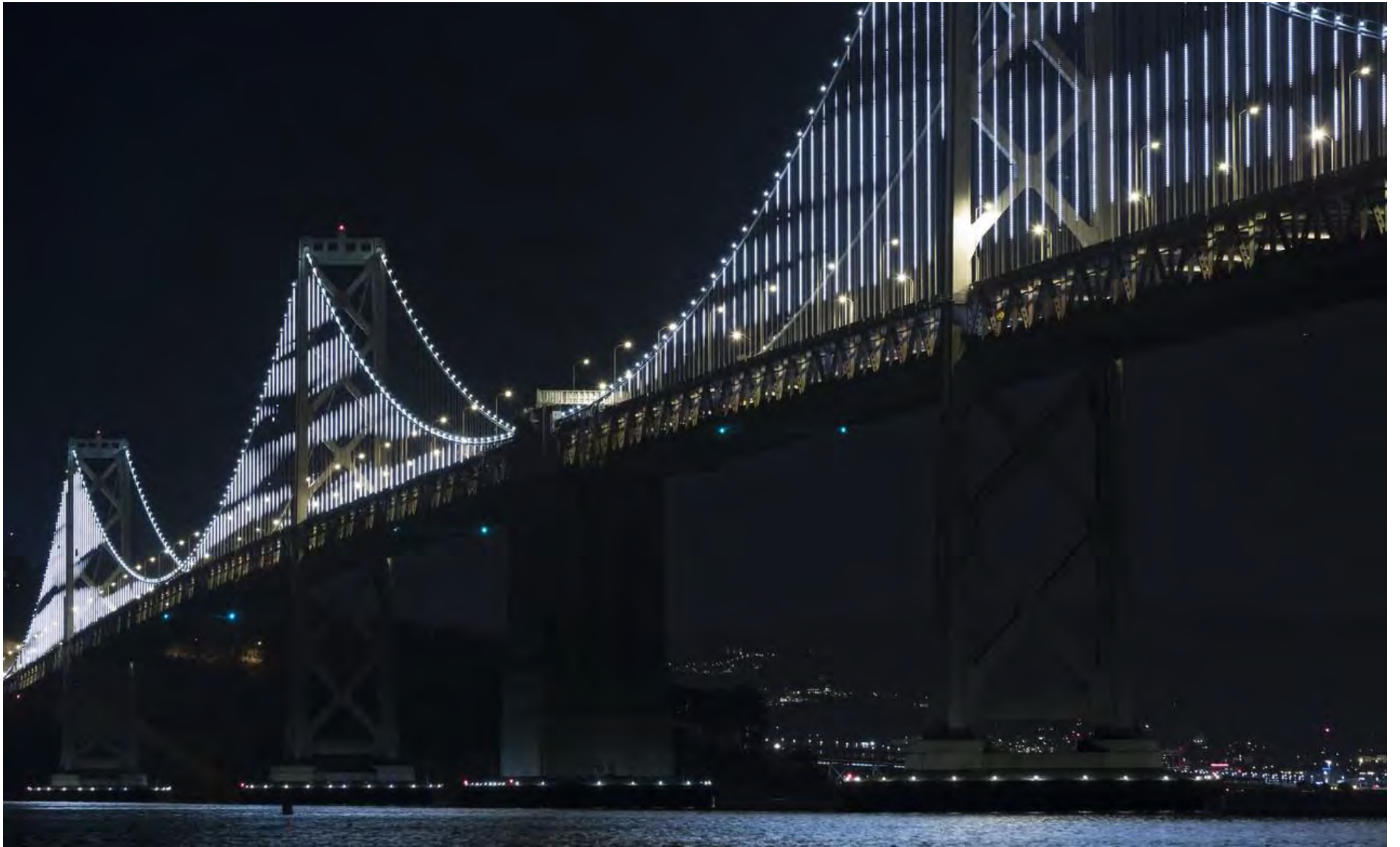
Permanent installation on the San Francisco – Oakland Bay Bridge, CA. 2013.