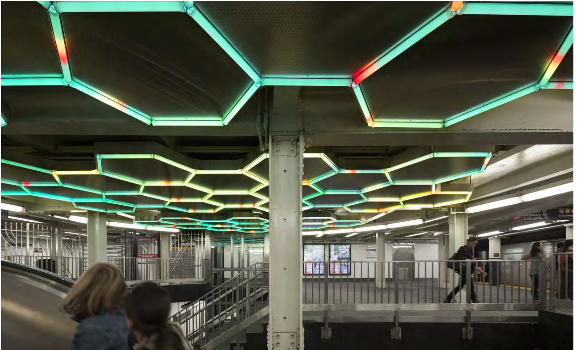
Bleeker Street Subway Station, New York, NY. 2012.