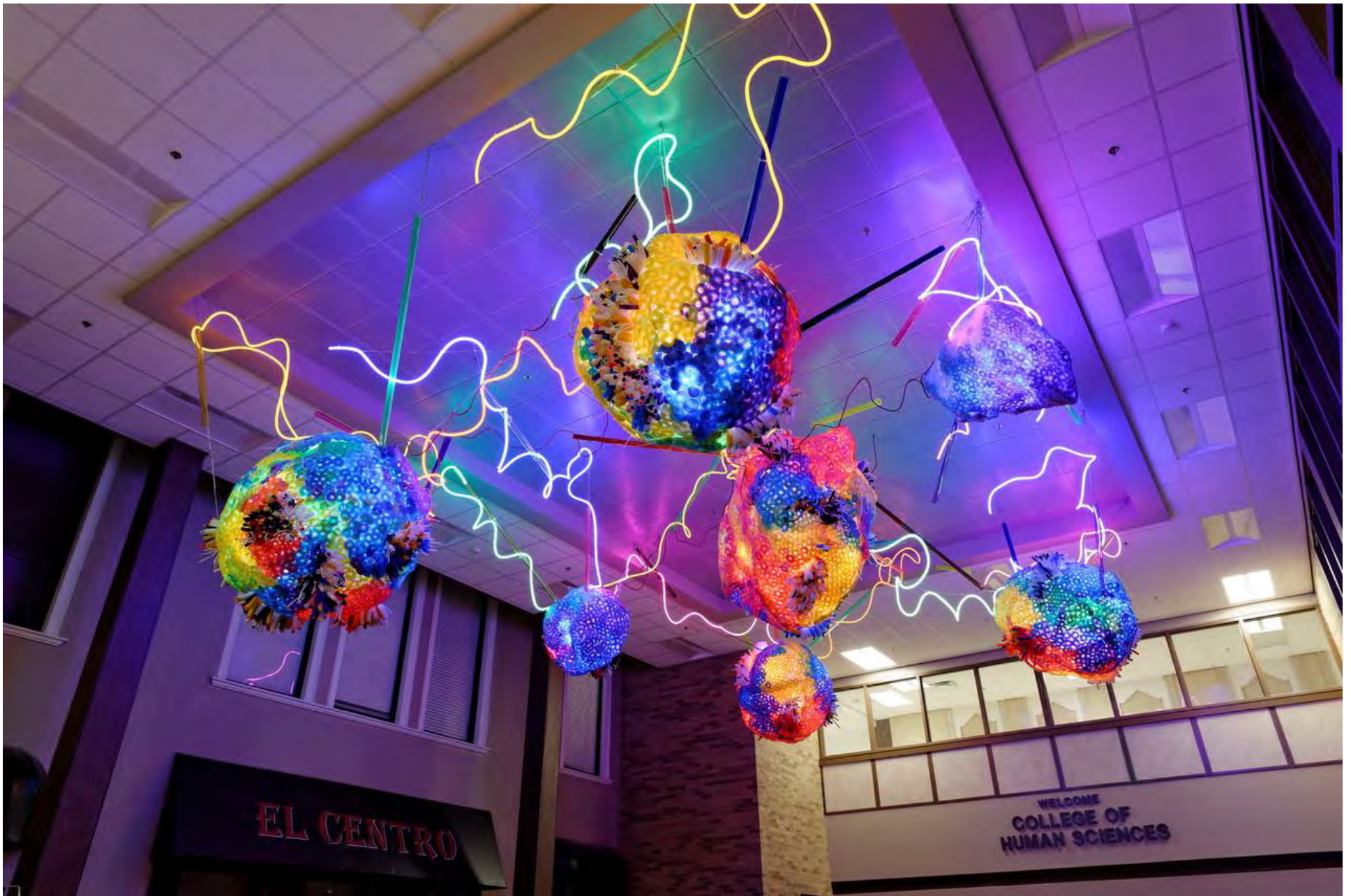
'Primordial Garden' 2016. Mixed media, LED light, steel and plastics. 32 x 22 x 22 feet.