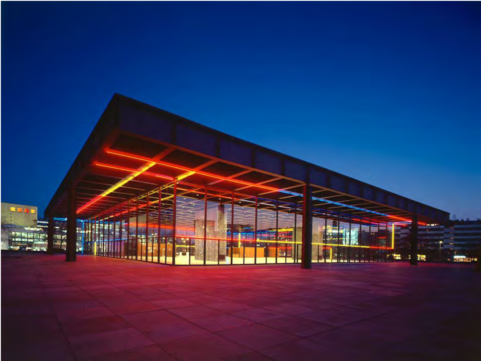
Site-specific installation at Neue Nationalgalerie, Berlin. 2002.