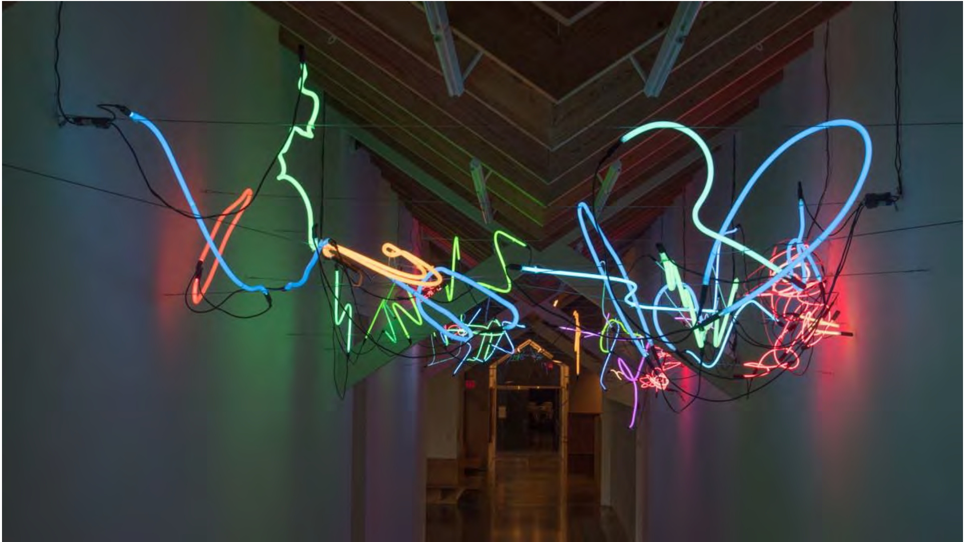
'Until Today' at The Parrish Art Museum, 2018.