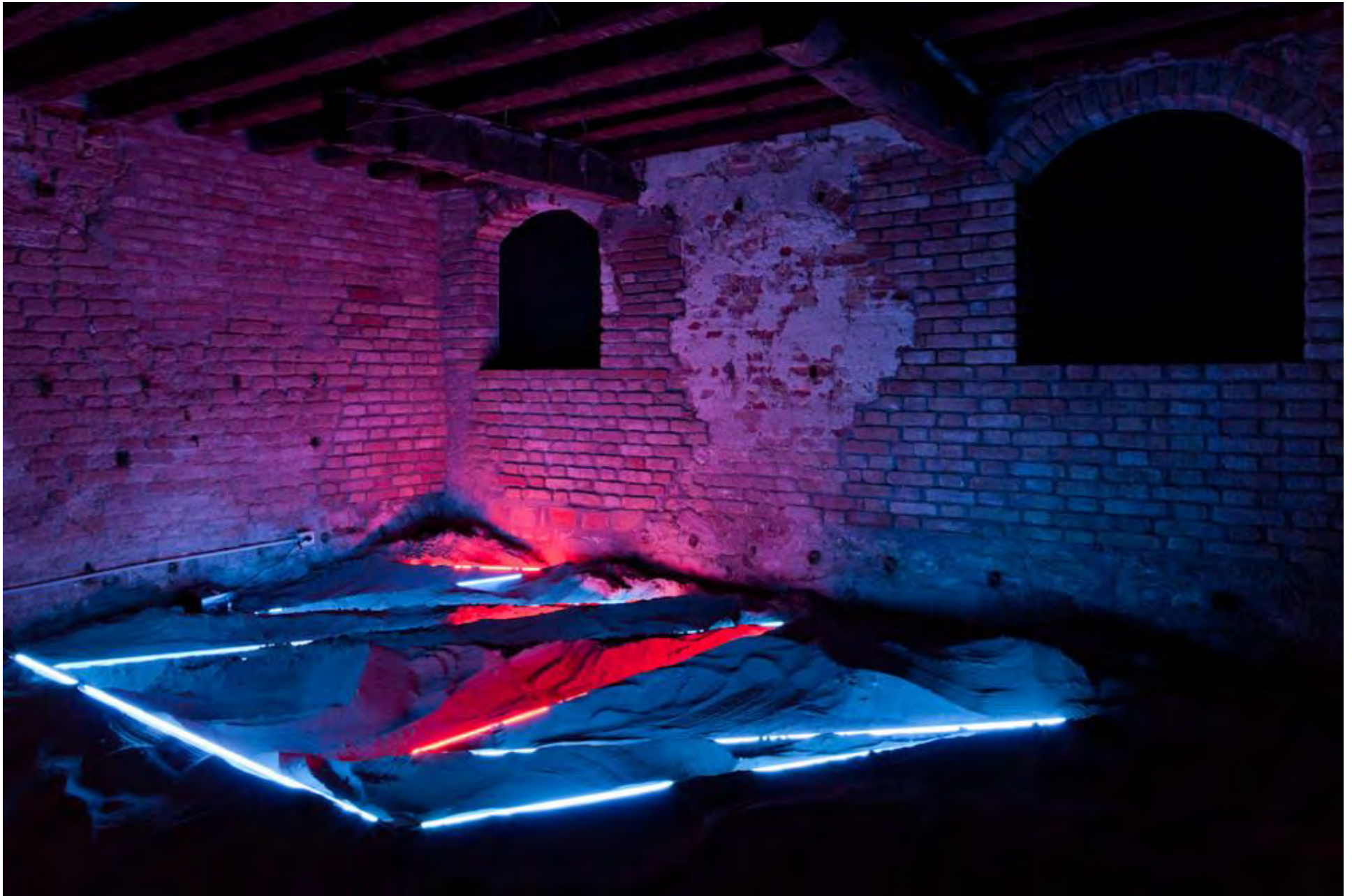
Laddie John Dill 'Antiquitas in Luce' 2017. Site specific installation at The National Archaeological Museum of Naples, Italy.