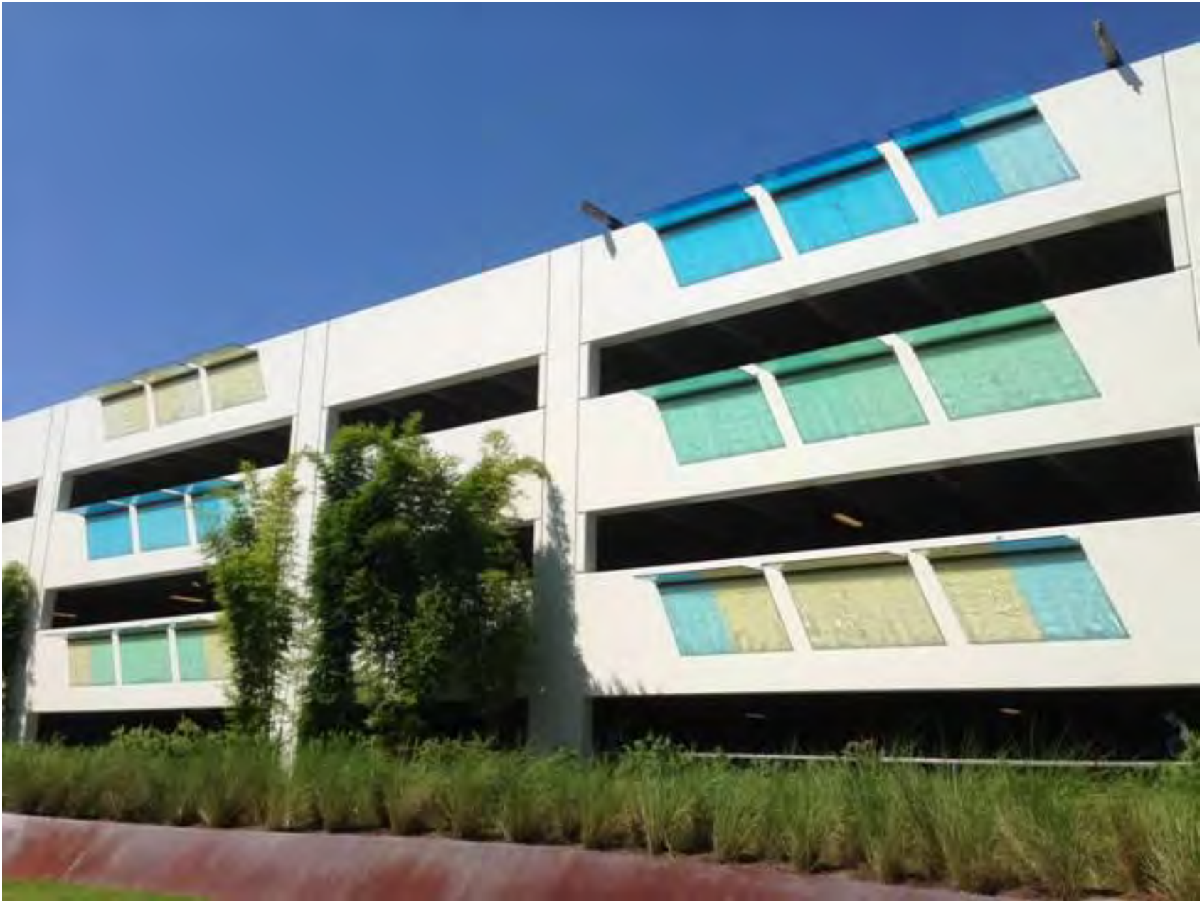
Christian Sampson 'Solar Project 1' 2013. Laminated sheetglass and steel. 30 x 40 feet.