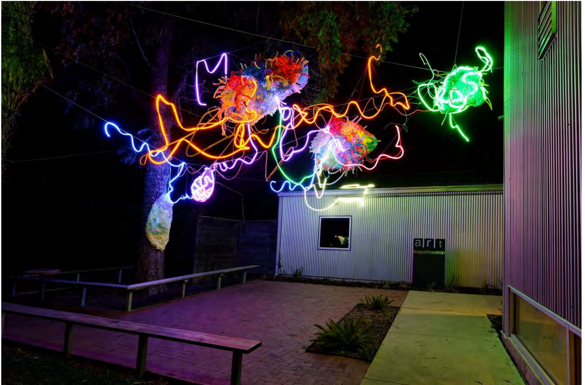
'Primordial Garden' 2012. Mixed media, LED light, steel and plastics. 24 x 24 x 20 feet.