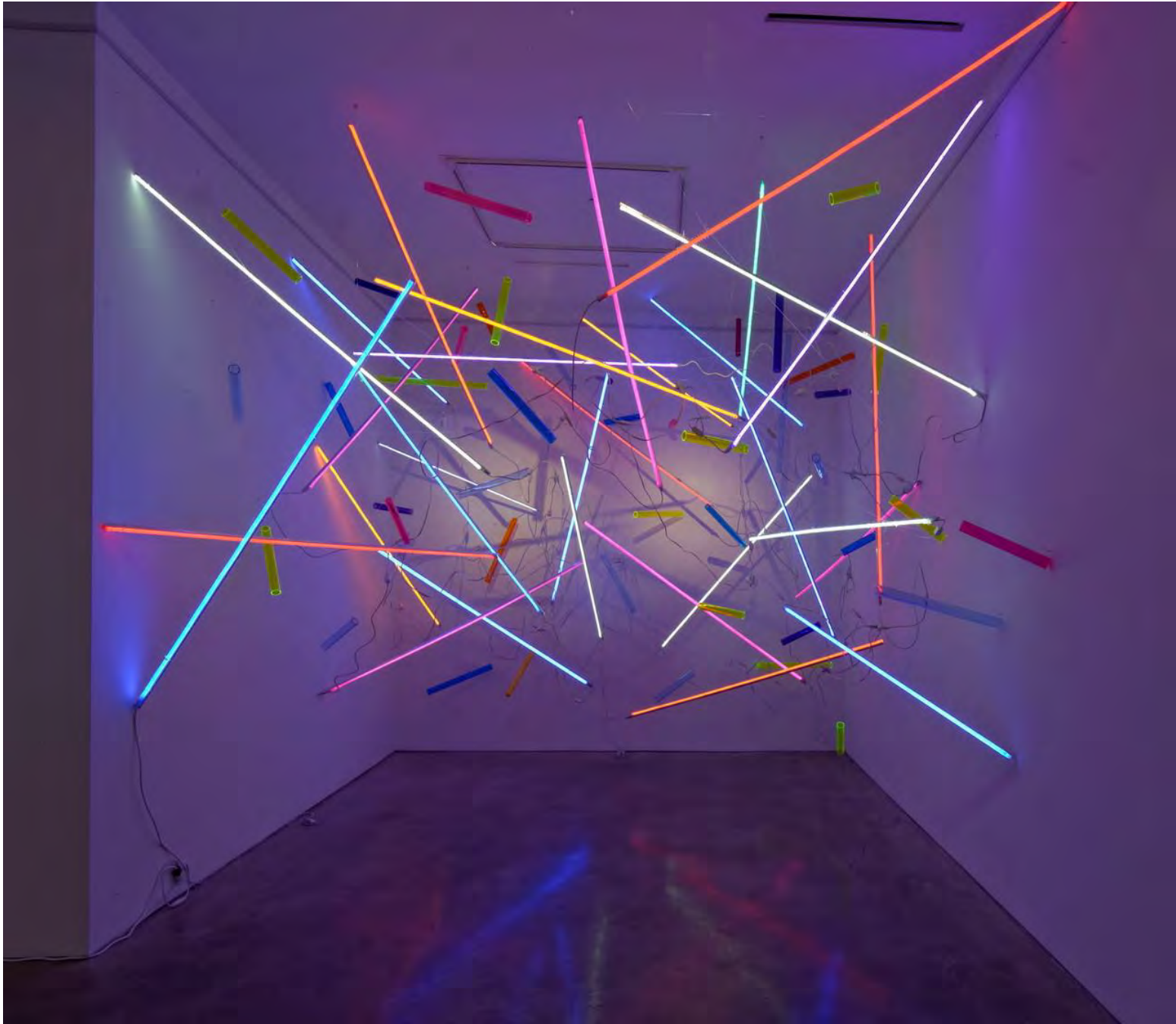
'Impervious Geometry' 2013. Mixed media, LED light and aluminum. 16 x 14 x 12 feet.