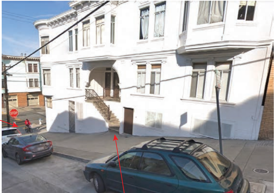
Entrance to 1952 Taylor Street