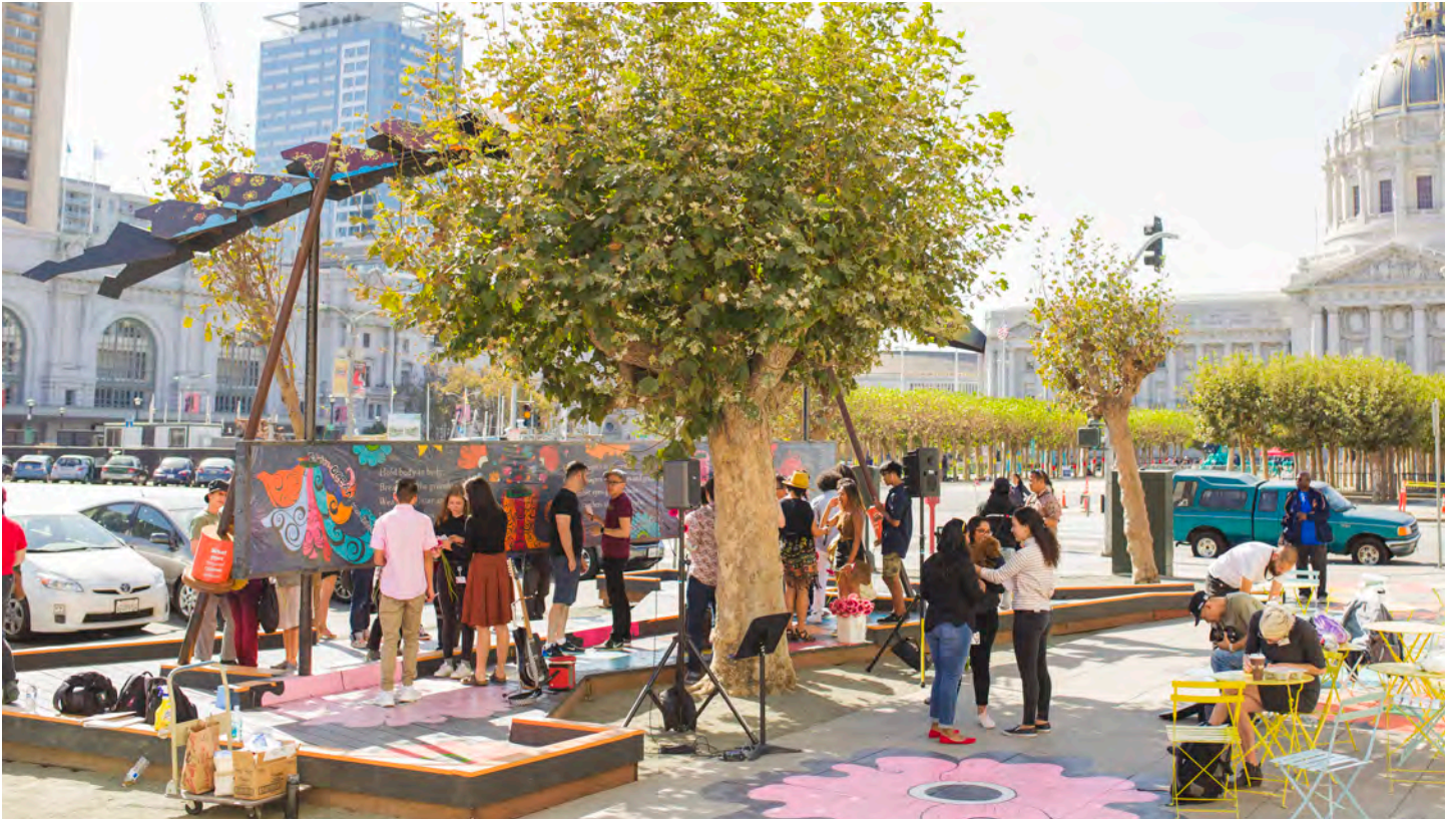
Images of completed project: an interactive installation that serves as a hub for free programming and public art on Fulton Street at Larkin, adjacent to the Asian Art Museum. Project opened in May 2017.