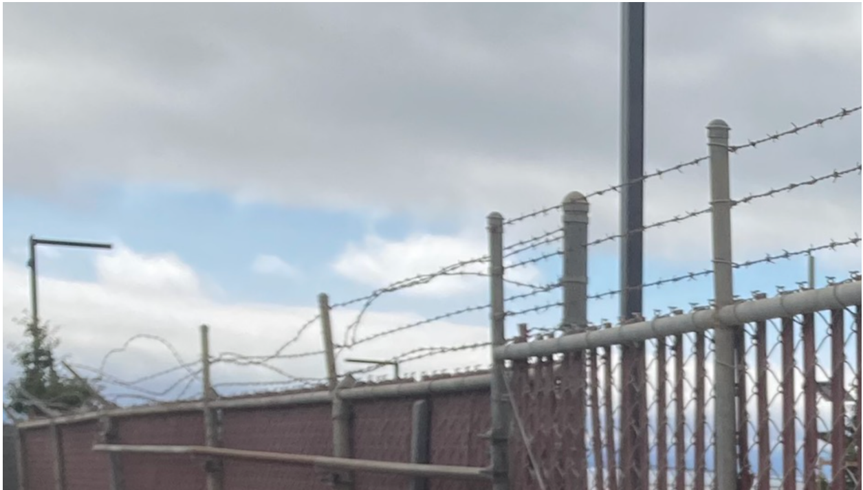
Part of photo taken from inside the lot during walkthrough on 7/2/21.

The fencing is a variable mix of chain-link, slats, and metal bars. Looks like there is also some barbed wire along at least part of the fence.