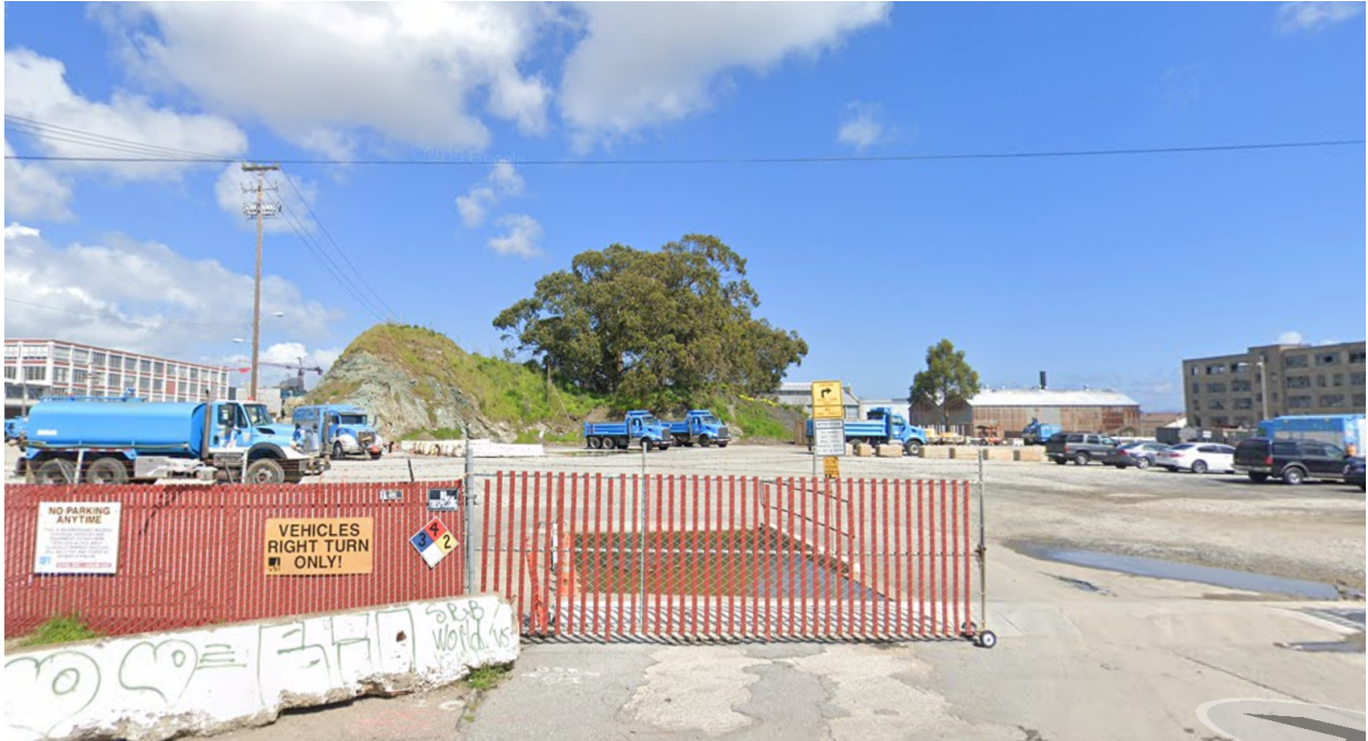
Image screenshot from GoogleMaps street view, 7/2/21

The fencing is a variable mix of chain-link, slats, and metal bars. Looks like there is also some barbed wire along at least part of the fence.