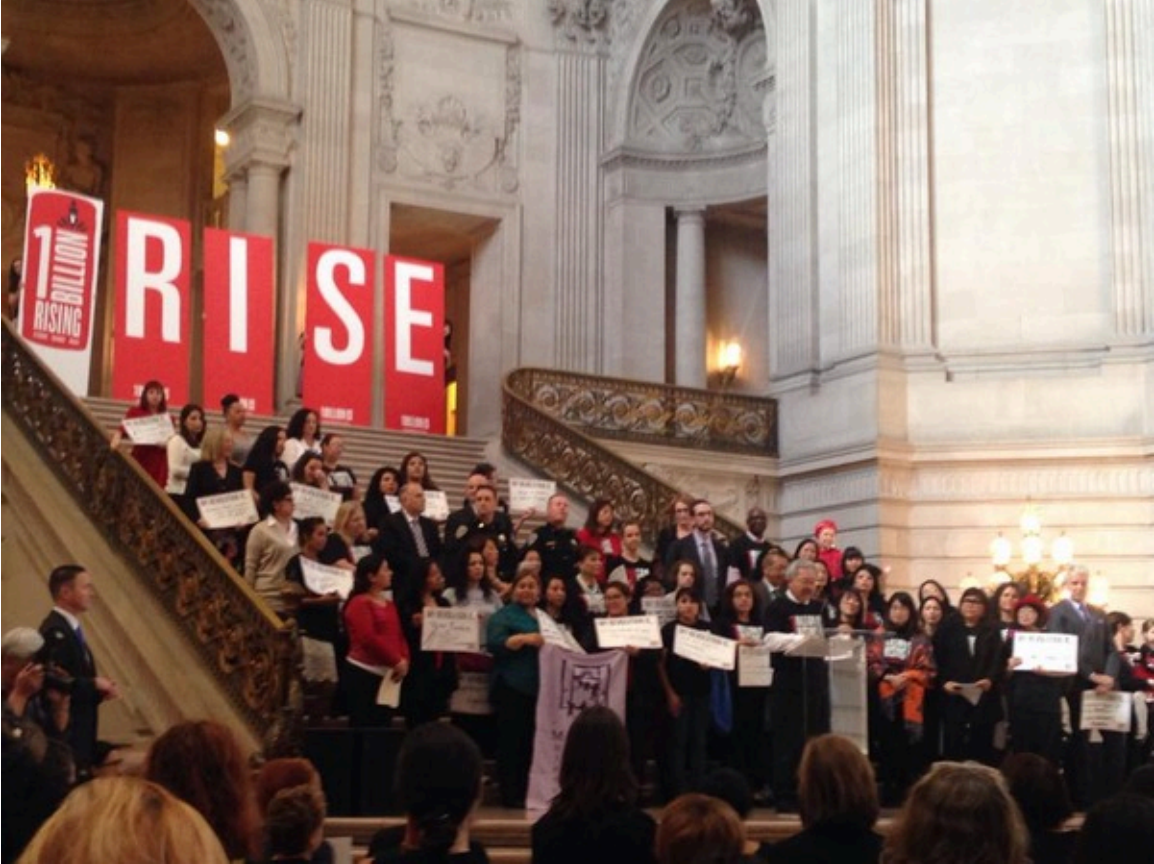
Mayor addressing community advocates on February 12, 2015