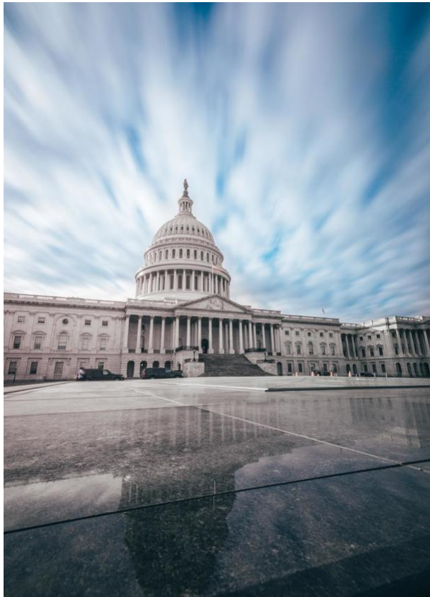
US Capitol.