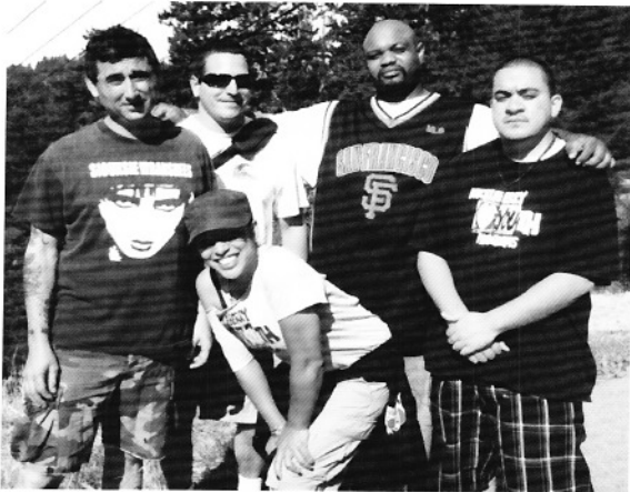
Members of the Huckleberry Community Assessment & Resource Center (CARC) Staff

The Huckleberry Community Assessment & Resource Center (CARC) is a San Francisco program for youth, ages 11-17, who are arrested for misdemeanors or certain felonies. With a focus on positive youth development, CARC helps youth avoid detention and further involvement in the juvenile justice system. Thirty percent of all arrested youth in San Francisco are served by CARC. SF Police General Orders state that CARC must be contacted for all juvenile arrest cases.