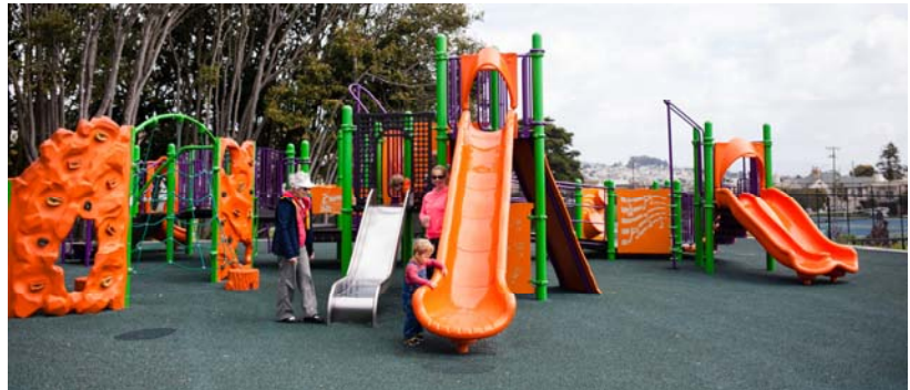
COMPOSITE PLAY STRUCTURE

The purpose for this checklist is to be transparent and predictable during the plan review and field inspection of all publicly funded playground projects. These projects are reviewed for quality control and assurance by the Mayor's Office on Disability, the Department of Public Works, the San Francisco PORT and others, in order to achieve compliance with the 2010 American's with Disabilities Act Accessibility Standards (2010 ADAS) . Play equipment requirements from the 2010 ADAS have also been incorporated into Section 11B-240 of the 2013 California (2013 CBC) and San Francisco Building Code which went into effect on January 1, 2014.