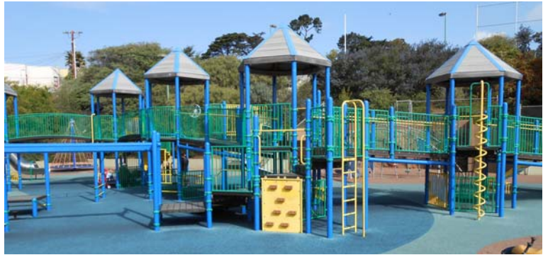
St. Mary's Recreation Center Playground

Upon request, MOD or DPW's ADA Coordinators are available to provide assistance in filling out and completing these applications.