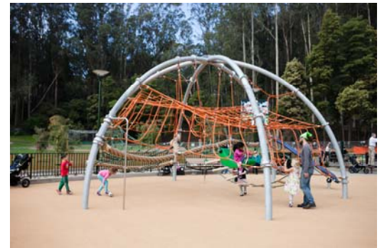
Composite structure with many ground level play components

Accessible Playgrounds are designed and built to provide the maximum integration of children with disabilities, so they can engage in creative and inclusive play activity with their companions and parents, including those who may also have disabilities.