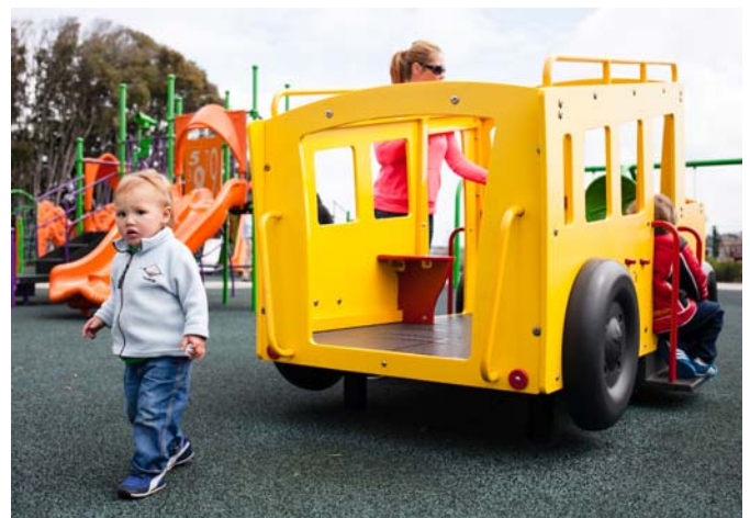
Transfer Tier on Back of Play Truck