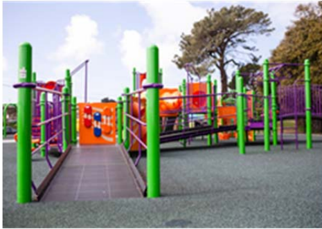
Ramp providing access into a composite play structure