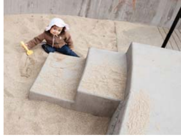
Transfer tier into sand pit