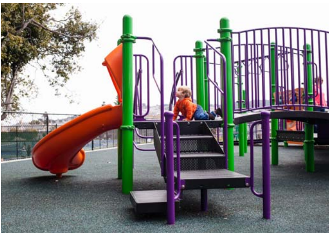
Standard Transfer Tier