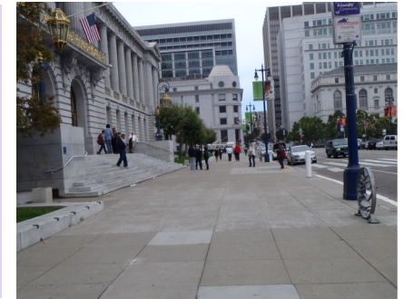
Picture looking from the front of the property.