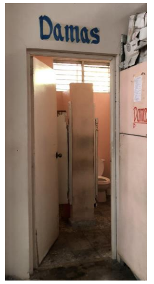
Figure 7: Insufficient Women's Toilets

Moreover, while on the day of the WRC's inspection of the factory the toilets were adequately stocked and maintained, some employees interviewed by the WRC reported that the restrooms are frequently unclean and lacking soap or paper towels.