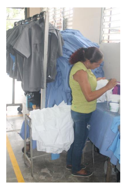
Figure 2: Standing Work on Bare Concrete Floor

• Provide all employees who work in a seated position for extended periods of time with ergonomic seating, specifically, chairs that are