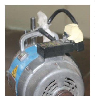
Figure 5: Spliced and Inadequately Protected Wiring on Cutting Equipment

The WRC recommends that SMC take the following measures to remedy and prevent violations of Dominican labor law and the Ordinance with respect to electrical hazards: