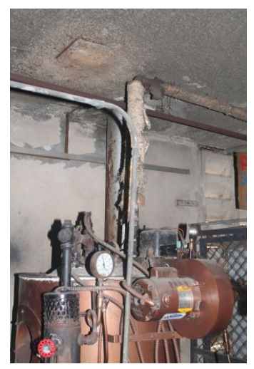
Figure 6: Boiler with Possible Asbestos-bearing Insulation

While, since the 2013 inspection, the factory has removed thermal insulation material – which potentially contains asbestos – from the top of the factory's boiler system, the outlet pipe from the boiler is still wrapped in the same material. ( See Figure 6) The WRC's safety and health specialist found no evidence that the factory has ever tested the insulation material to determine whether it contains asbestos. Therefore, the same potential hazard and violation of safety standards still exists.<sup>43</sup>