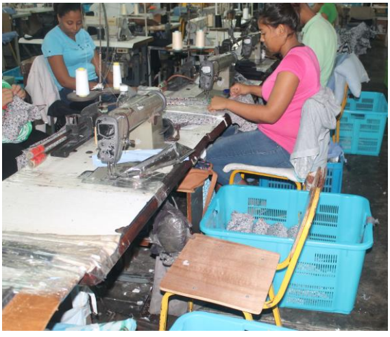
Figure 1: Non-Ergonomic Unpadded Seating

The WRC's health and safety specialist examined the chairs upon which the factory's sewing machine operators sit ( See Figure 1 ) and found that they are