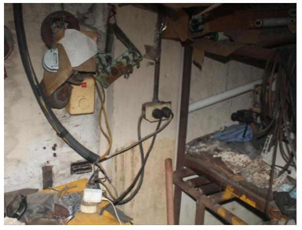
Figure 4: Unsafe Electrical Wiring in Maintenance Shop

However, the safety and health specialist also noted that a significant number of other electrical hazards that violate Dominican safety regulations<sup>41</sup> were still present in the plant. First, the factory's maintenance shop continues to lack a fiberglass (i.e., non-conductive) ladder for mechanics to use when doing work with or in proximity to energized ceiling lighting.<sup>42</sup> Moreover, inside the maintenance shop, itself, an electrical outlet runs through the junction box with metal-on-metal, and there is an electrical conduit which is broken with exposed conductors inside. (See Figure 4)