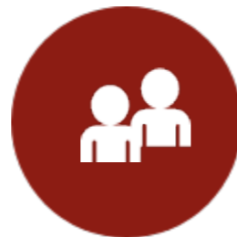
SharePoint Document - Discipline Tracking