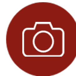
Body Worn Camera Access