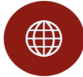
Power DMS (SFPD Intranet)