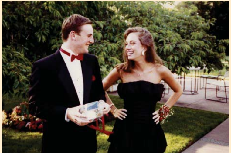
Look out Prom Queen!