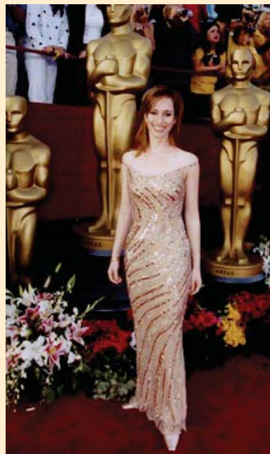
I would like to thank my agent, my family and all my fans...for this award!