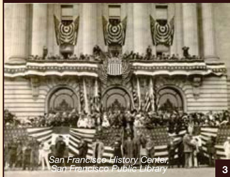
San Francisco History Center, San Francisco Public Library