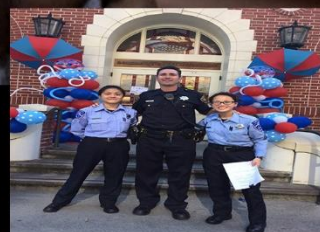
SF Police Activities League Organizing youth activities