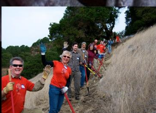
2017 Combined Charities information and goals