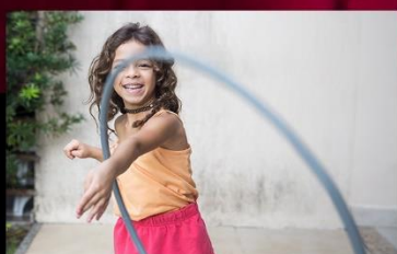
San Francisco Foster Youth Fund - Building Happiness